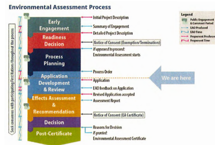
Figure 2: Typical Phasing of the BC Environmental Assessment Process

In this phase, the proponent has developed the application for an environmental assessment certificate. The application includes all of the technical studies and information required by the EAO in the next phase to assess the project's potential impacts.