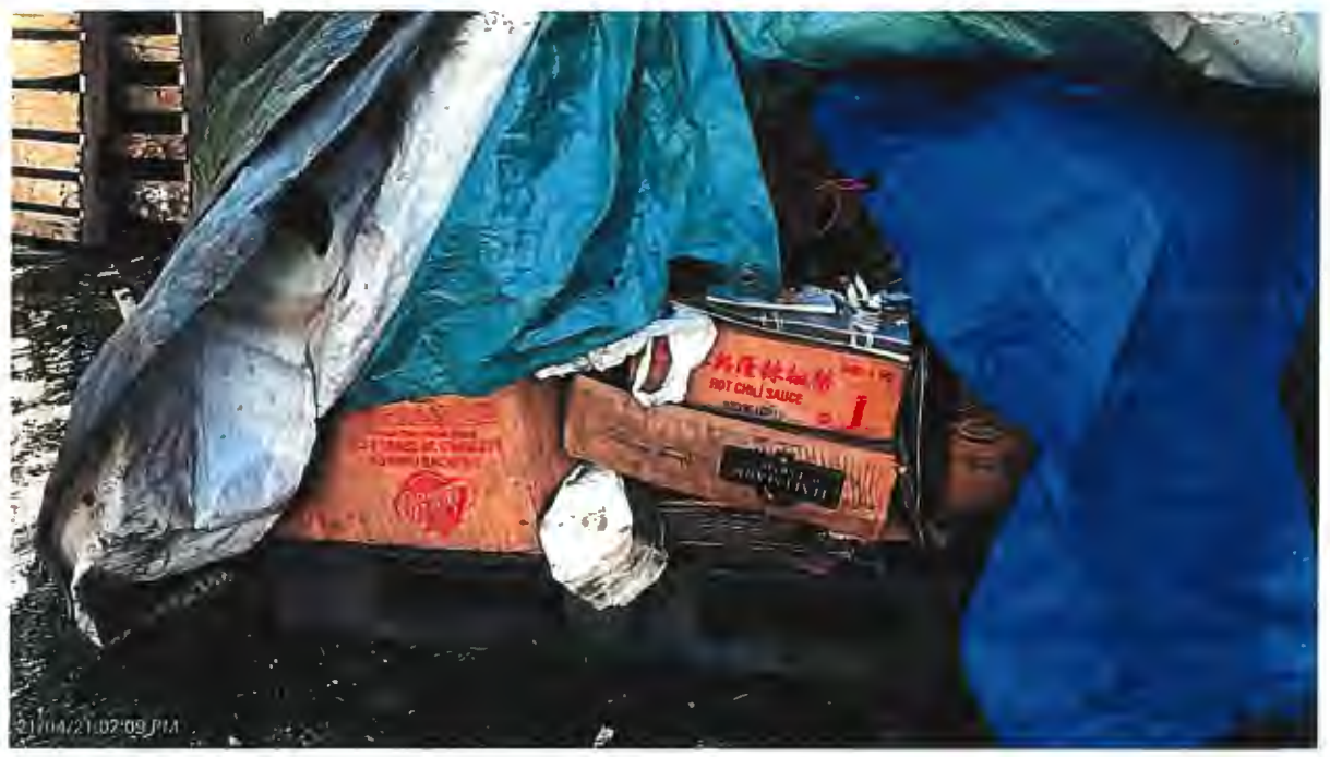
Photos of the backyard – Pallets throughout the yard. Under the tarps are boxes of books/newspapers 10100 Severn Drive – Photos taken April 21, 2021