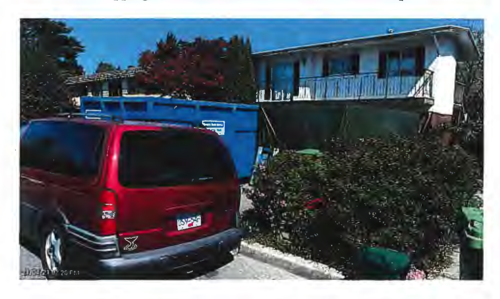
Two shipping containers in the driveway – one has a green tarp over it. 10100 Severn Drive – Photos taken April 21, 2021