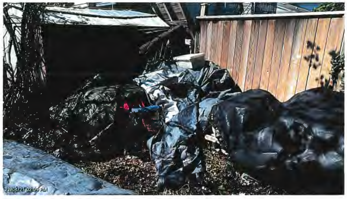
Photos of the backyard – Pallets throughout the yard. Under the tarps are boxes of books/newspapers 10100 Severn Drive – Photos taken April 21, 2021