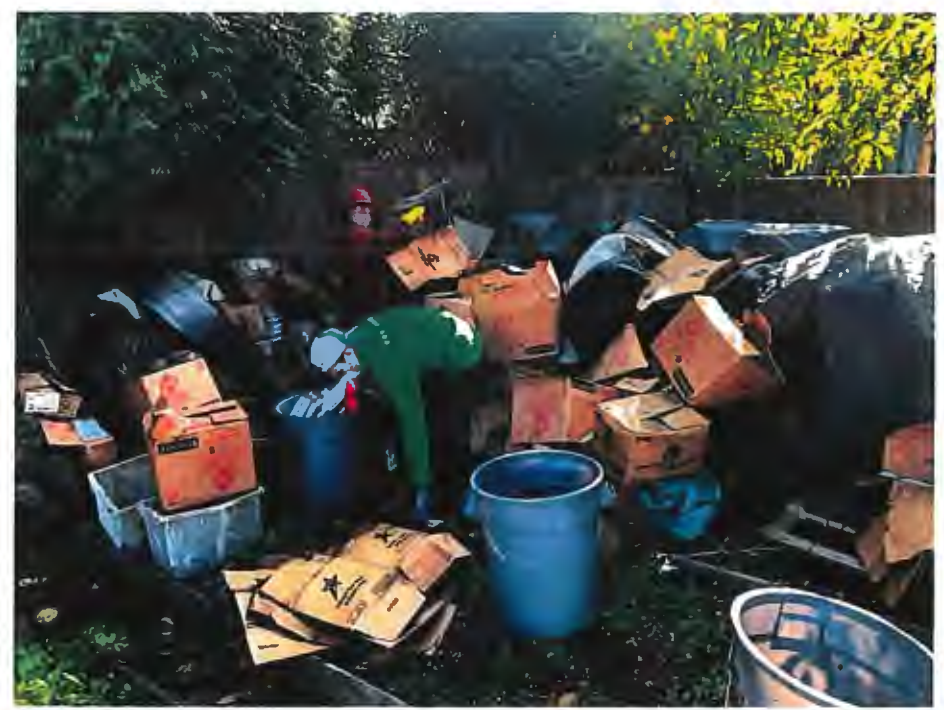
Photos of the backyard 10100 Severn Drive – Photos taken October 21, 2020