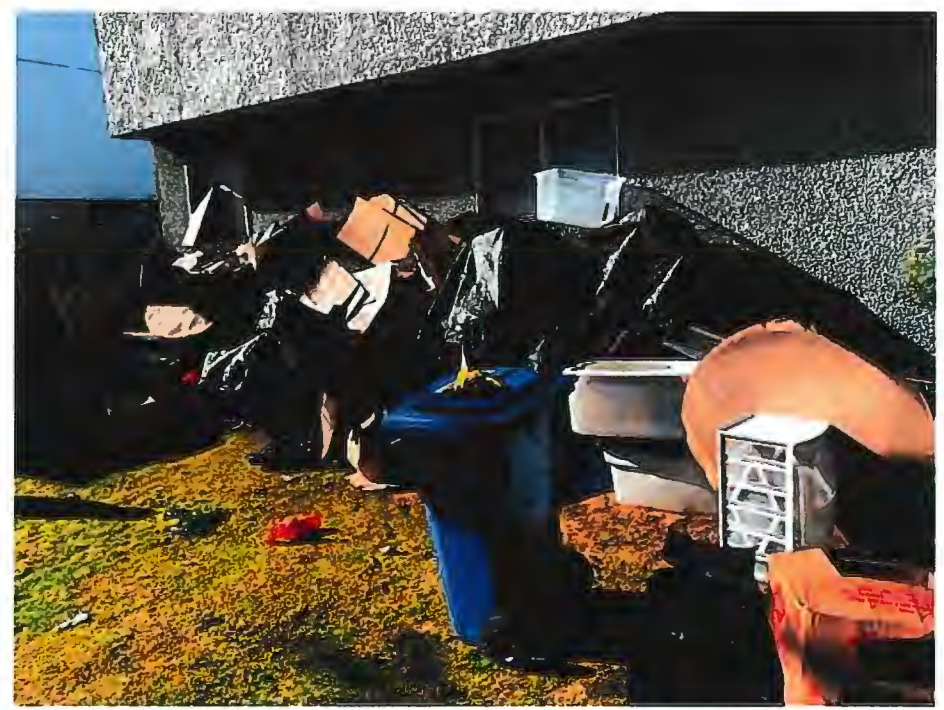
Photos of the backyard 10100 Severn Drive – Photos taken October 21, 2020