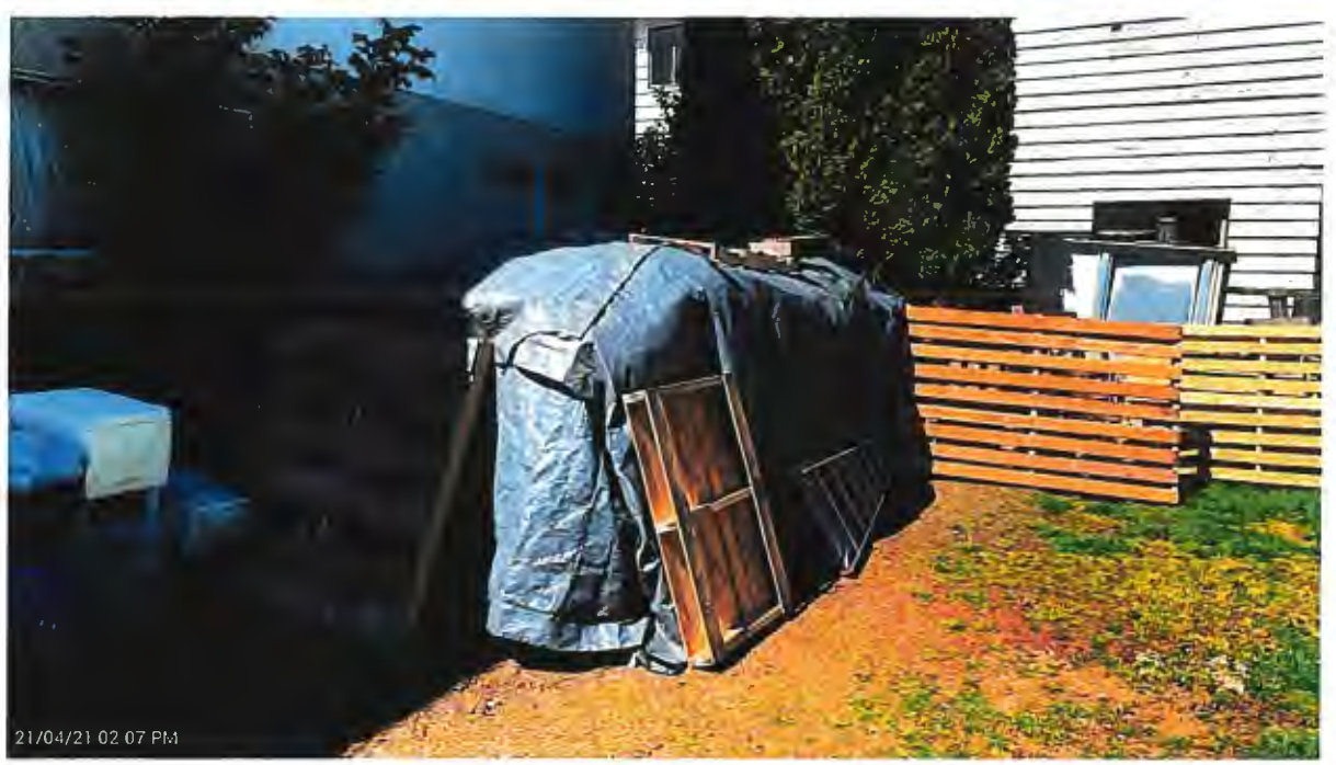
Photos of the backyard – Pallets throughout the yard. Under the tarps are boxes of books/newspapers 10100 Severn Drive – Photos taken April 21, 2021