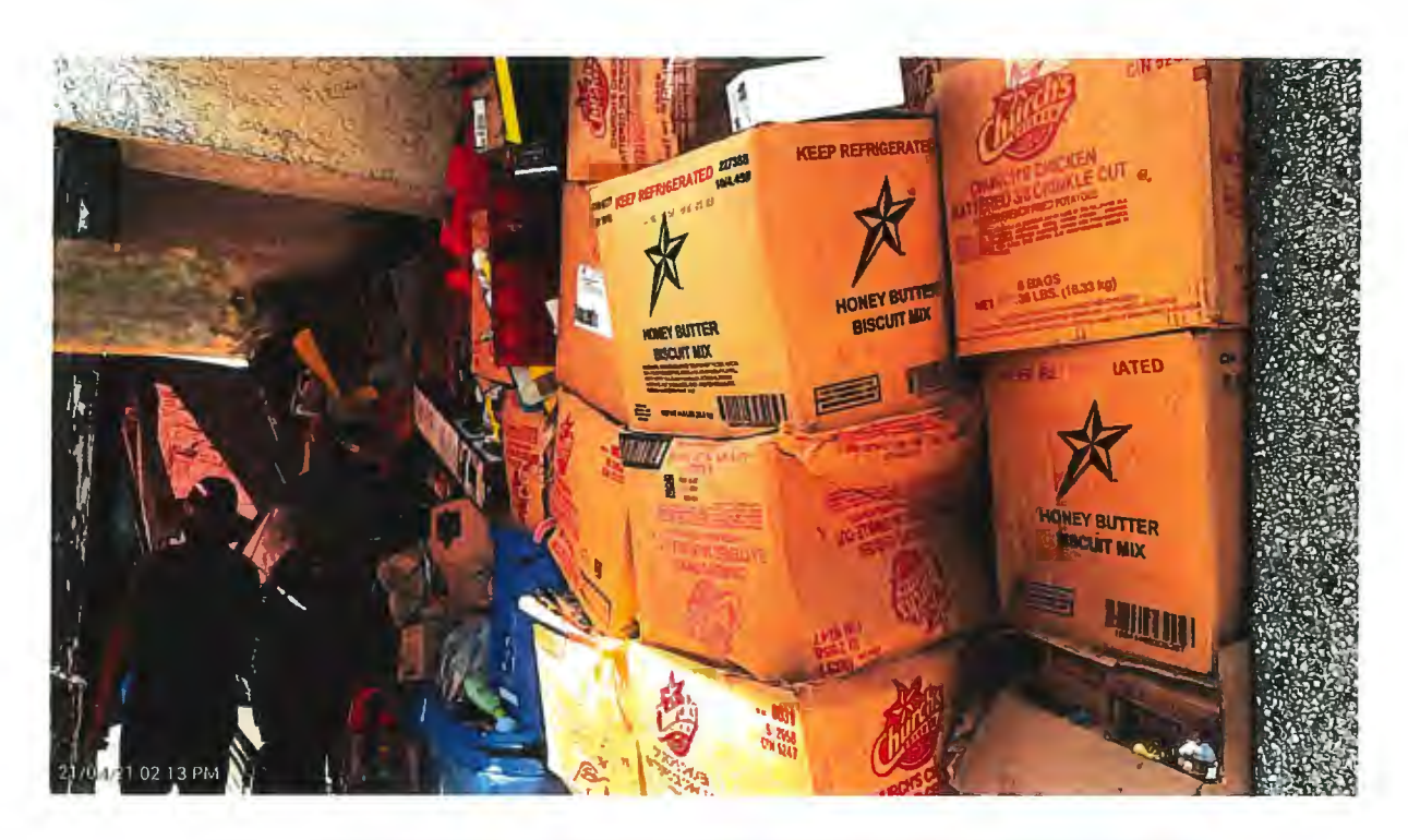
Carport is full of boxes of newspapers and books and two derelict vehicles. 10100 Severn Drive – Photos taken April 21, 2021