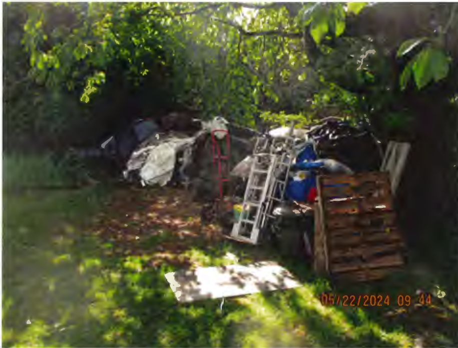
Photos of the backyard 10100 Severn Drive – Photos taken May 22, 2024