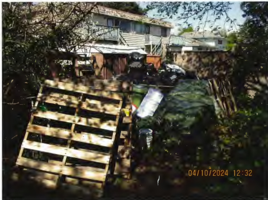
Photos of the backyard 10100 Severn Drive – Photos taken April 10, 2024