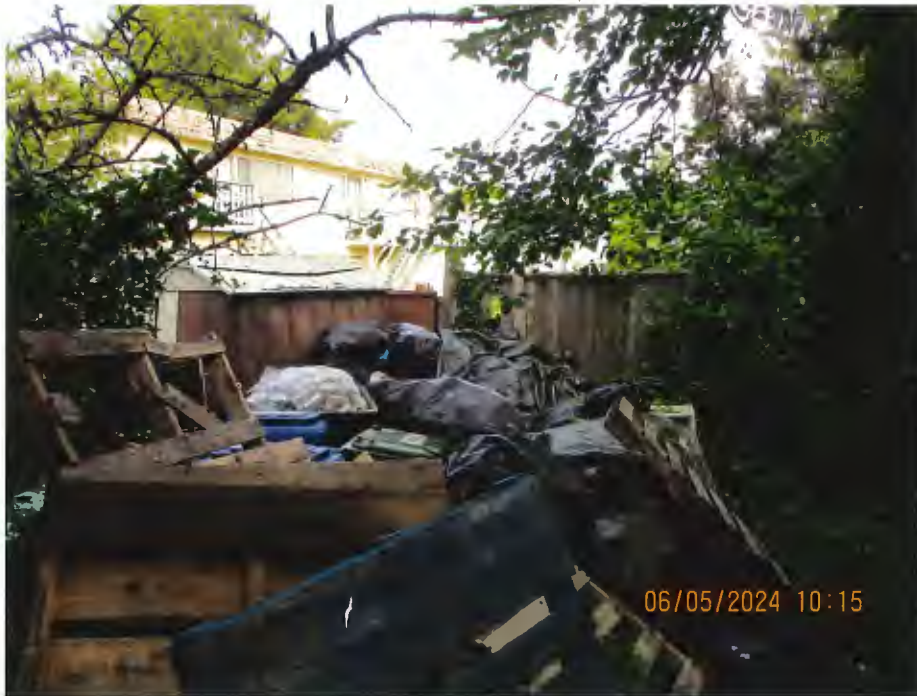
Photos of the backyard 10100 Severn Drive – Photos taken June 5, 2024