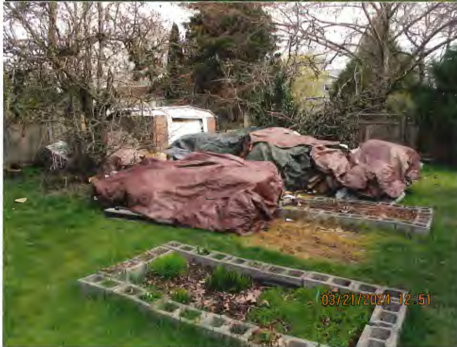
Photos of the backyard 10100 Severn Drive – Photos taken March 21, 2024