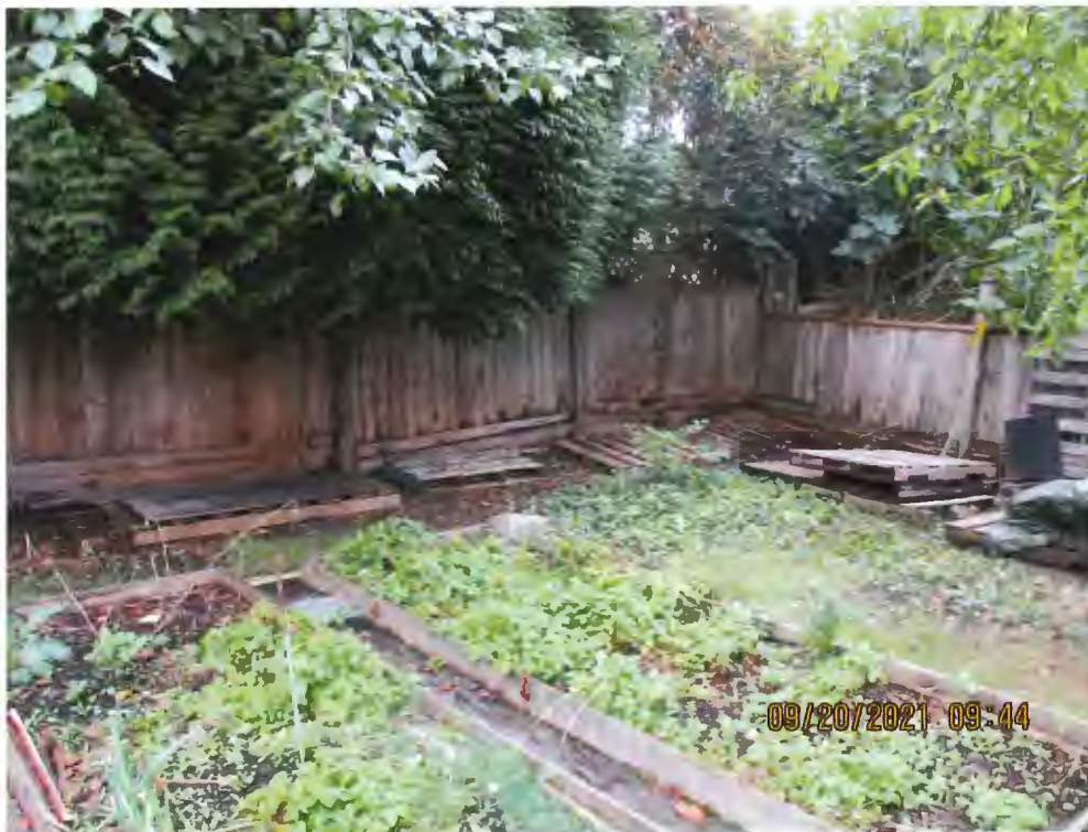
Pallets in the backyard on the South West corner (discarded materials have been removed/pallets remains the same)