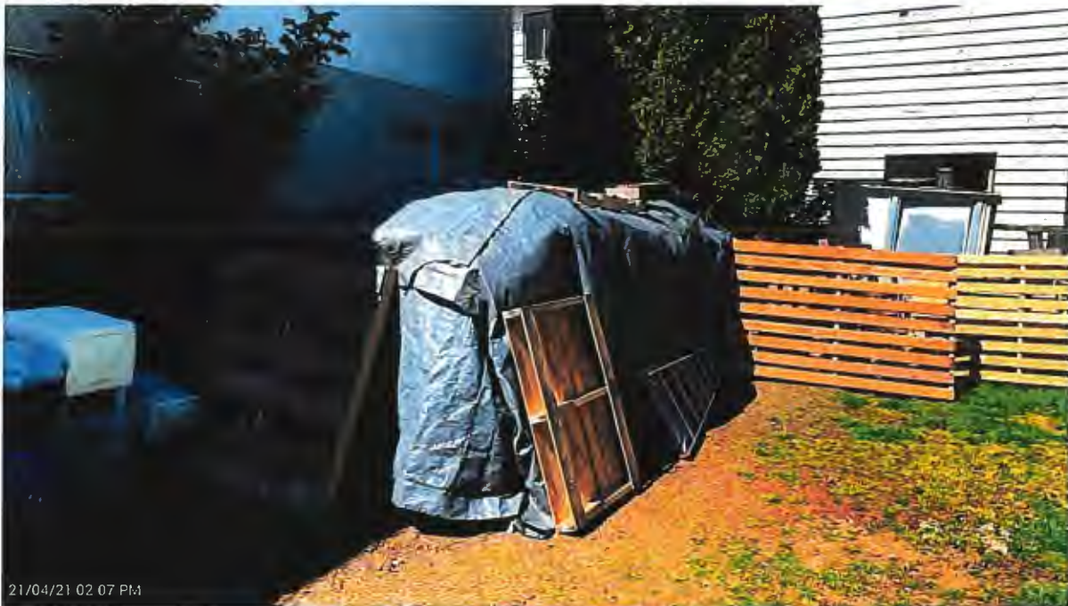
Photos of the backyard – Pallets throughout the yard. Under the tarps are boxes of books/newspapers 10100 Severn Drive – Photos taken April 21, 2021