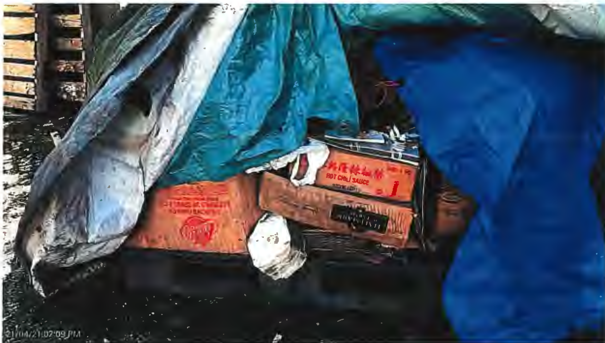
Photos of the backyard – Pallets throughout the yard. Under the tarps are boxes of books/newspapers 10100 Severn Drive – Photos taken April 21, 2021