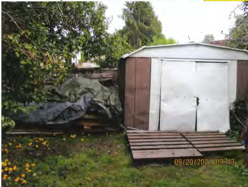
Pallets in the backyard stacked on the fence on the North Side (remains the same)