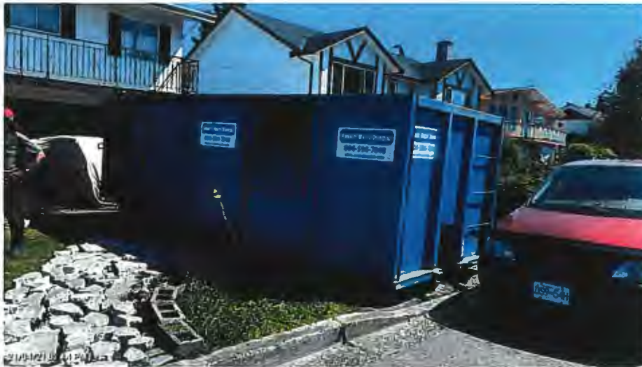
Shipping container and derelict vehicle covered up.