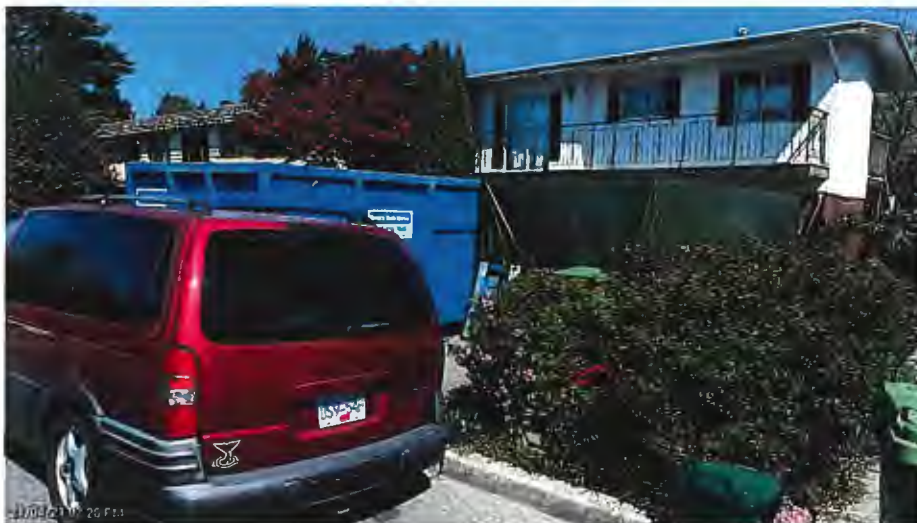
Two shipping containers in the driveway – one has a green tarp over it. 10100 Severn Drive – Photos taken April 21, 2021