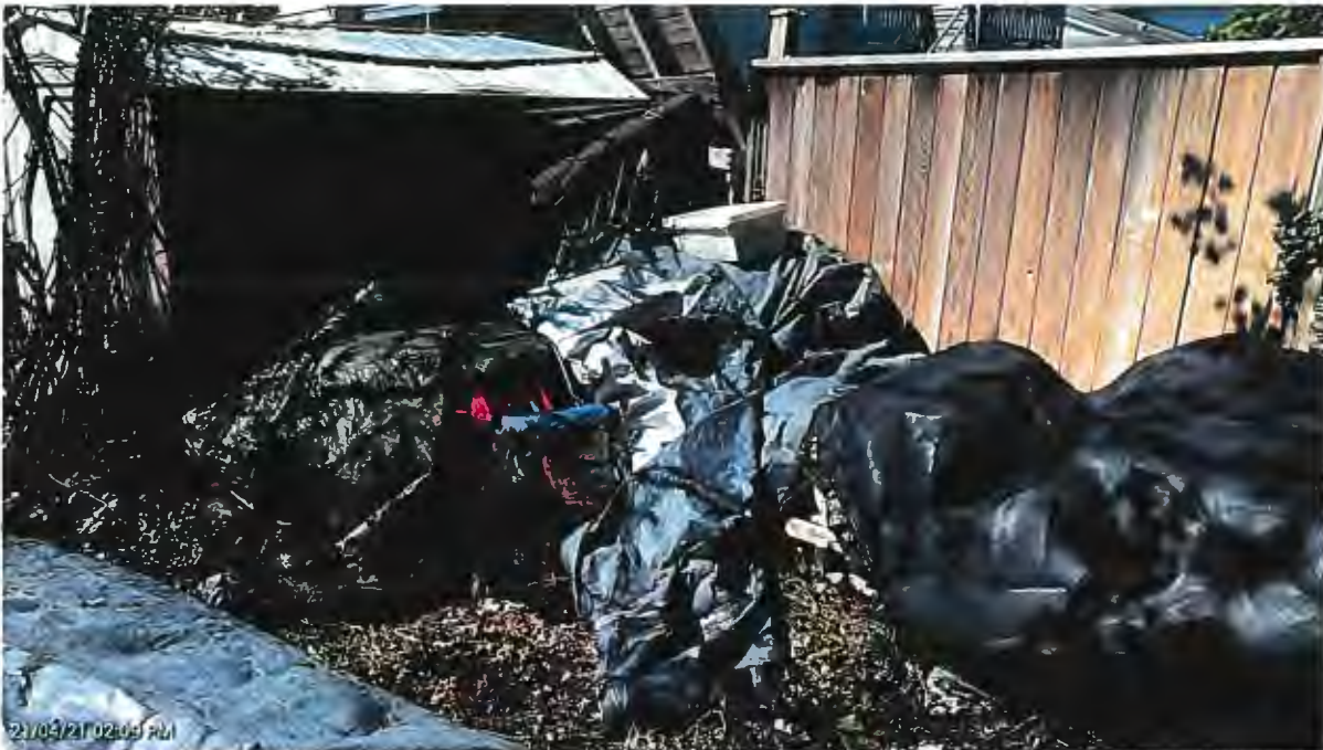
Photos of the backyard – Pallets throughout the yard. Under the tarps are boxes of books/newspapers 10100 Severn Drive – Photos taken April 21, 2021