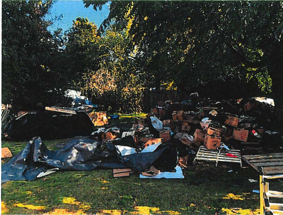
Photos of the backyard 10100 Severn Drive – Photos taken October 21, 2020