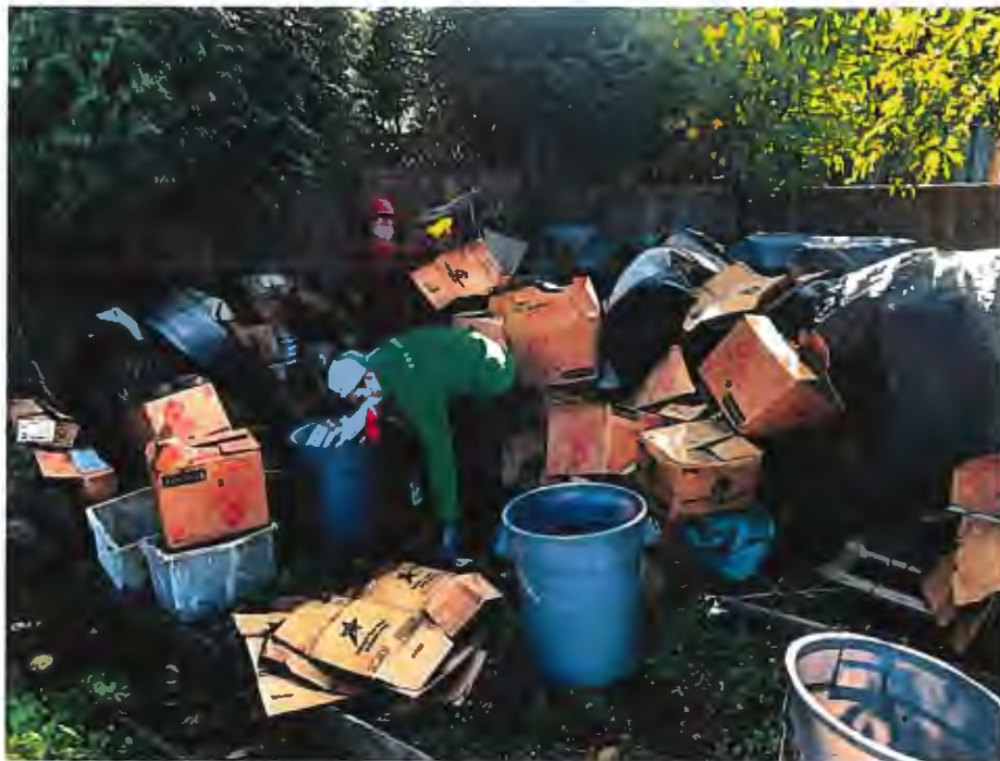
Photos of the backyard 10100 Severn Drive – Photos taken October 21, 2020