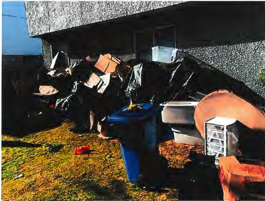
Photos of the backyard 10100 Severn Drive – Photos taken October 21, 2020