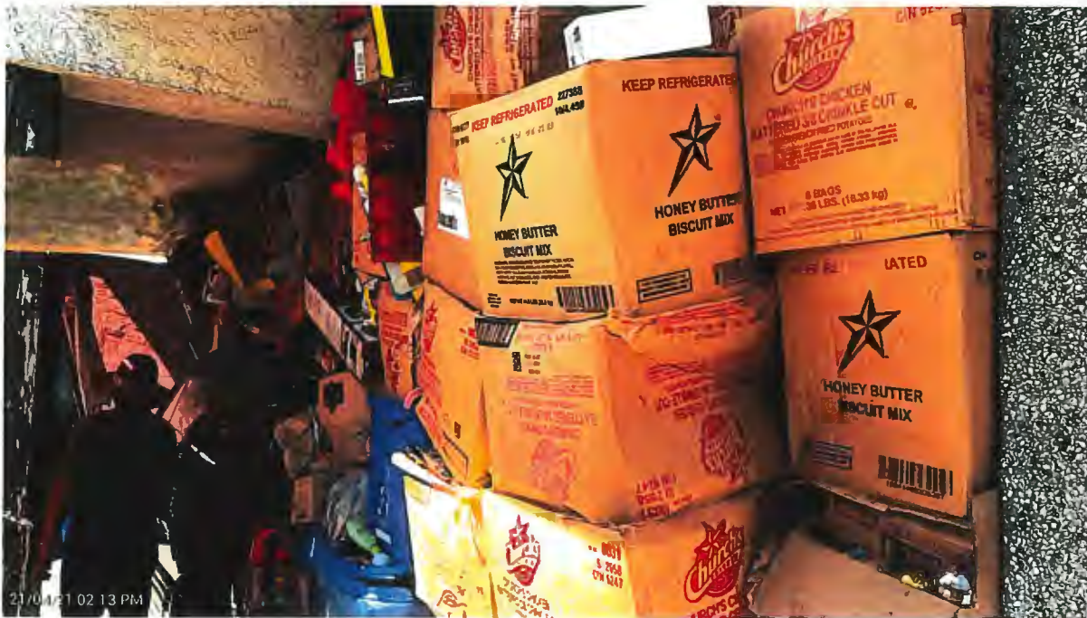
Carport is full of boxes of newspapers and books and two derelict vehicles. 10100 Severn Drive – Photos taken April 21, 2021