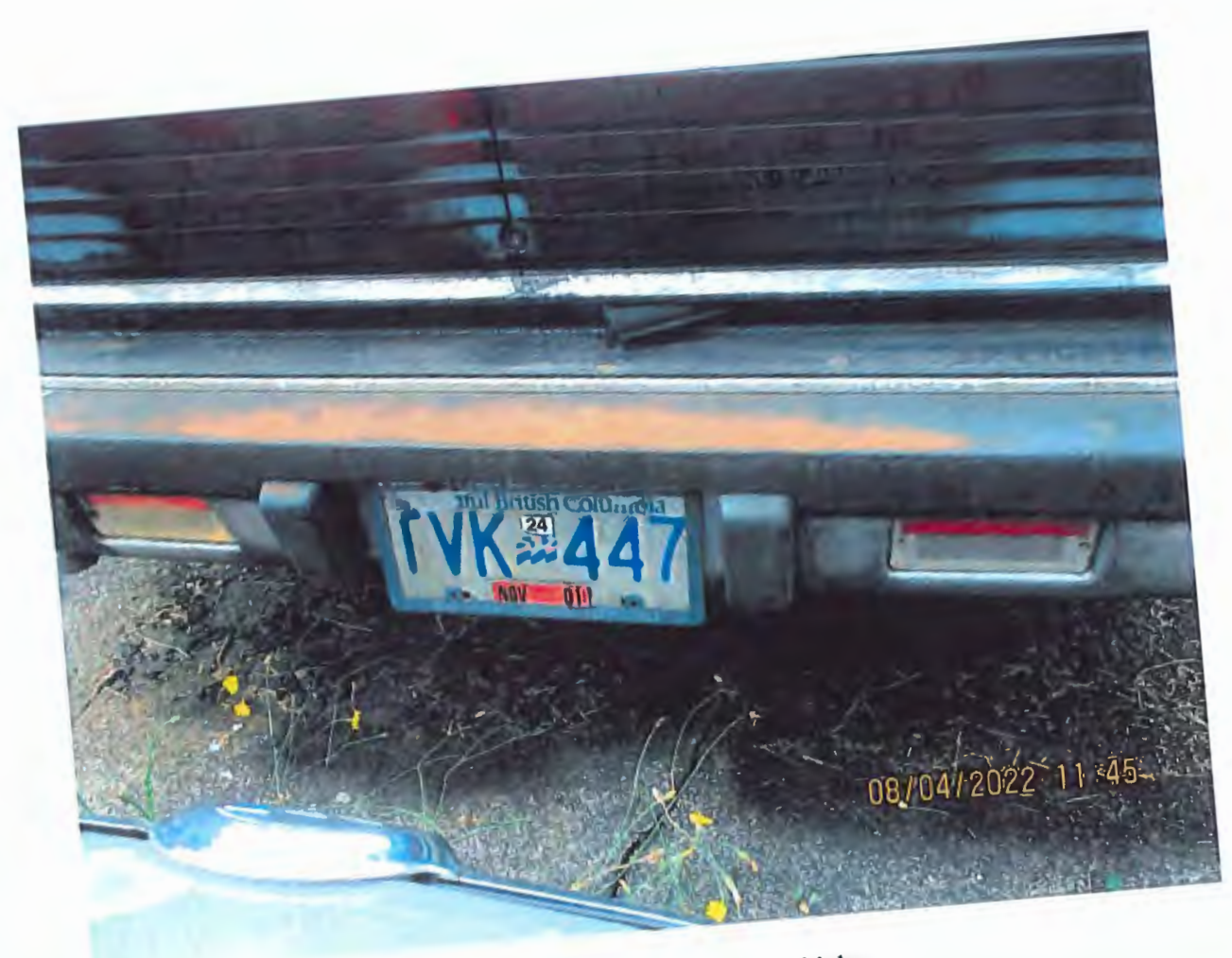
Photo of one of the derelict vehicles 10411 Southgate Road - August 4, 2022