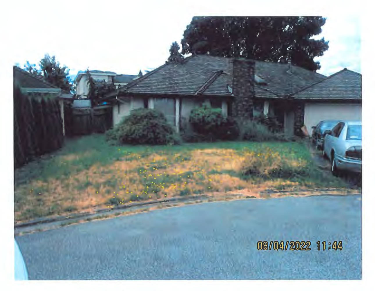
Photo of the front yard showing two derelict uninsured vehicles 10411 Southgate Road - August 4, 2022