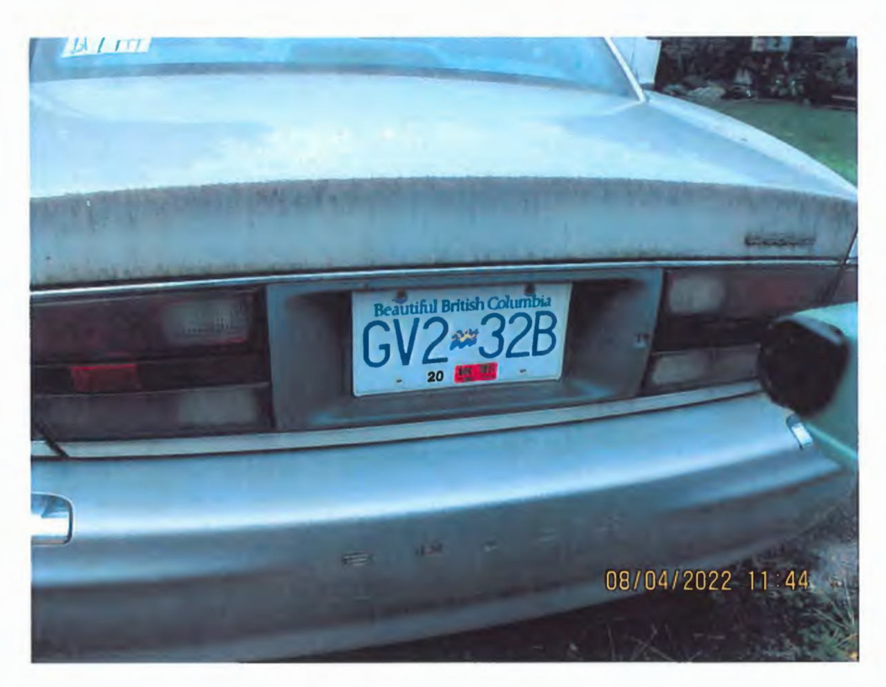
Photo of one of the derelict vehicles 10411 Southgate Road - August 4, 2022