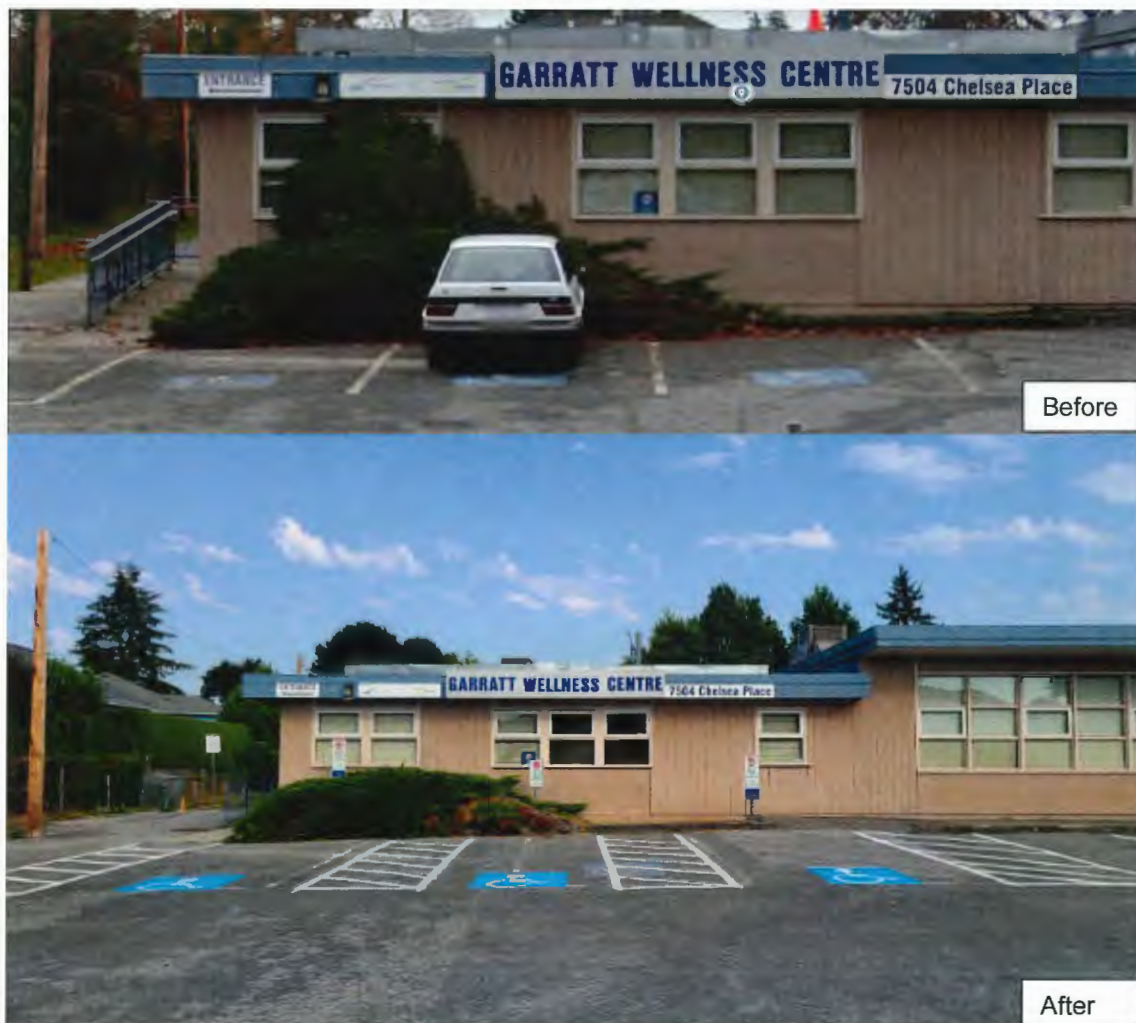
Figure 2: Before and After Accessible Parking Stall Layout at Garratt Wellness Centre

A funding need of $50,000 (2022 dollars) is estimated to implement the van accessible parking enhancements at the remaining locations (27 sites) and the annual Operating Budget Impacts (OBI) to complete maintenance and re-painting on a 3 to 5 year cycle is $5,000.