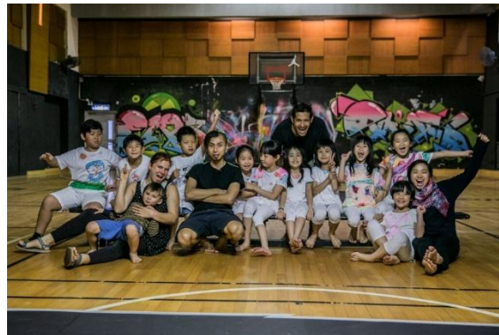
Dancing in My Imaginative Space (2016)

This community-engaged interdisciplinary project integrating movement and video depicts a similar approach to community engagement, participant-led creation, and shared gathering/celebration that will inform Sounds Like Home .