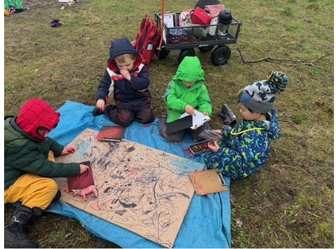
Figure 2 and 3. Terra Nova Nature School