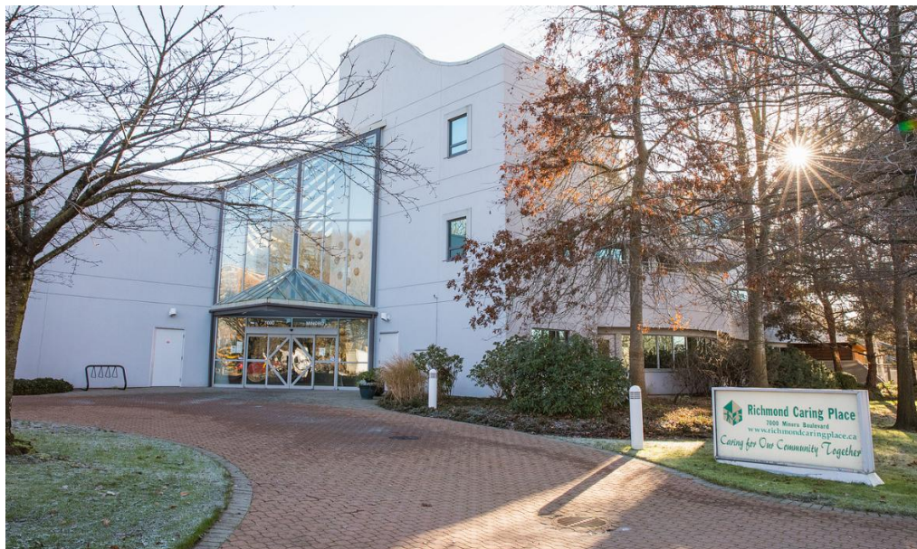
Figure 1. Richmond Caring Place / S.U.C.C.E.S.S.