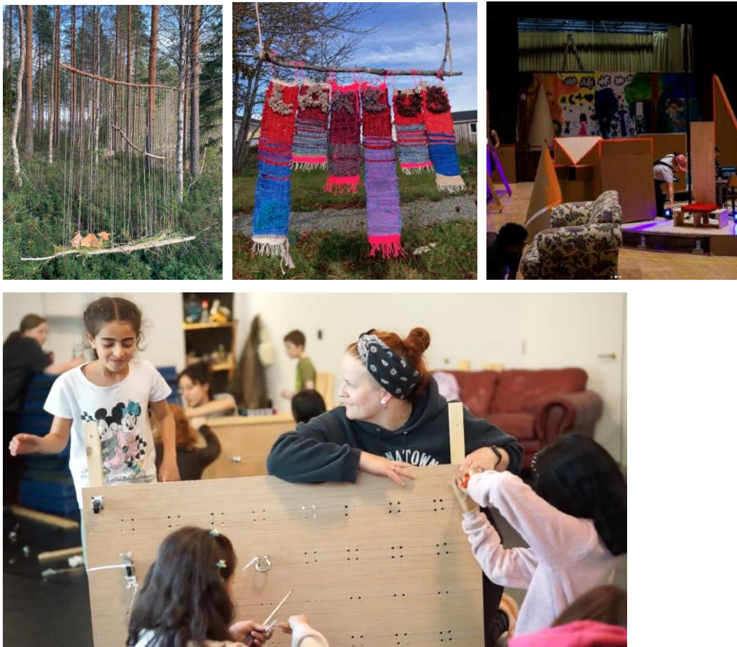
From left to right: These are examples of art installations using natural materials, harvesting, weaving projects and experimental hands-on art activities in the classroom.