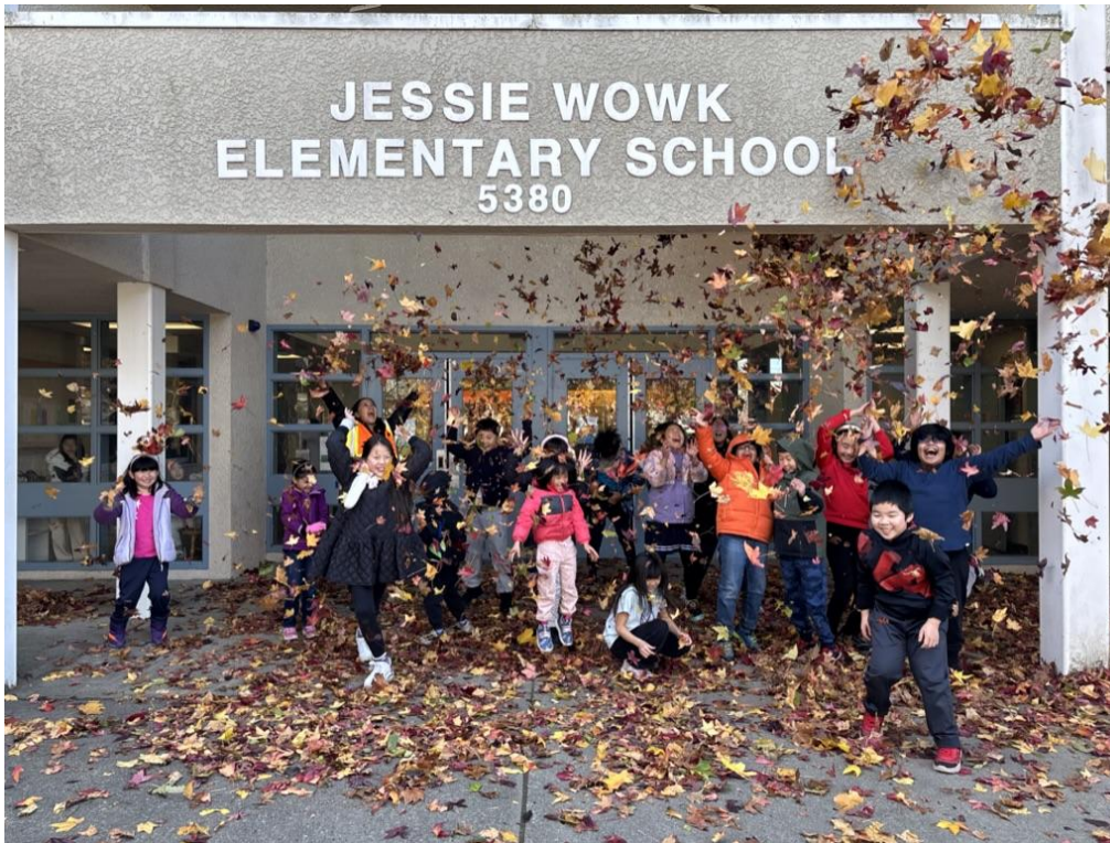
Figure 1. Jessie Wowk Elementary School.