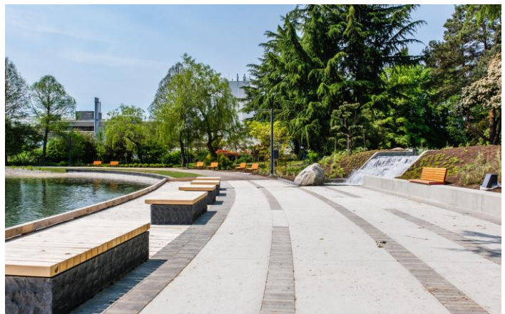
Figure 2. and 3. Minoru Park