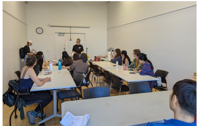
Figure 4. and 5. Richmond Caring Place Multi-Purpose Room and Richmond Cultural Centre Annex Butterfly Room