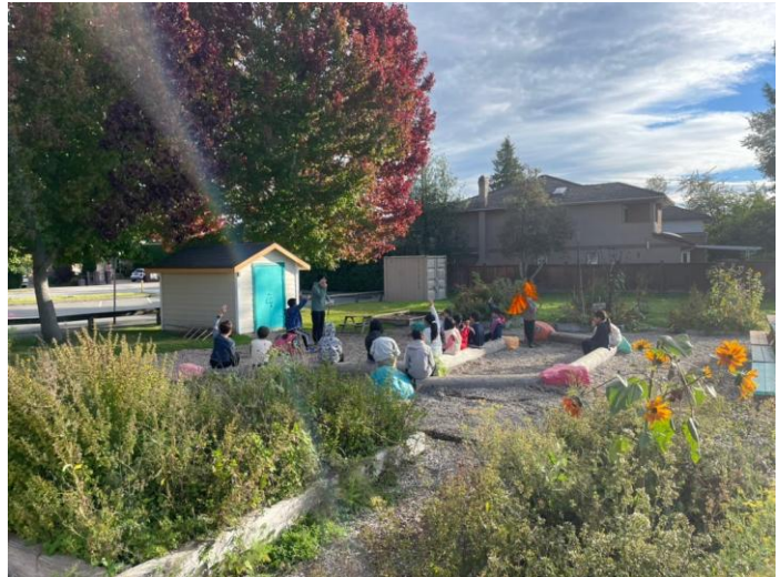
Figure 2 & 3. Jessie Wowk Elementary multipurpose gathering spaces. A new Outdoor Learning Space offers opportunities to explore and engage in a variety of materials to deepen understanding of, and relationship with, land and place.