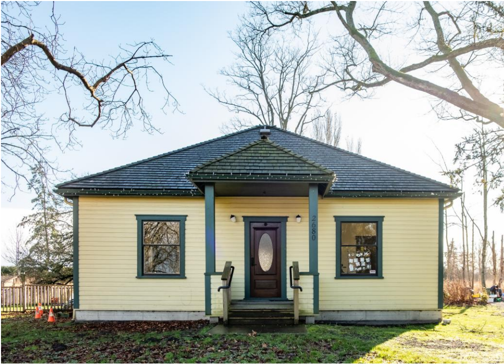
Figure 1. Terra Nova Nature School, 2680 River Road