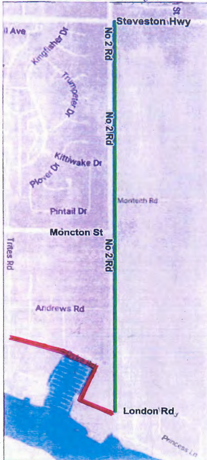
No. 2 Road Box Culvert Alignment