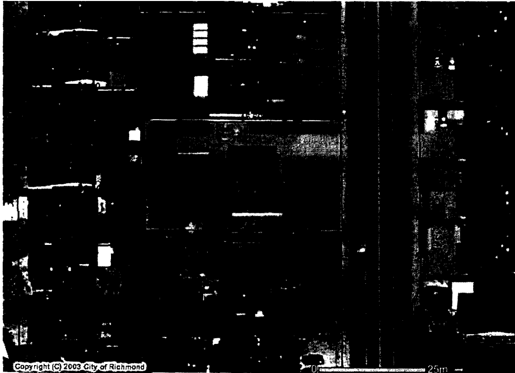
Site Aerial Photo – Taken May 2002

R1/B zoned single family lots 13.45 m (44.13 ft.) in width and several R1/E zoned single family lots ranging from 15.24 m (50.0 ft.) to 22.86 m (75.0 ft.) in width.