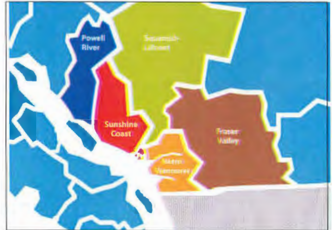
The SWBC Bioregion includes Metro Vancouver, the Fraser Valley, Sunshine Coast, Squamish Lillooet, and Powell River Regional Districts, and the traditional territories of the Coast Salish People

Bioregions are areas that share similar topography, plant and animal life, and human culture. They are largely based on eco-regions but also incorporate human settlement areas, activity patterns, and political boundaries. The SWBC Bioregion includes Metro Vancouver, the Fraser Valley, Sunshine Coast, Squamish Lillooet, and Powell River Regional Districts, and the traditional territories of the Coast Salish People.