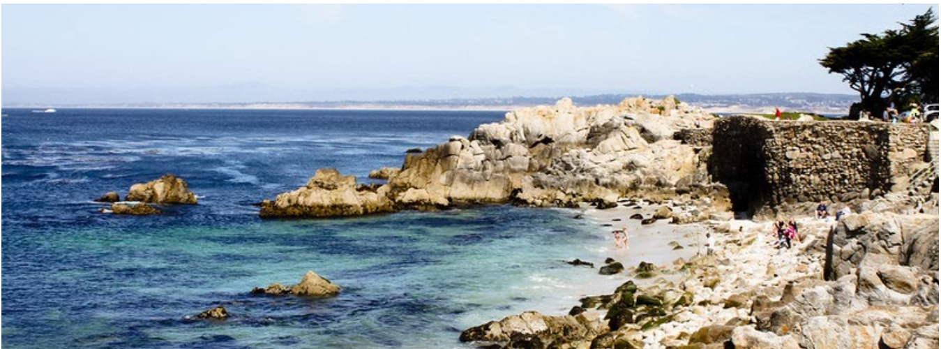
California coast.

The Act guarantees public access to the coast and prohibits development from interfering with that access. It also requires “conspicuously posted” signage to encourage access. 35 The Act requires appropriate and feasible public facilities (including parking) to be distributed throughout an area to mitigate against impacts of overcrowding or overuse, and provides safeguards to prevent visitor and recreational facilities from becoming unaffordable. 36