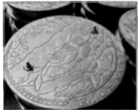
Cover Stories , Susan Pearson, Richmond, 2016

In 2016, 200 cast-iron sewer covers were ordered featuring the four winning designs (50 of each). To date, approximately 60 covers have been installed throughout the City on sidewalks with high pedestrian visibility in the City Centre and Steveston—including one on a boardwalk at Britannia Shipyards National Historic Site. Additional covers are to be installed as replacements for worn covers and as new streets are constructed along with new development.