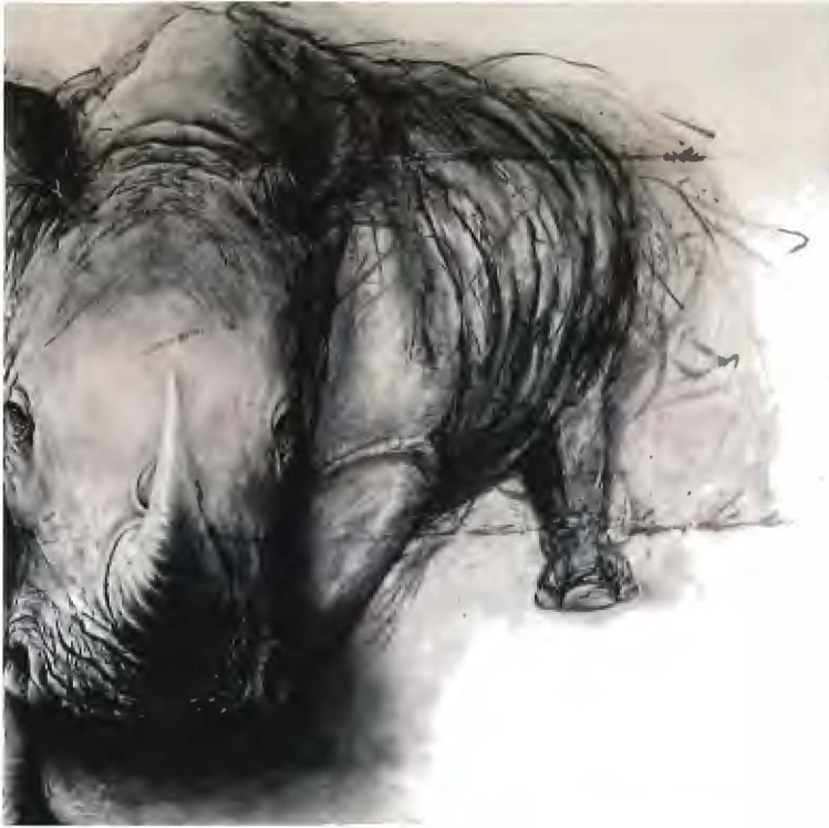
Fiona Tang, Northern White Rhino , Charcoal on paper, 2015