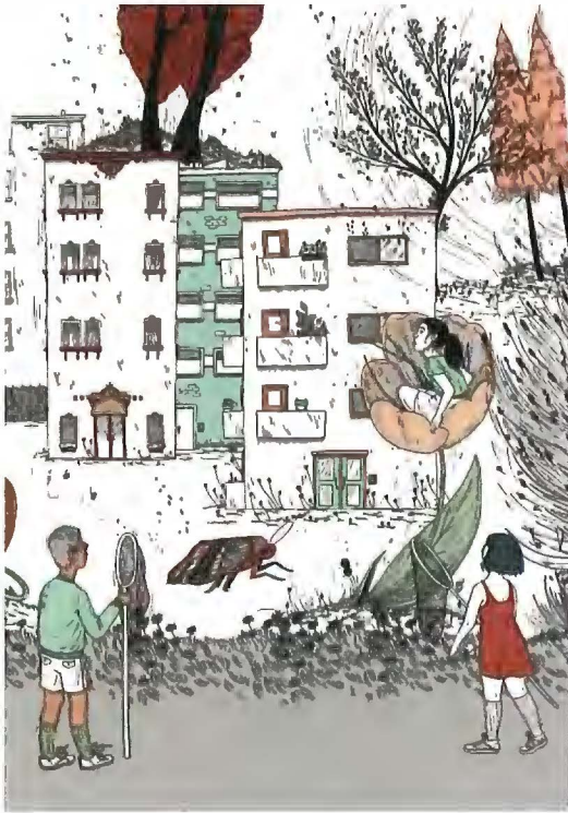
April de la Noche Milne, art vinyl wrap, commissioned by the City of Vancouver, 2017