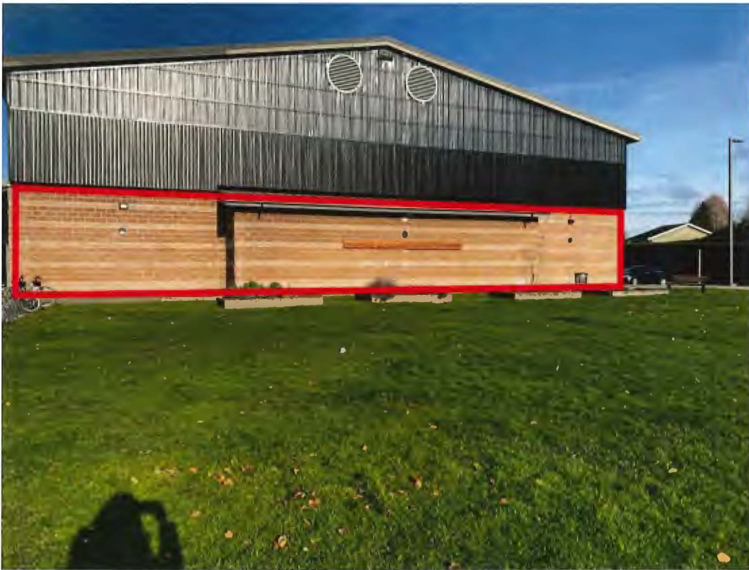
Proposed mural wall at McMath Secondary School (approx. 1400 square feet)