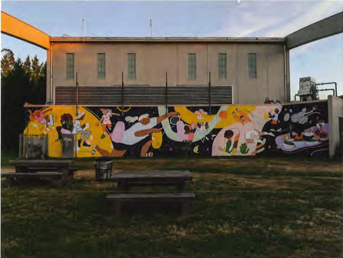
Popo and Lola, A mid-way point: the present is an infinite moment , Thompson Community Centre, 2020