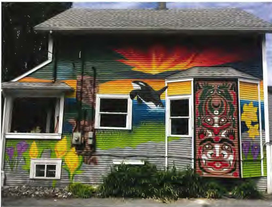
Atheana Picha, Hole in the Sky , 2018, private residence, Vancouver