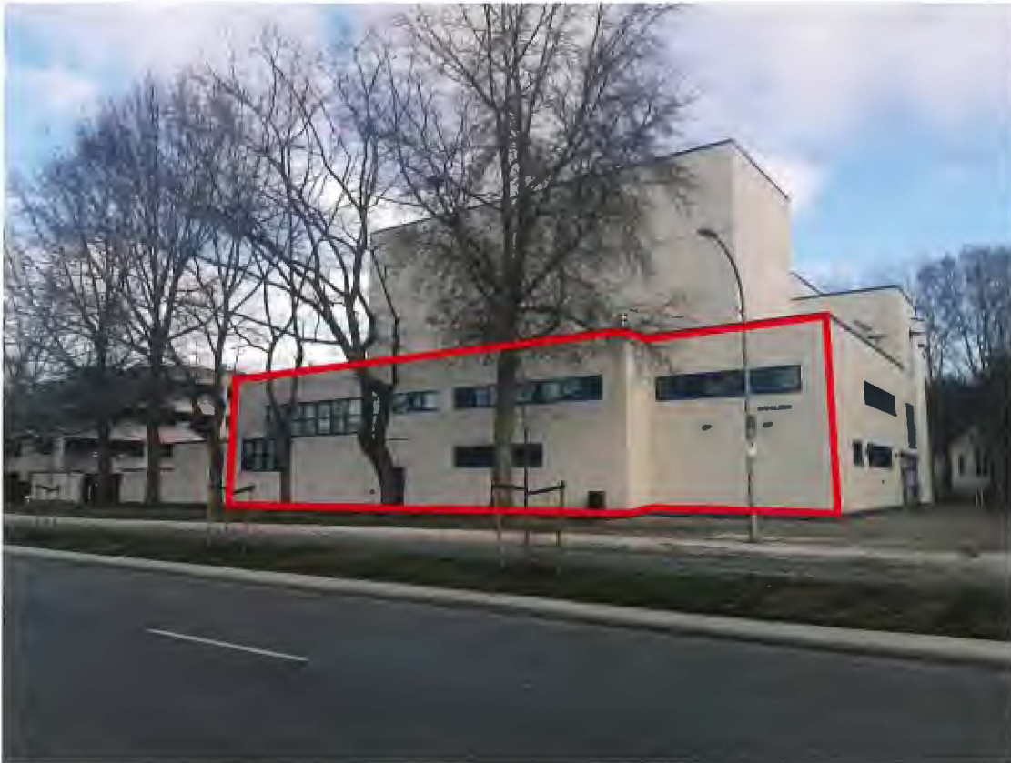
Proposed mural wall at Gateway Theatre (approx. 2,500 square feet)