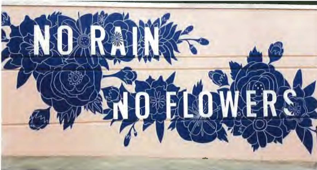
Carmen Chan, No Rain, No Flowers , Vancouver Mural Festival, 2018