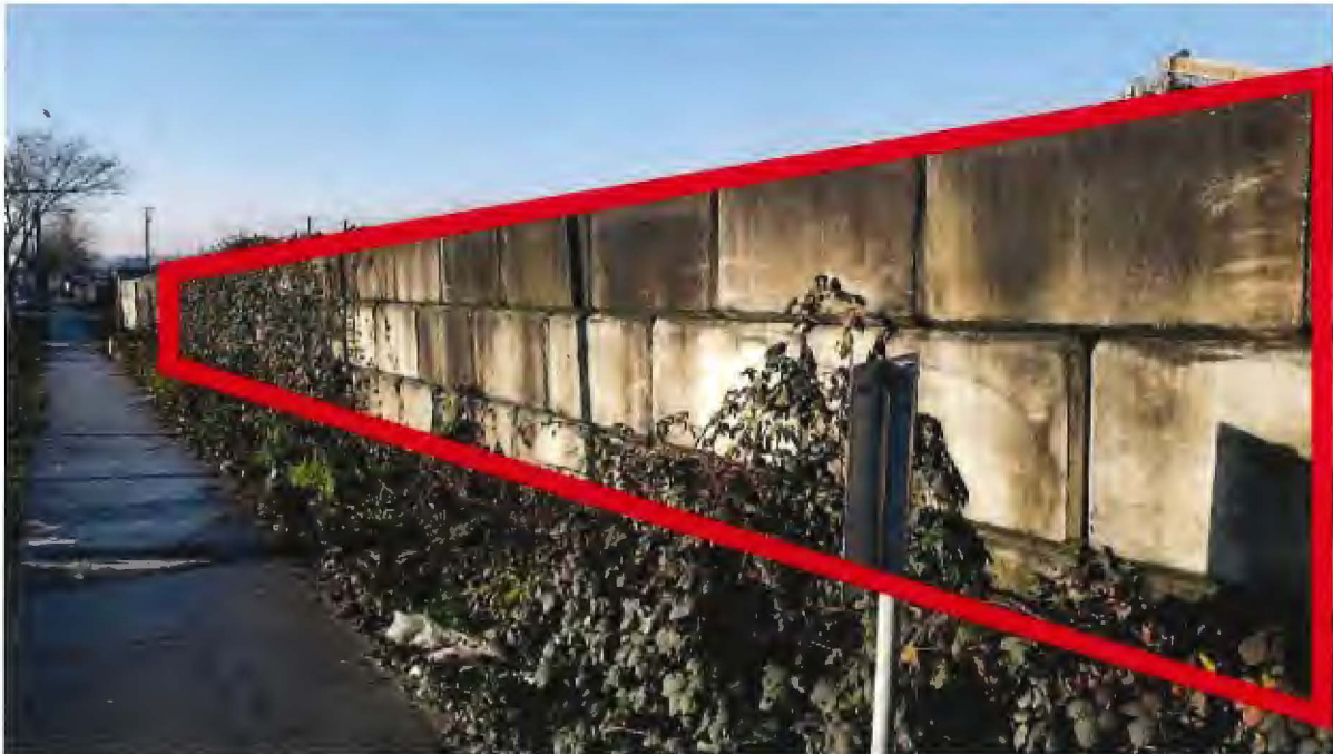
Proposed mural walls at Lehigh Hanson (approx. 1,125 square feet combined)