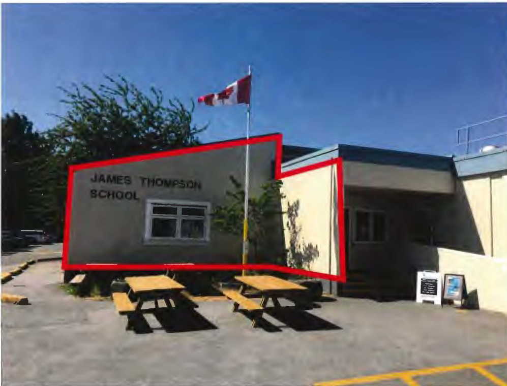
Proposed mural wall at Thompson Elementary School (approx. 500 square feet)