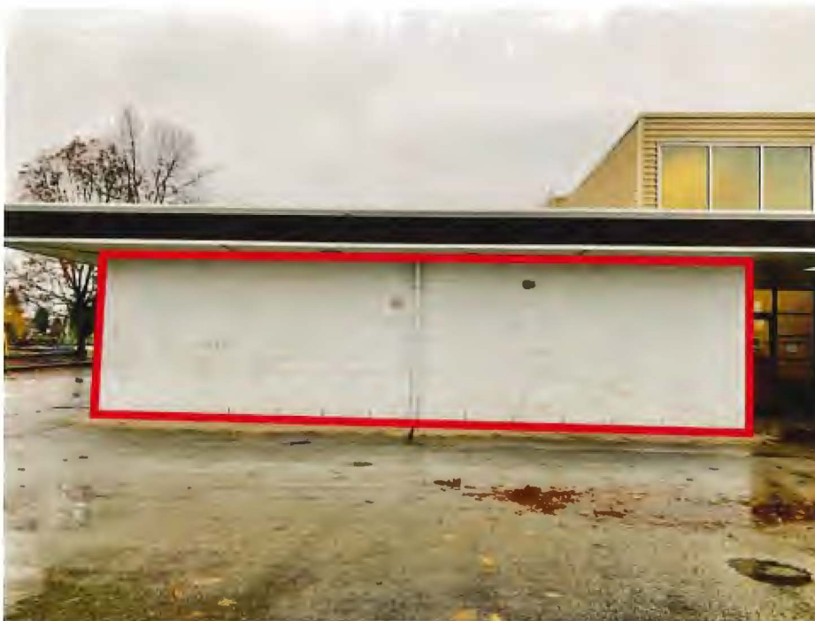
Proposed mural walls at Tomekichi Homma Elementary School (two identical walls at each end of the school, (approx. 450 square feet each)