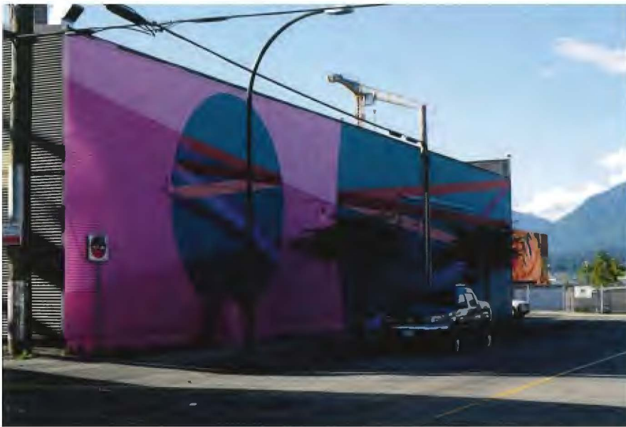
Tristesse Seeliger, Vancouver Mural Festival, The Infinite Line , 2017