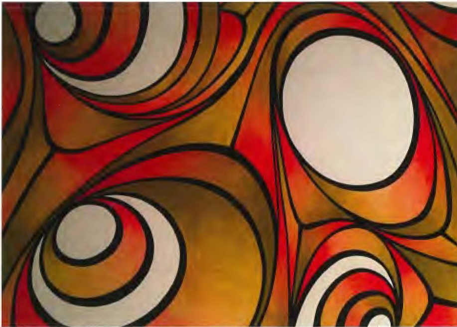
Atheana Picha, Wolf , 2019, gouache on paper