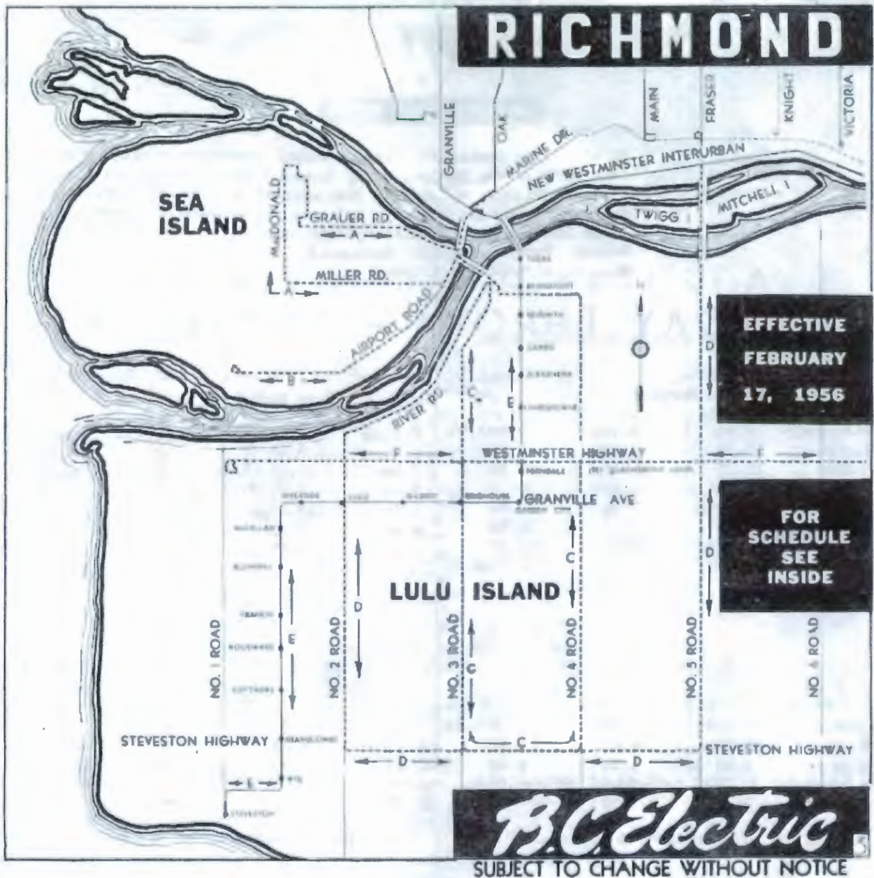
Figure 1: Richmond Tram Stops, 1956

The Steveston Area Conservation Strategy, created in 2009, was put in place to conserve the heritage character of Steveston Village. Bylaws, guidelines and incentives help conserve the original heritage character of the exterior of identified heritage buildings and streetscapes. The Steveston Village Conservation Strategy identifies the core themes for preserving the heritage character. This includes elements typical to a small frontier town such as, “street and lane patterns and building design which all show characteristics in common with most burgeoning small settlements in the West”. Additionally it states that “Steveston is valued for the extent of its historic character and intrinsic heritage values, seen less in individual buildings than