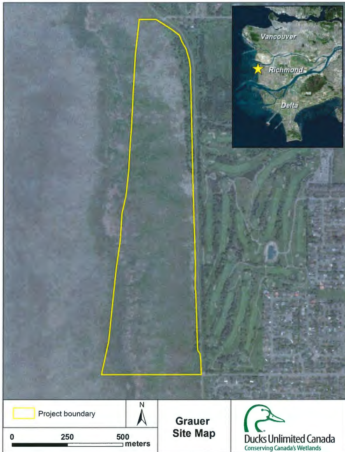
Figure 1. Location and boundary of the Grauer property in Richmond, BC.