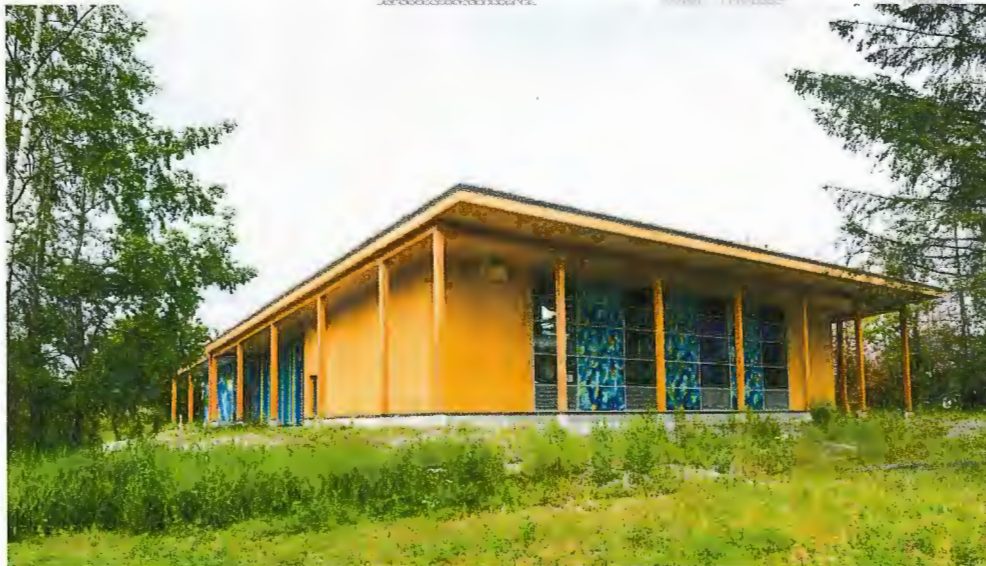
Figure 5 – Alexandra District Energy Utility Building in the north portion of the West Cambie Neighbourhood Park