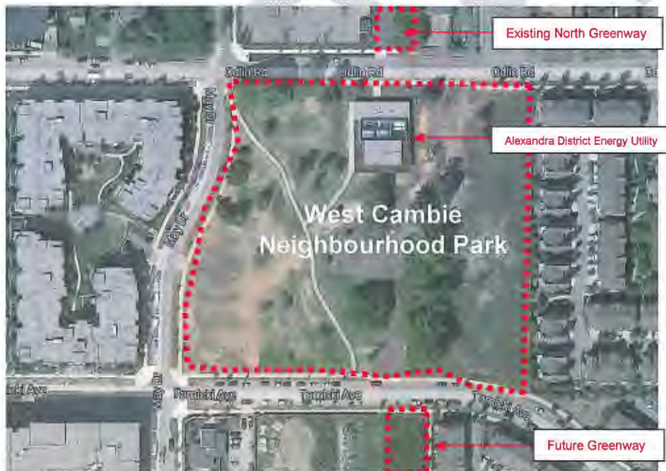
Figure 3 – West Cambie Neighbourhood Park