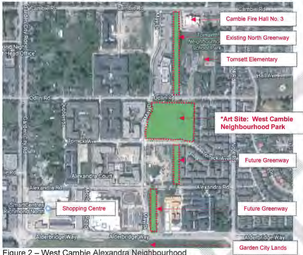
Figure 2 – West Cambie Alexandra Neighbourhood