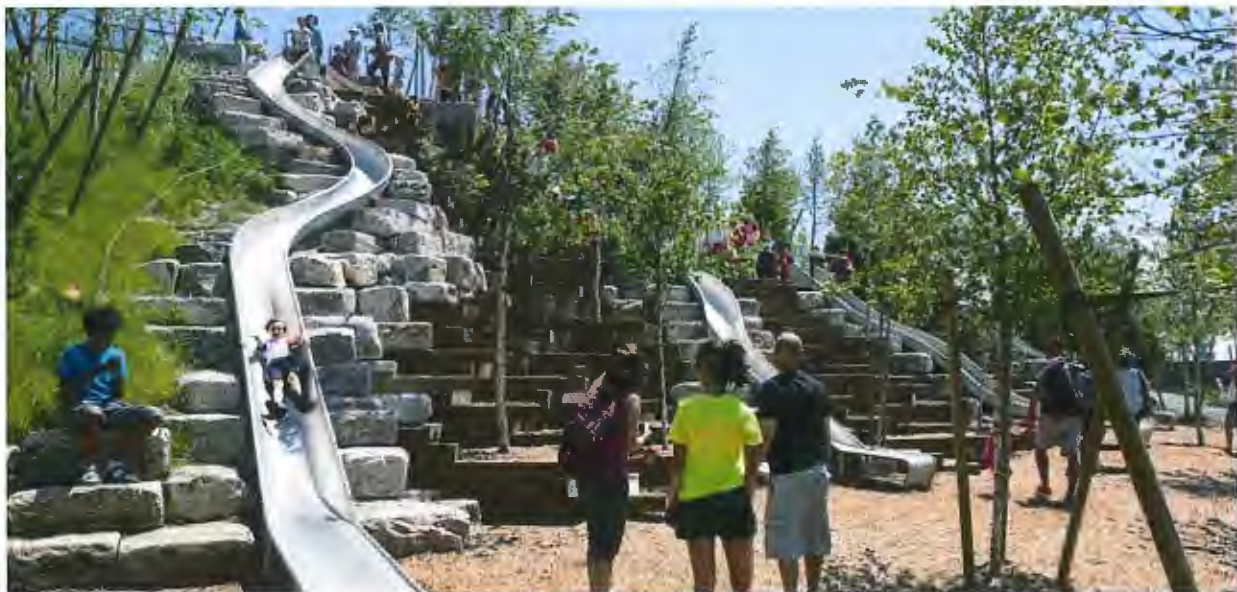
Governor Island The Hills, New York, West 8, 2016