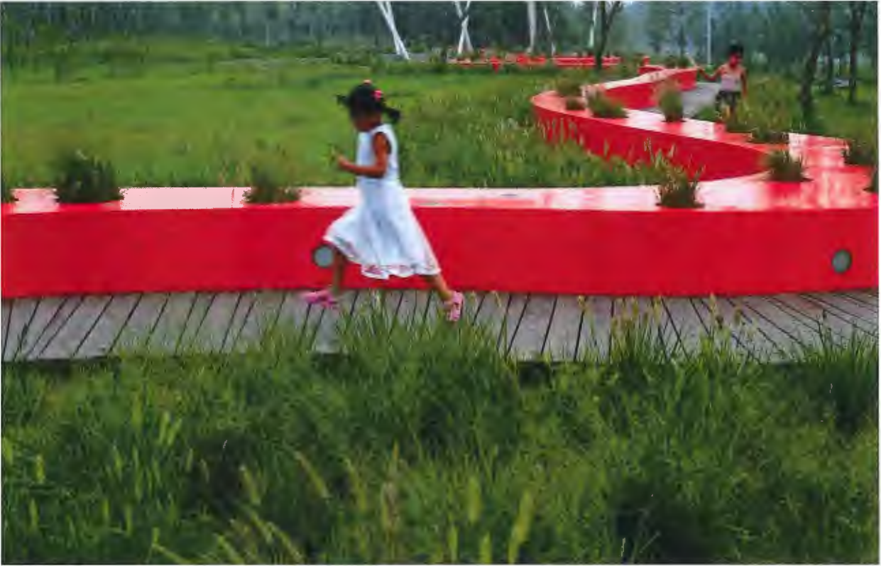
The Red Ribbon, Tanghe River Park, Kongjian Yu, China, 2006