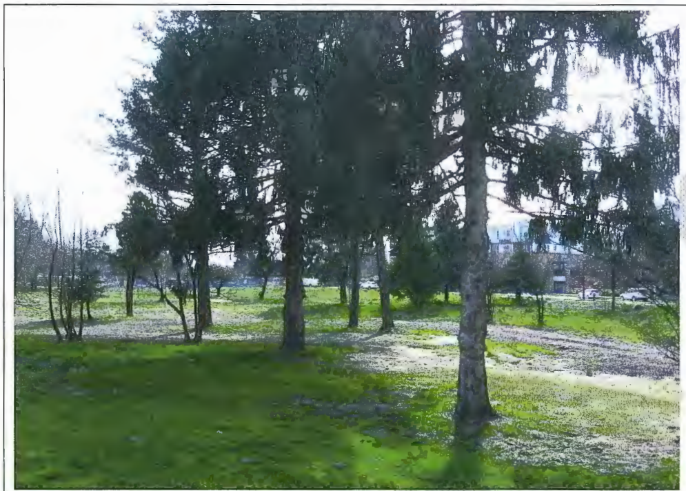
Figure 1 – West Cambie Neighbourhood Park in the Alexandra Neighbourhood