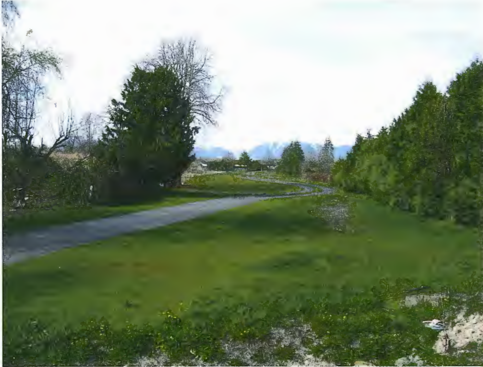
Figure 4 – North Alexandra Greenway, facing north