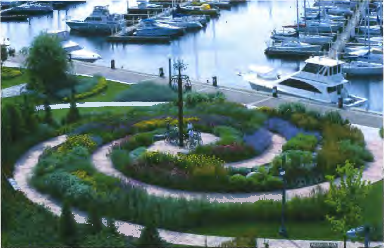
Toronto Music Garden, Yo-Yo Ma and Julie Moir Messervy, Toronto, 2005