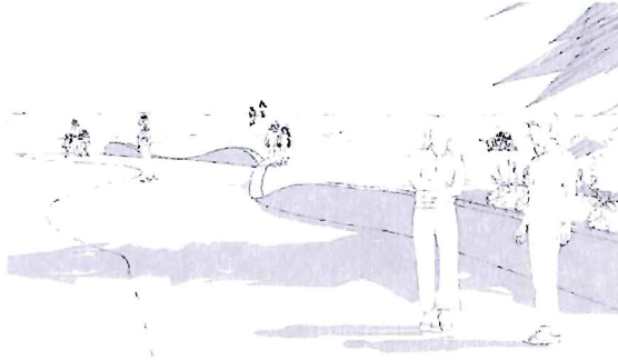
WALK IN THE PARK