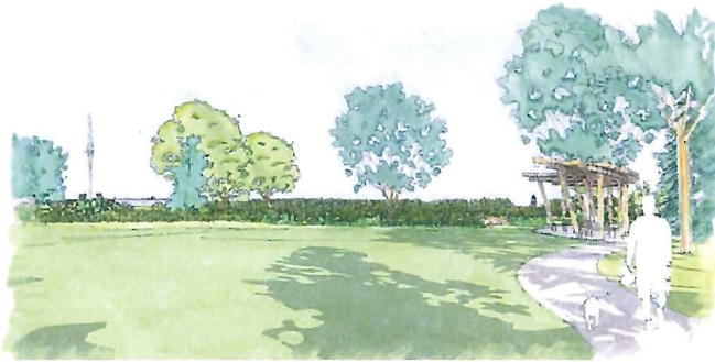
OPEN LAWN AREA LOOKING NORTH