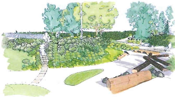
VIEW FROM ABOVE LOOKING NORTHWEST