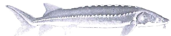
STURGEON IN THE RIVER