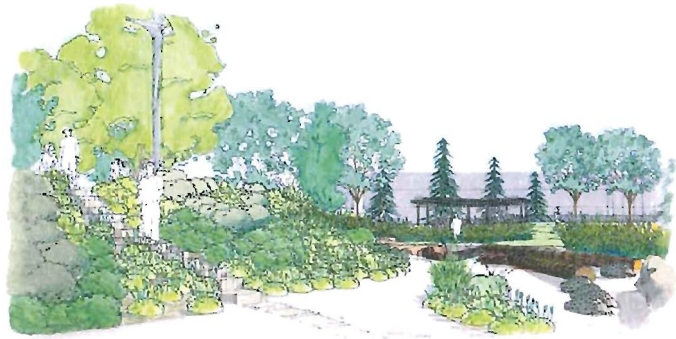
LOOKING BACK TOWARDS PICNIC SHELTER