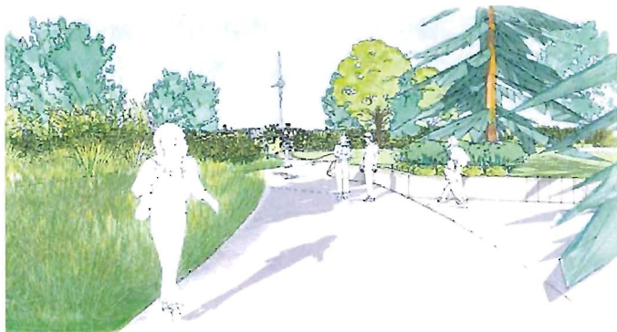
TRAIL VIEW TO THE NORTH