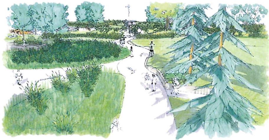
VIEW FROM ABOVE LOOKING NORTH