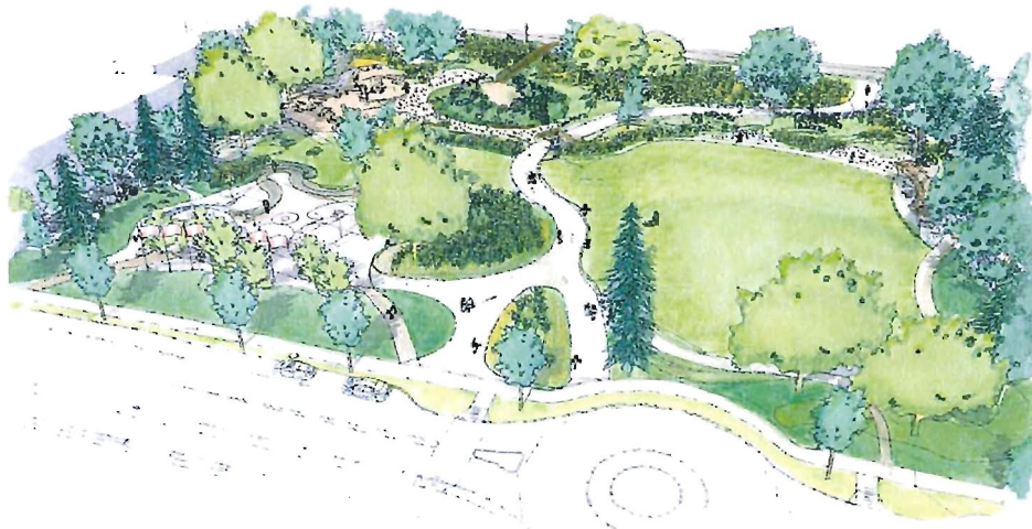
VIEW FROM ABOVE LOOKING NORTHWEST