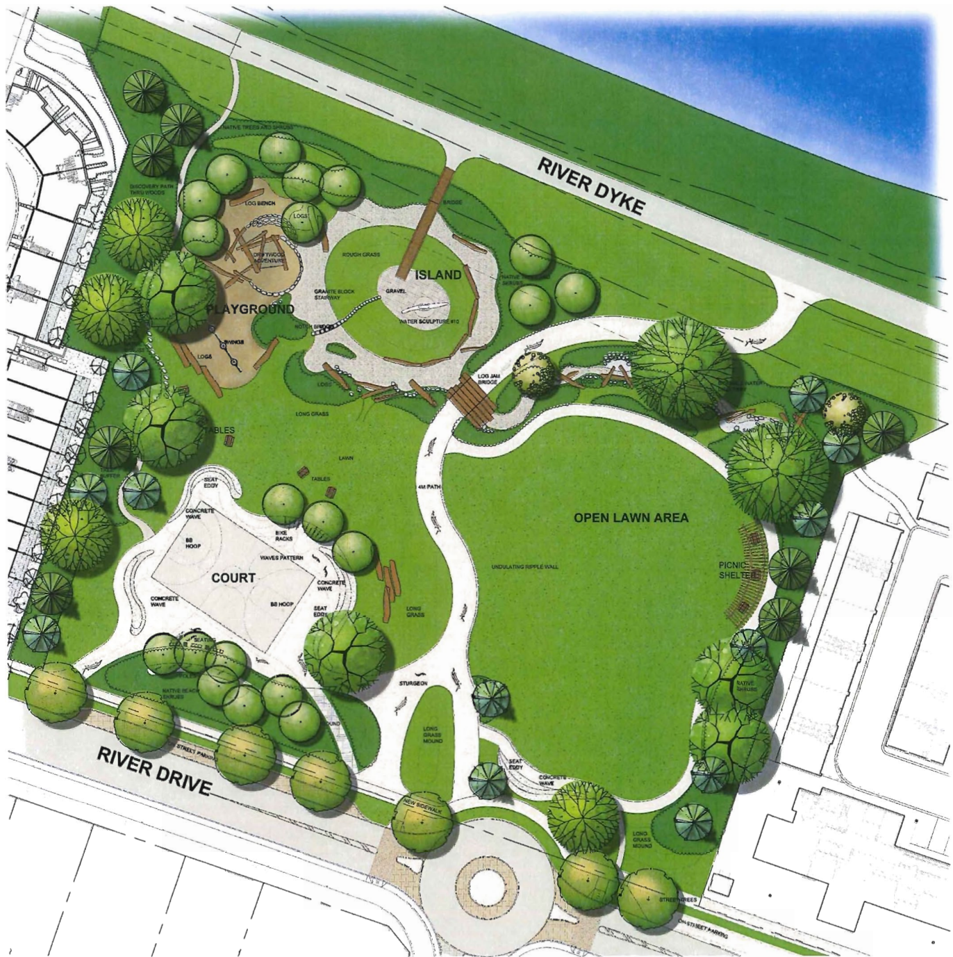
TAIT RIVERFRONT PARK