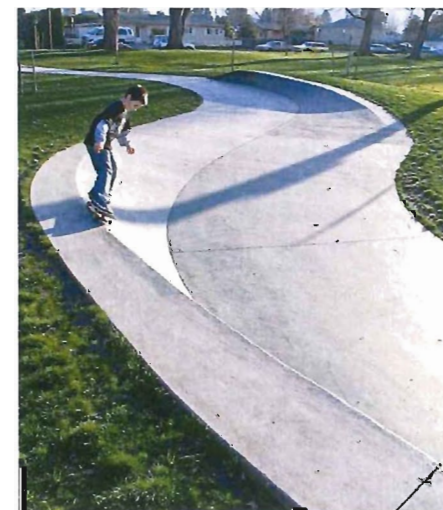
CONCRETE WAVE TO DIRECT DRAINAGE