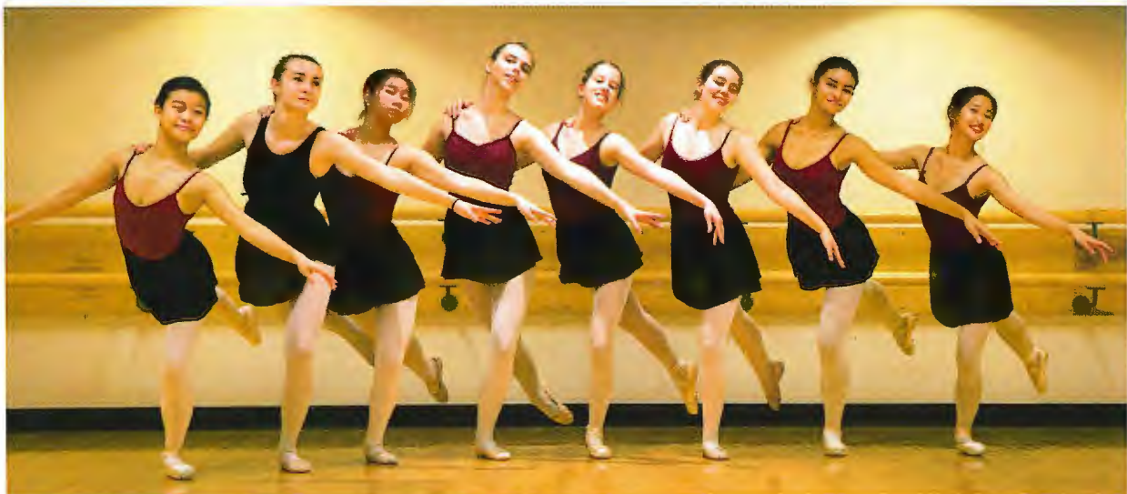
PRCS - 102

There is a need to establish and fund an Arts Subsidy Program that could provide an appropriate level of subsidy to assist customers in school-year programs such as Pre-Company and Richmond Youth Dance Company. The recommended amounts in the proposed RFSP are not high enough to prevent barriers to participation in this area. While this should be a separate fund from the RFSP, it could be jointly administered between RSFP administration staff and Richmond Arts Centre programming staff.