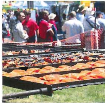
From the colourful and quirky characters at the Richmond Maritime Festival to the scrumptious, sizzling salmon barbecue at the Steveston Salmon Festival, Richmond's Days of Summer are full of treats for all senses.