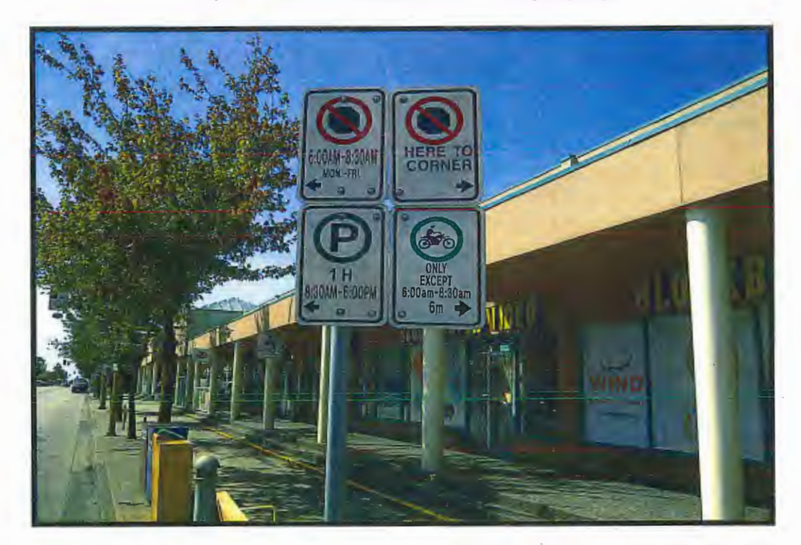
City of Burnaby: Motorcycle Parking Signage