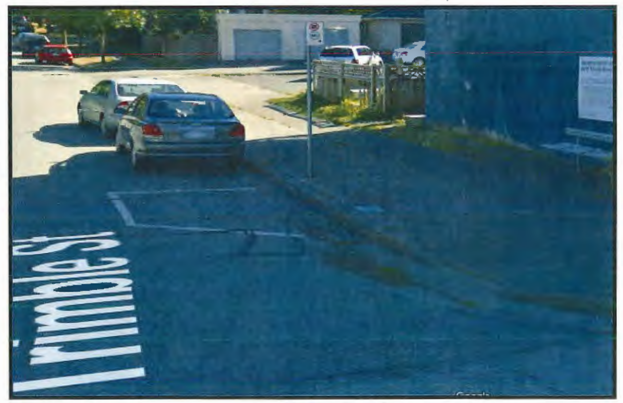
Free Parking Location