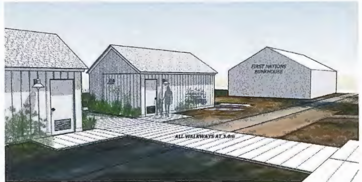
BSNHS - Public Washroom Buildings - South West Perspective