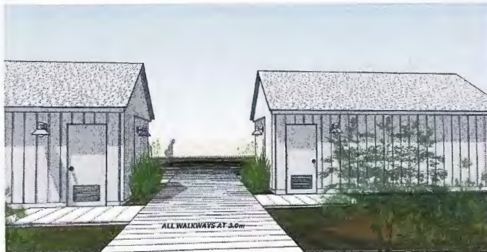
BSNHS - Public Washroom Buildings - Entering from Westwater Drive, Traveling South