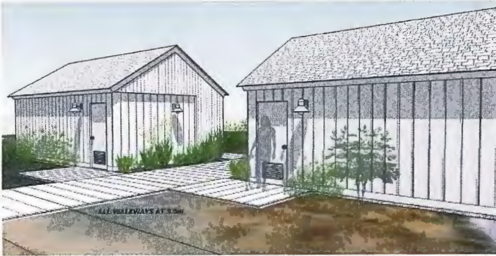
BSNHS - Public Washroom Buildings - South East Perspective