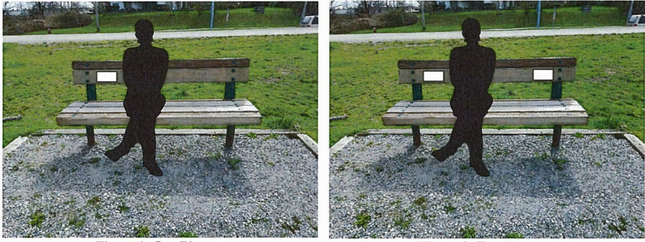
Figure 1: One Plaque