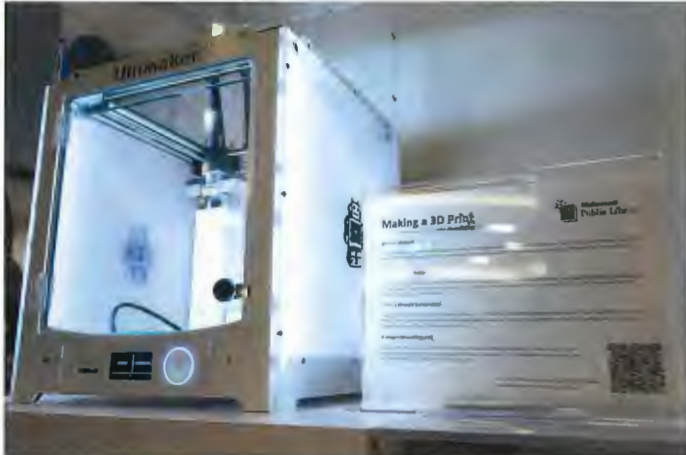
Figure 1. Brighouse Library Launchpad Flex Space & Classroom Figure 2. 3D Printers