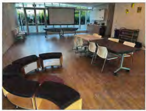
Figure 6. Seedlings Multi-Purpose Room