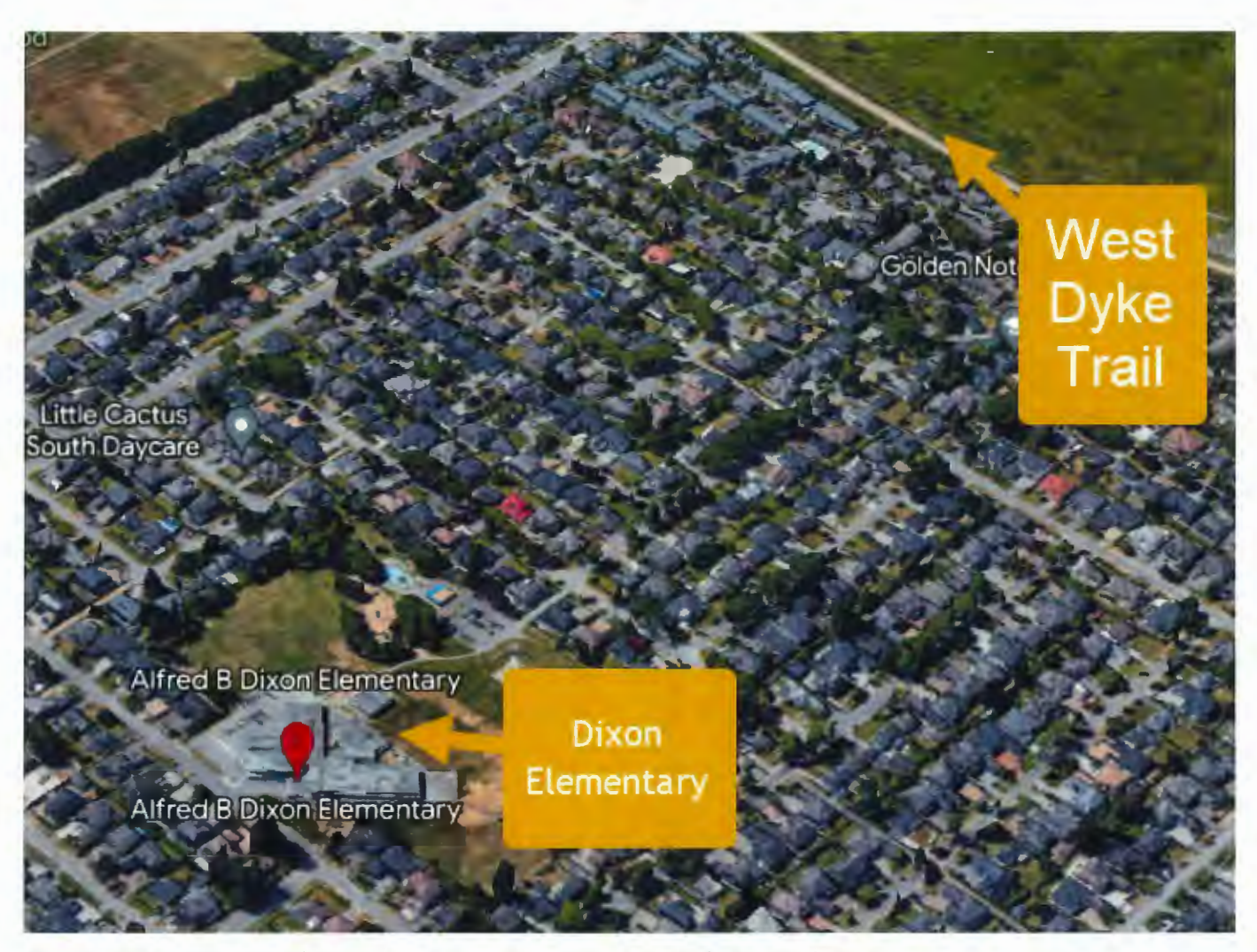
Figure 2. Aerial location map showing Dixon Elementary and proximity to the West Dyke Trail