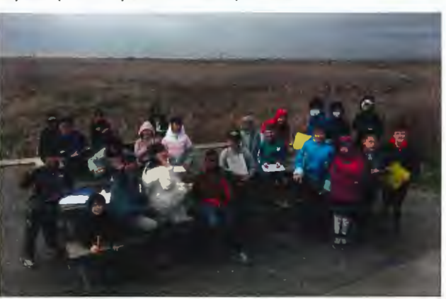
Figure 4. Off-site outdoor learning along the West Dyke Trail