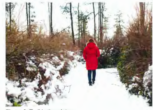
Figure 6. Trail in the winter