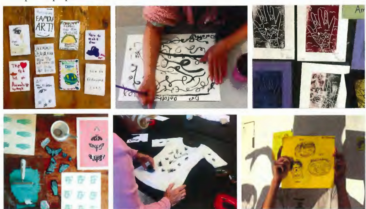
From left to right: zine-making, painting, printmaking, mixed-media printmaking, textile printmaking and drawing.