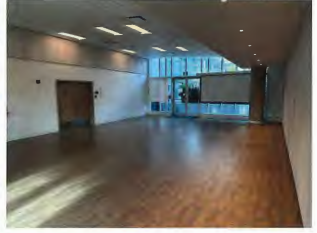
Figure 4. Seedlings Multi-Purpose Room