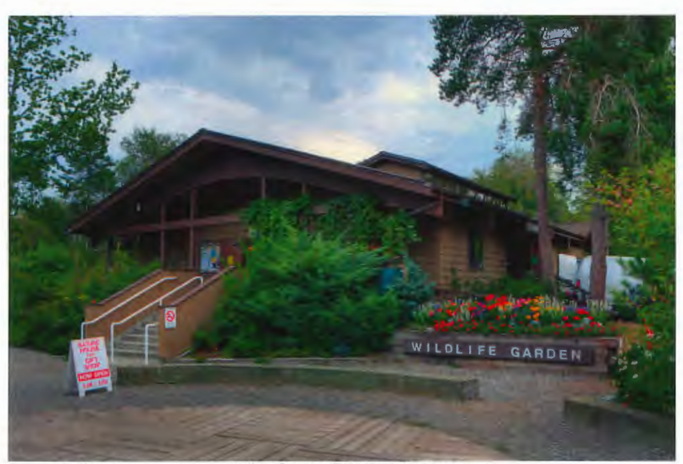
Figure 1. Nature House Interpretative Centre, Richmond Nature Park.