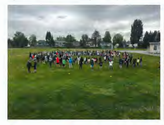
Figure 3. Dixon Elementary open green field