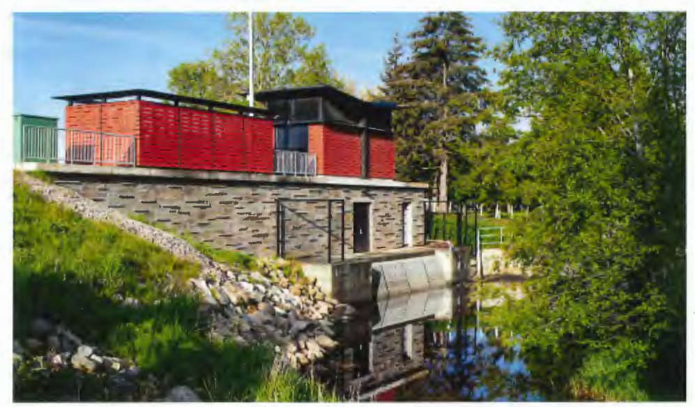
Figure 1. Horseshoe Slough Pump Station, City of Richmond