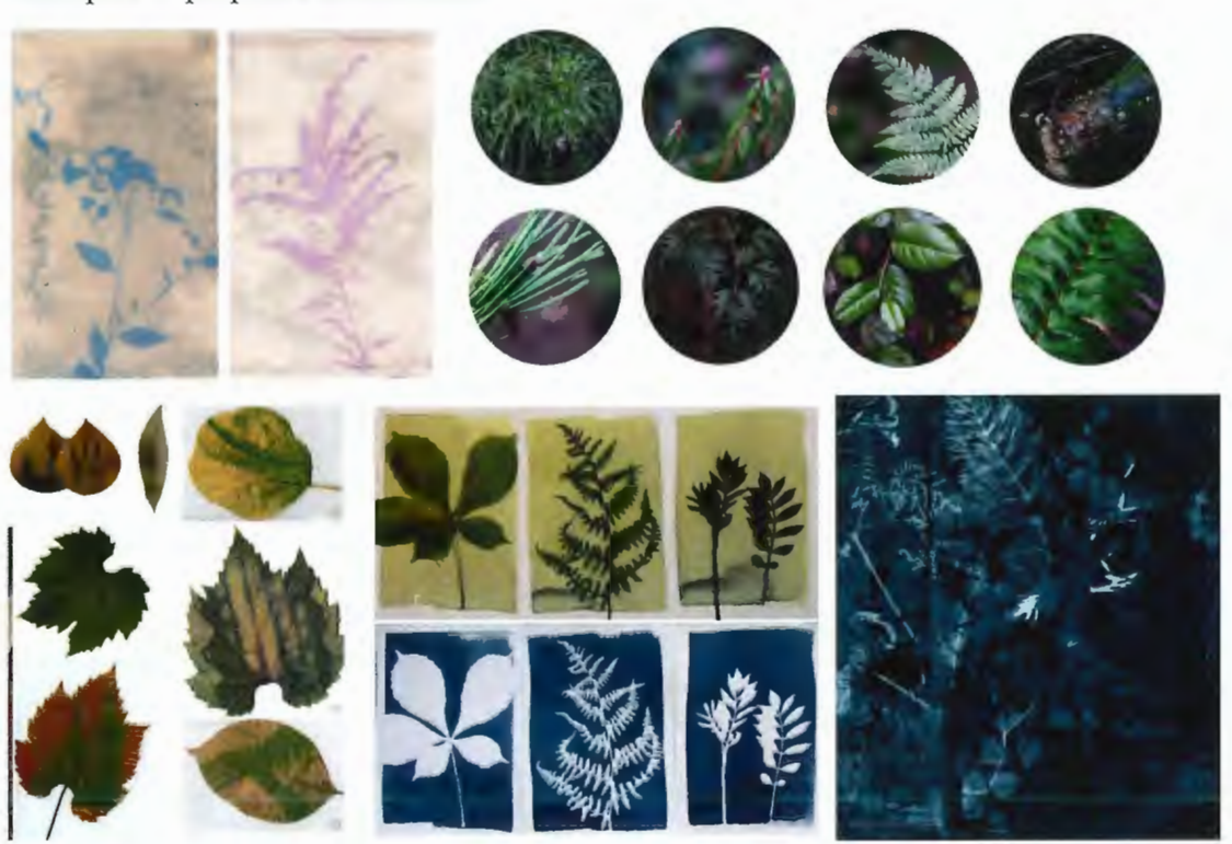
From left to right: anthotype printmaking, photography using creative aperture control, chlorophyll leaf prints, cyanotype printmaking and digital collage.