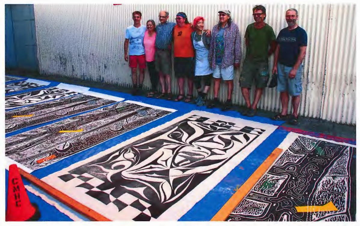
Big Print Project (Steamroller print project) 2014 Printing inks on hemp cloth and Stonehenge paper each (of 11 prints) Size: 4 ft. X 8 ft.