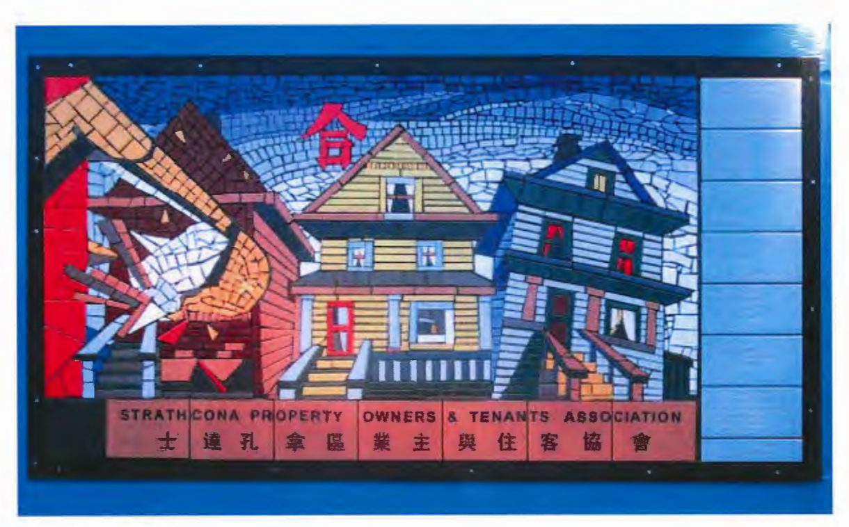
SPOTA mosaic 2014 Cut mosaic tile and sandblasted tile. Size: 3 ft. X 6 ft.