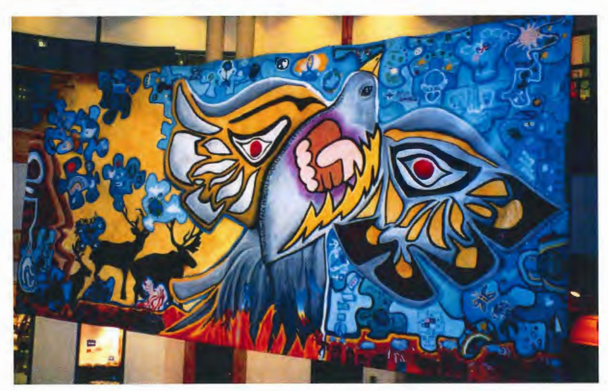
Kids Guernica, International Children's Peace Mural, 1997 Richmond Art Gallery Acrylic on canvas Size: 12 ft. X 25 ft.