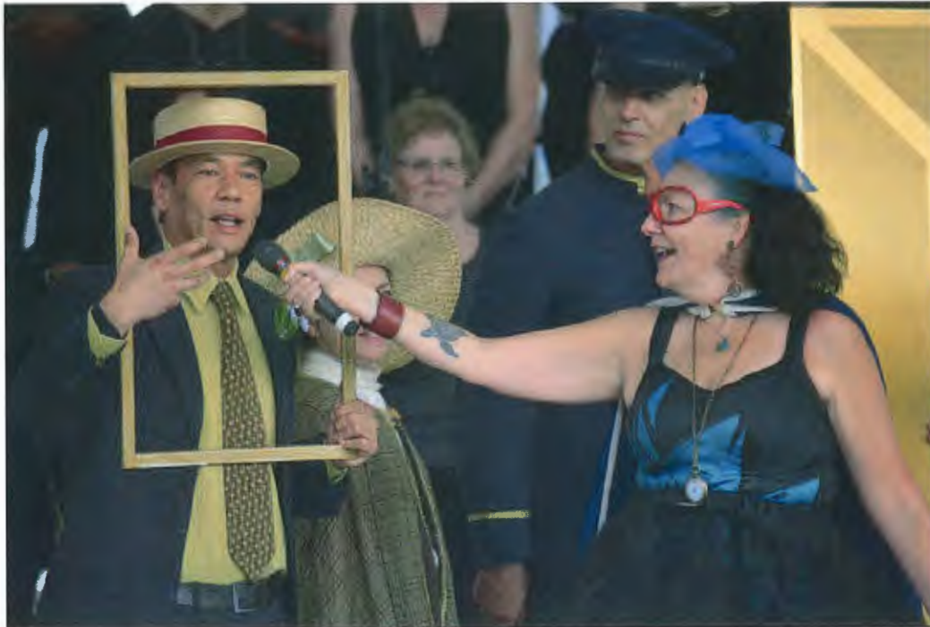
Figure 1. Artists Rendering Tales Collective Inc, Coquitlam's Historical Characters, 2016, Coquitlam, Theatre