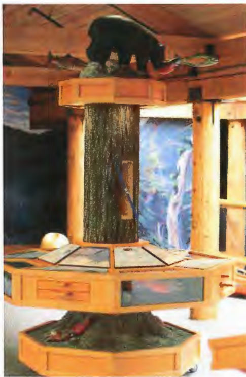
Figure 3 and 4 – Bear sculpture, Waterton Lakes and Salmon Grows in Trees Exhibit, Kwisitis Centre, Pacific Rim National Park Reserve, Uclulet, B.C.