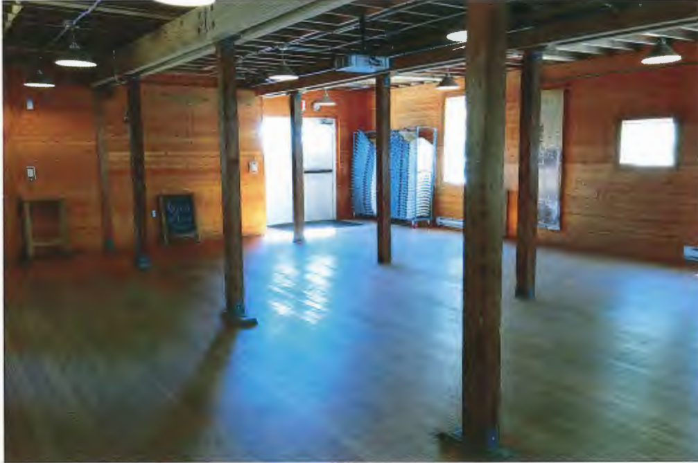
Britannia Shipyards National Historic Site