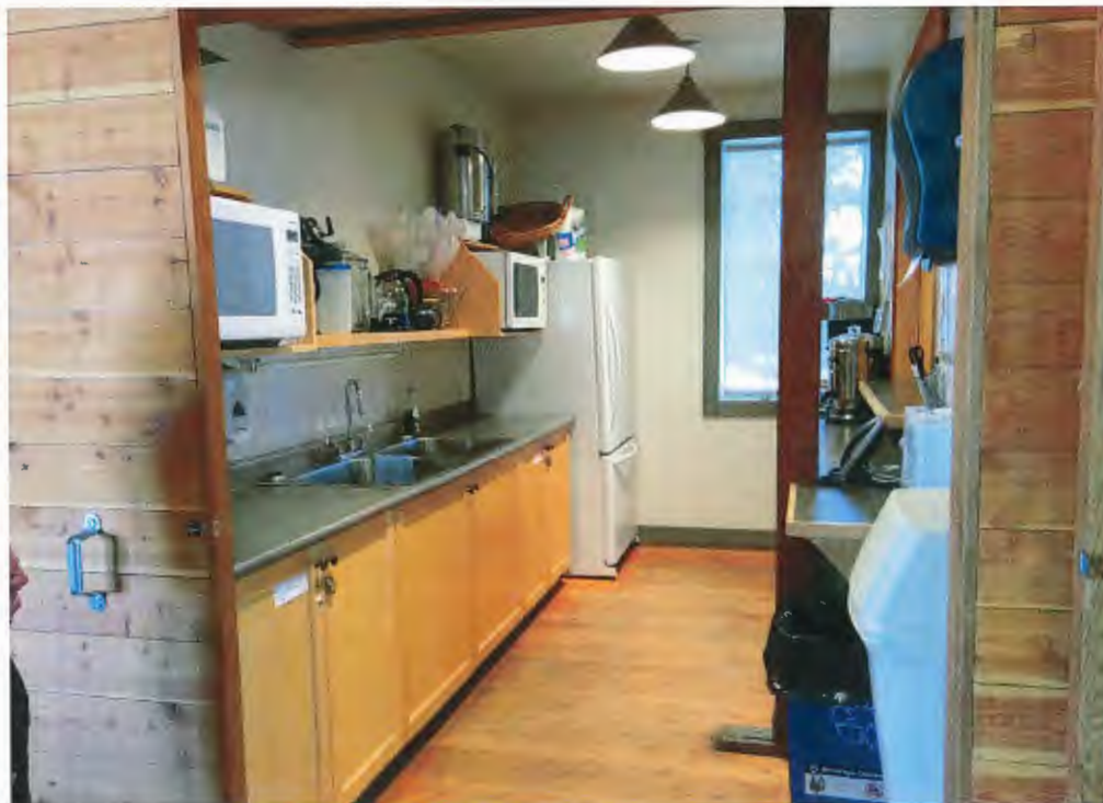
Figure 4. Chinese Bunkhouse kitchen facilities.