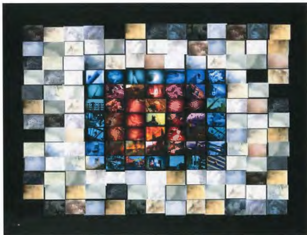
Figure 2. Faith Moosang, down.town. , 2015, Large-scale Photographic Mural, Vancouver, BC.