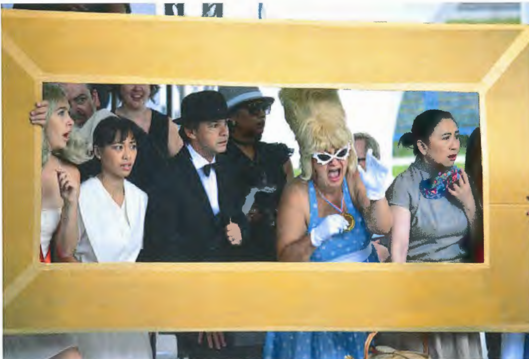
Figure 2. Artists Rendering Tales Collective Inc., Coquitlam's Historical Characters, 2016, Coquitlam; Theatre