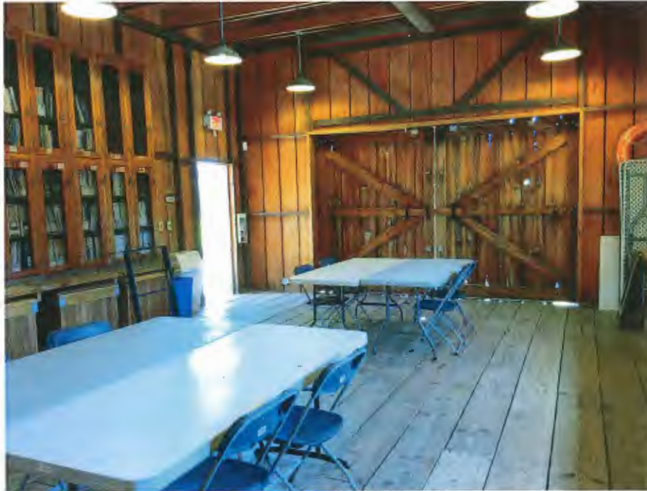
Figure 5. Murakami Boatworks program space with double doors facing the boardwalk