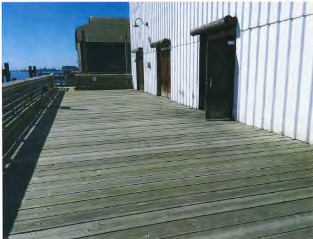
Figure 8. Seine Net Loft outdoor deck area with water views

Britannia Shipyards National Historic Site