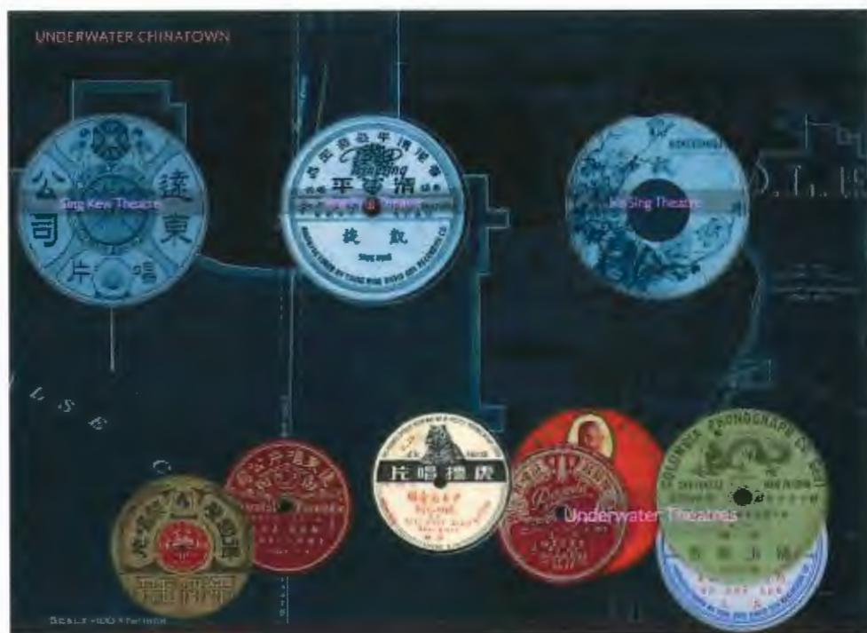
Figure 1. Faith Moosang and Deanne Achong, Underwater Chinatown , 2016, https://underwaterchinatown.com , Interactive Website, Cinevolution Media Society