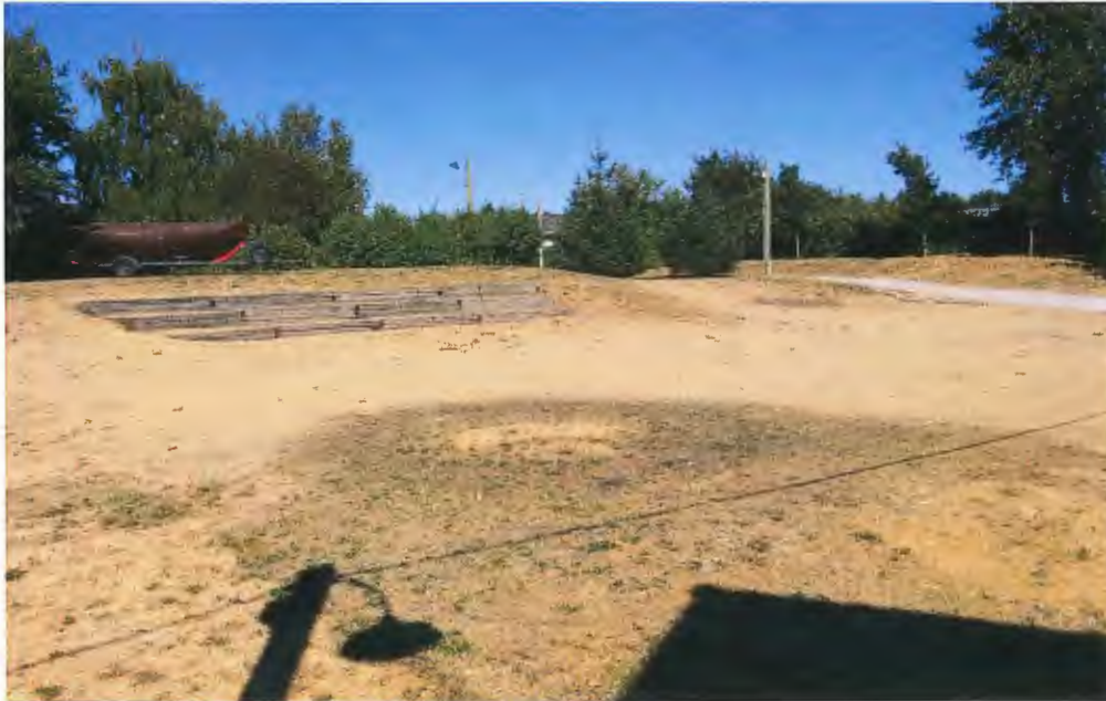
Figure 7. Outdoor theatre and performance area with stepped seating