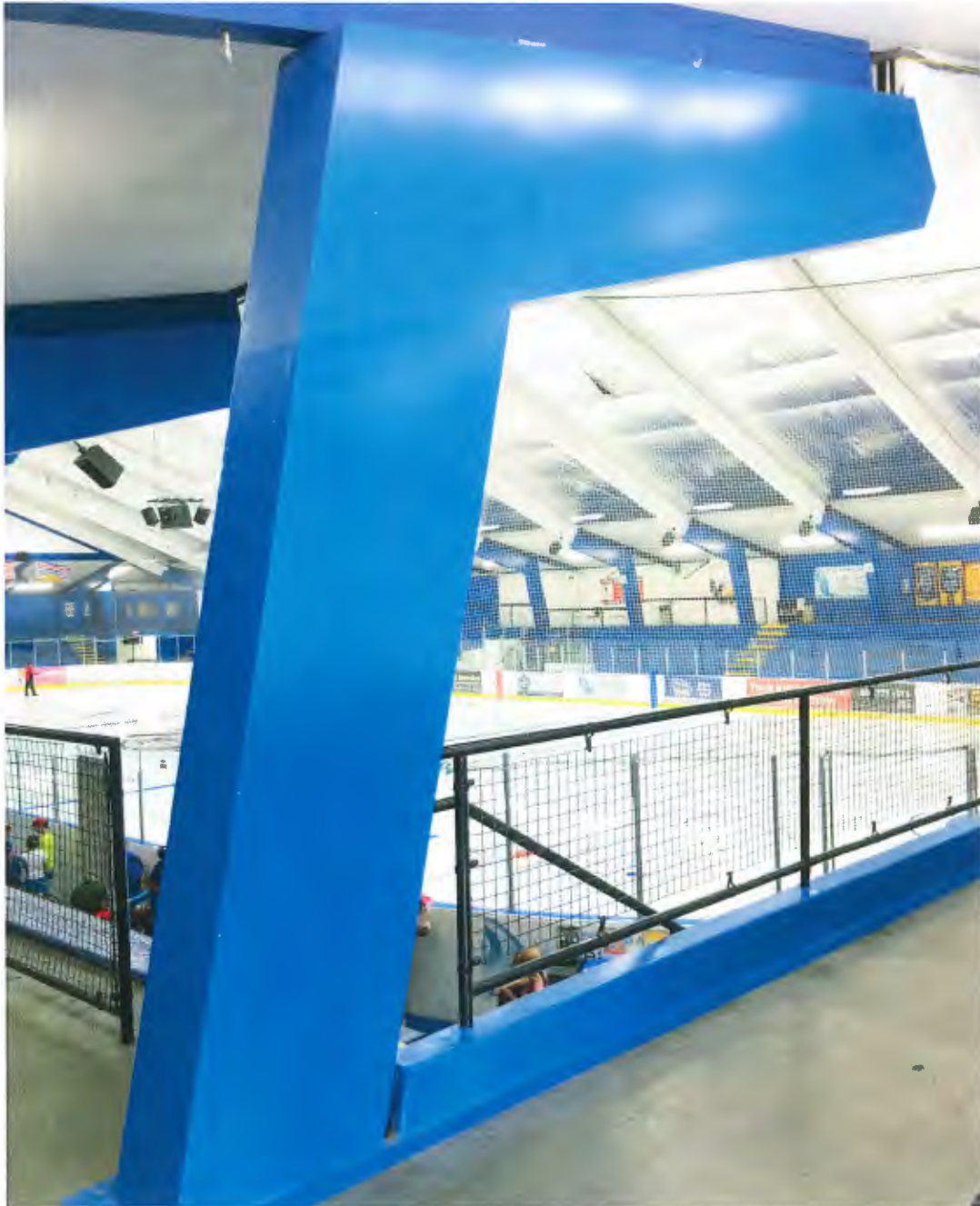
Figure 2. Example of concrete pillar in Minoru Arena. A total of 29 pillars.