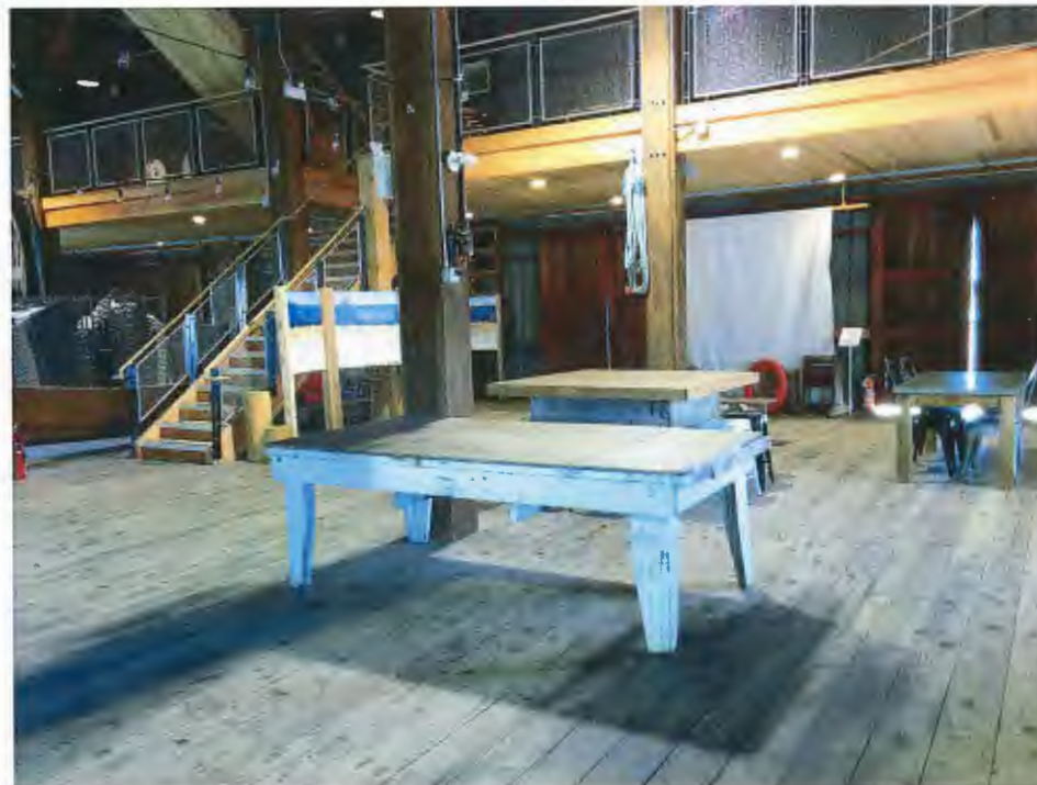
Figure 6. Seine Net Loft program space for educational outreach

Britannia Shipyards National Historic Site