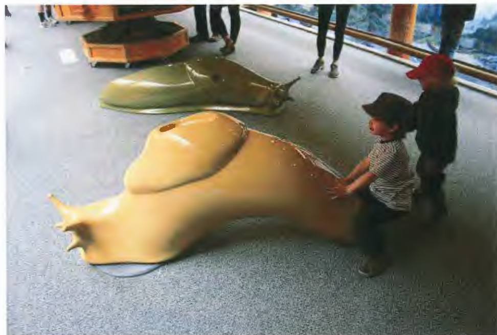
Figure 5 - Giant fiberglass slug play structures Kwisitis Centre, Pacific Rim National Park Reserve, Uclulet, B.C.