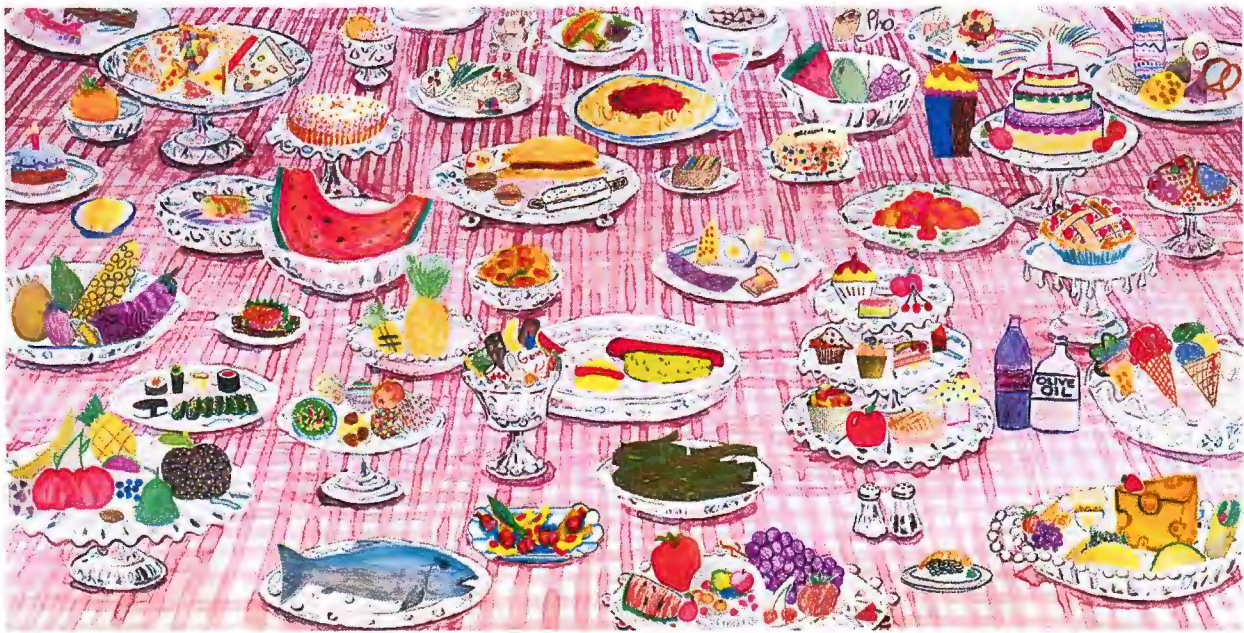
The International Picnic community collaborative mural