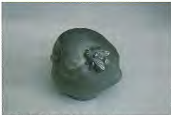
Sculpted apple and fly by the artist