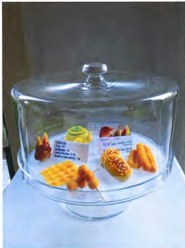
The Sculpted Feast