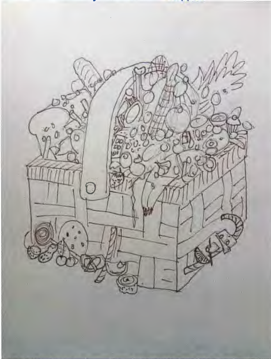
Artist sketch of the artwork, in the form of a life-sized picnic basket (approx. 19" x 14" x 7") that is overflowing with 50 to 100 life-sized sculptures of small food items such as sushi, dim sum, blueberries and cranberries.