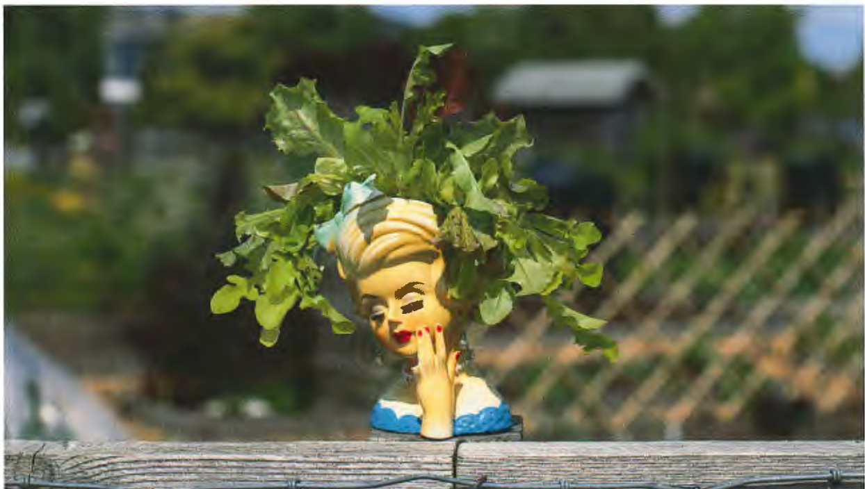
Richmond Urban Food Garden Project