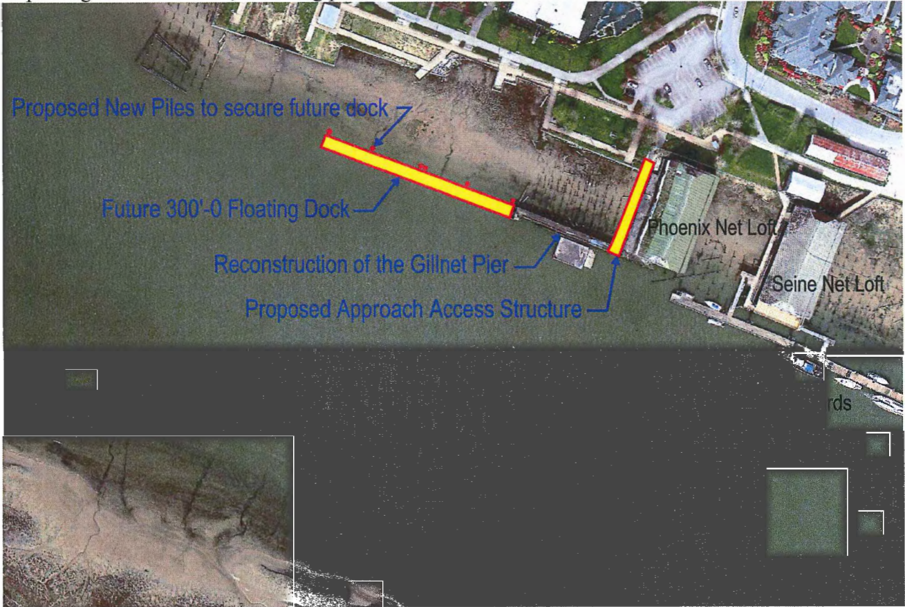
2016 Aerial Photo