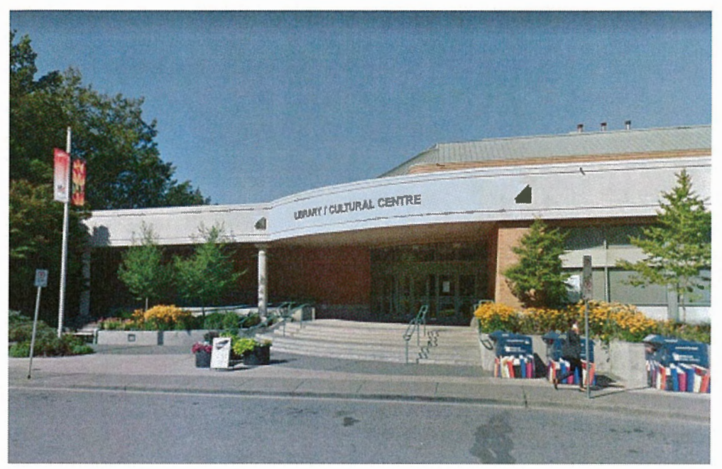
Figure 1. Richmond Cultural Centre, 7700 Minoru Gate.