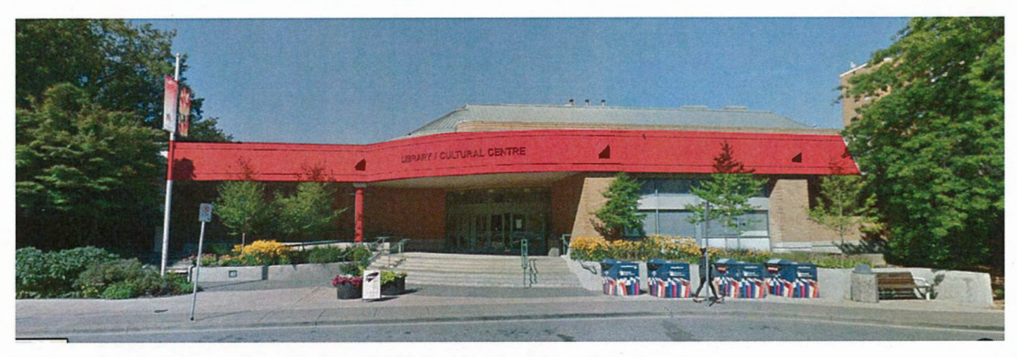
Figure 1 – Exterior fascia banding and columns, highlighted in red at Minoru Gate entrance.