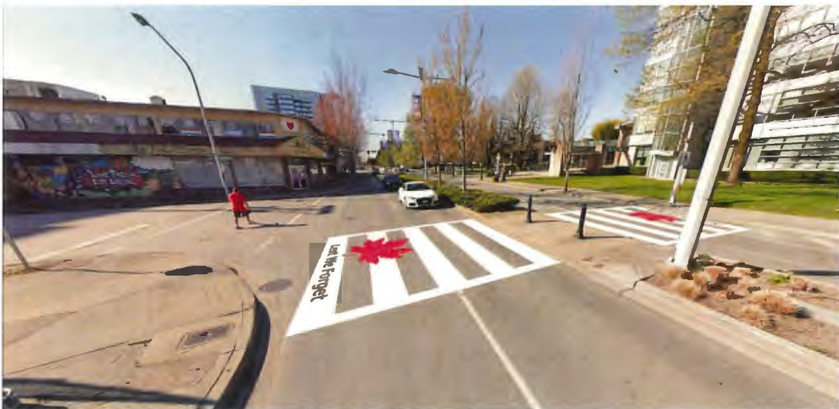
Figure 2: Conceptual Rendering of Recommended Design

Although various designs were developed and discussed with stakeholders, as the maple leaf is the Legion's recommended design, staff recommend it be used for the commemorative crosswalk at No. 3 Road and Anderson Road (Figure 2).