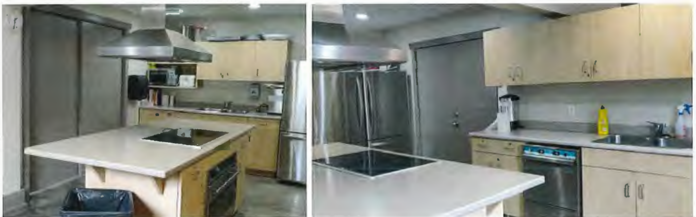
Figure 4. Terra Nova Barn kitchen facility