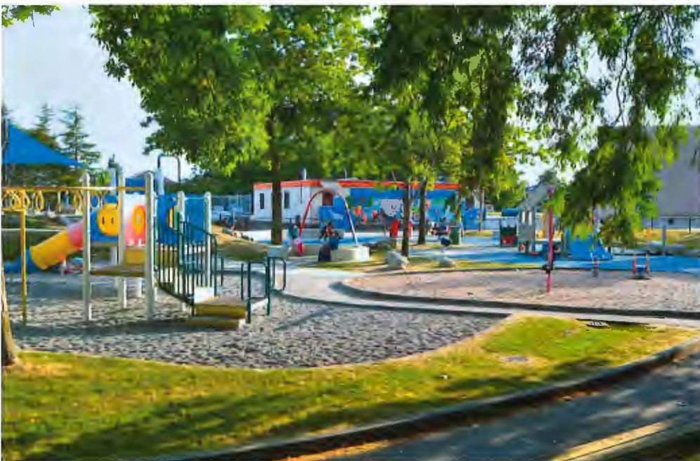
Figure 4. West Richmond Community Centre children's playground.