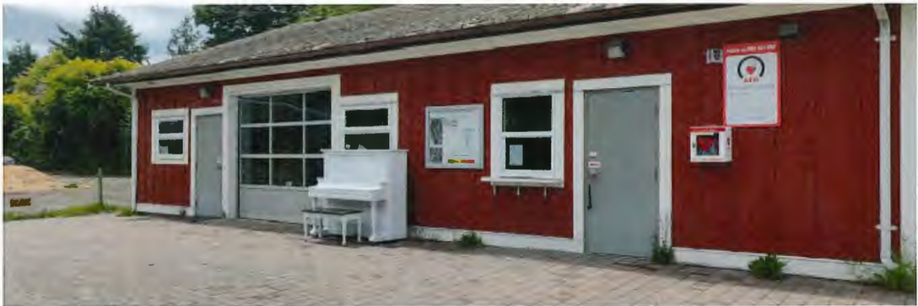
Figure 3. Terra Nova Barn doors provide access to adjacent courtyard