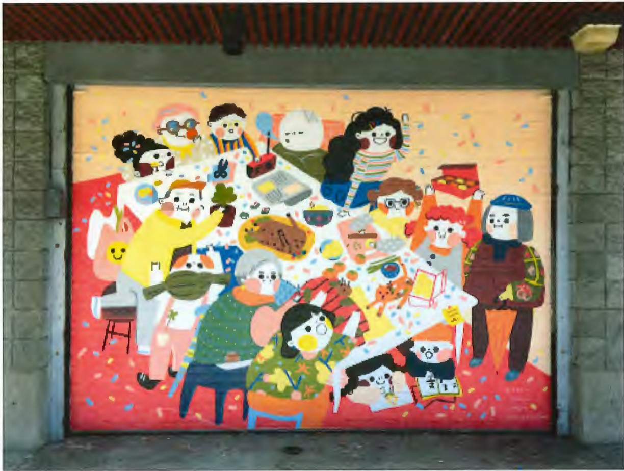
Dawn Lo, Gathering , Chinese Cultural Center Commissioned by the City of Vancouver, 2019