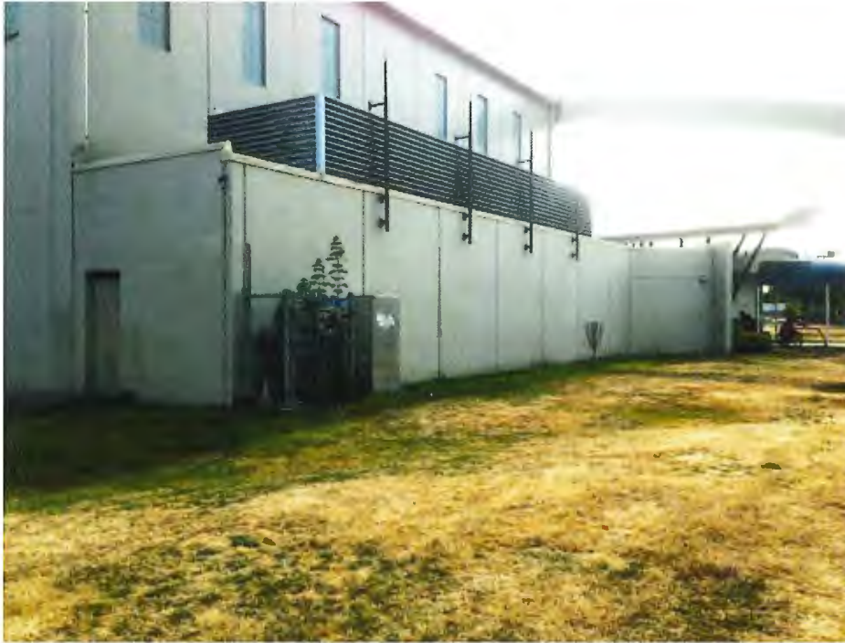
Figure 1. Thompson Community Centre mural location on north façade.