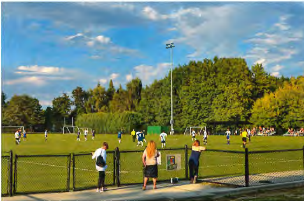
Figure 2. West Richmond Community Centre sports field.

*Applicants are kindly asked to reserve this date in their calendar.