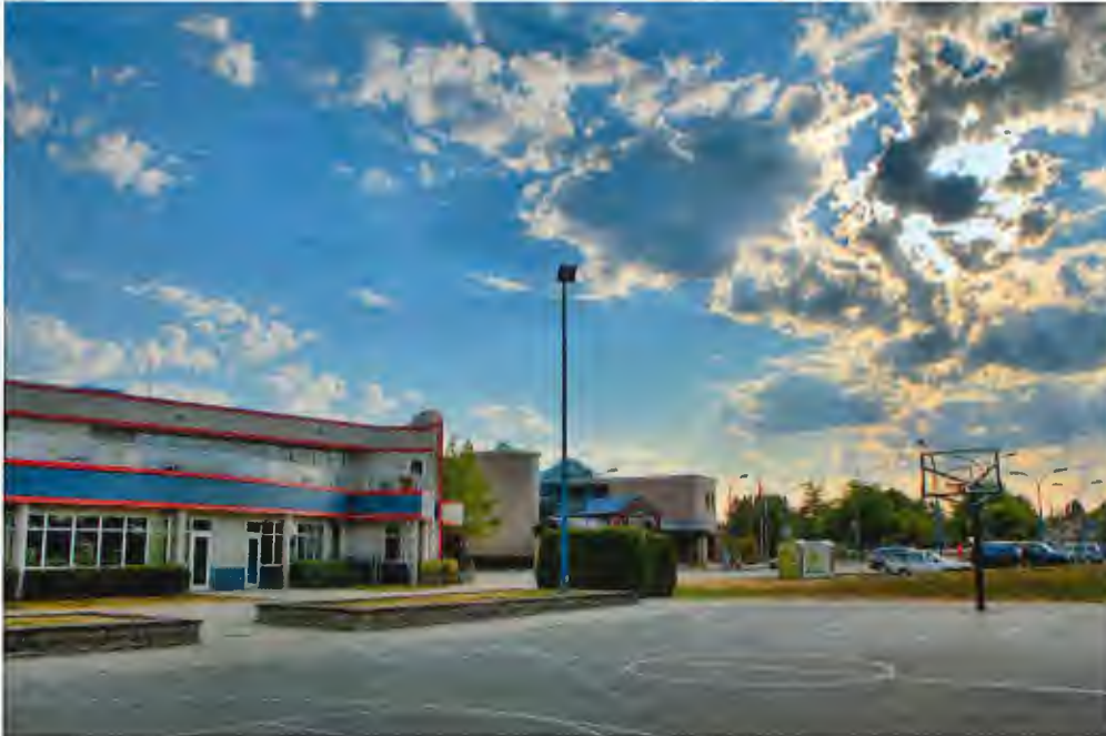
Figure 3. West Richmond Community Centre basketball court.