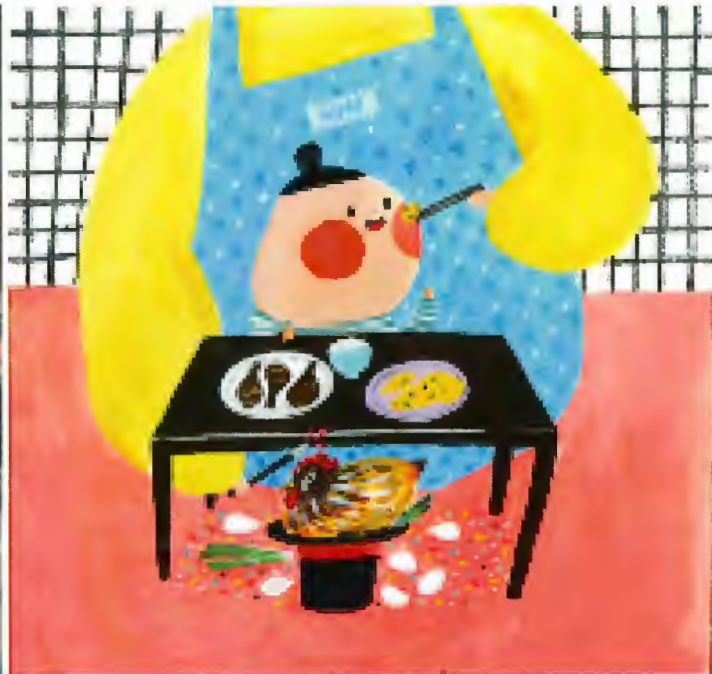
Dawn Lo, Where do you think food comes from? No.3 Road Art Columns Exhibition 9, Commissioned by the City of Richmond, 2015.