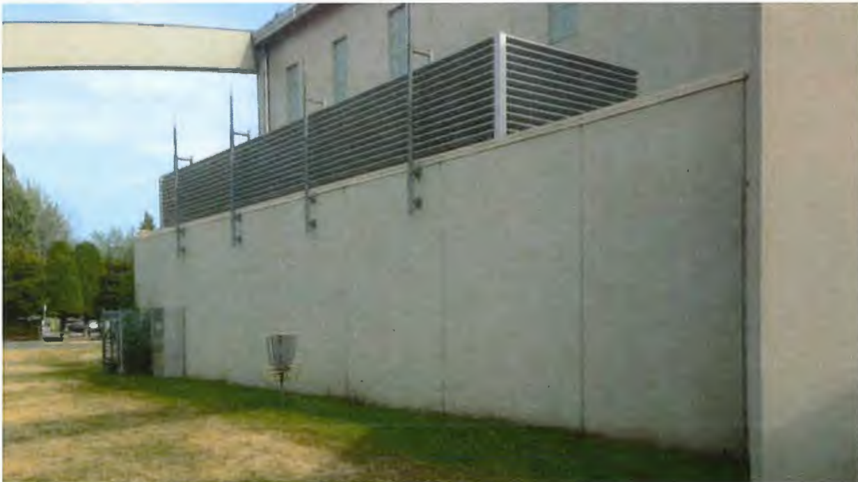
Figure 2. Proposed wall location for mural. Dimension of wall, approximately 14 ft. x 100 ft.

*Applicants applying for this opportunity are kindly asked to reserve this date.