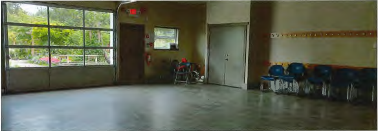
Figure 2. Terra Nova Barn multi-purpose space