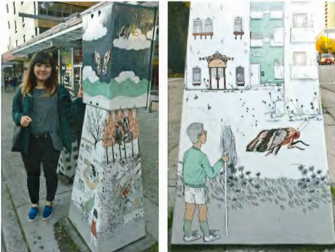
April dela Noche Milne, Night Life , Robson and Cardero, Commissioned by the City of Vancouver, 2017