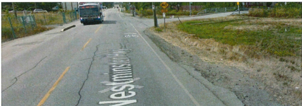
Westminster Hwy at Fraserside Gate: looking westbound