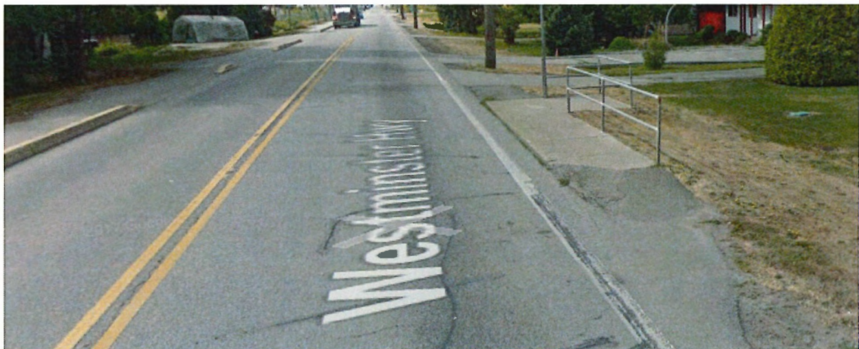
Westminster Hwy at Westbound Bus Stop at Willett Ave