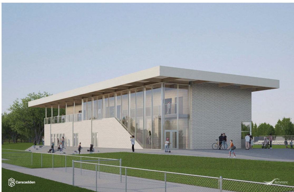
View of front entrance looking southwest