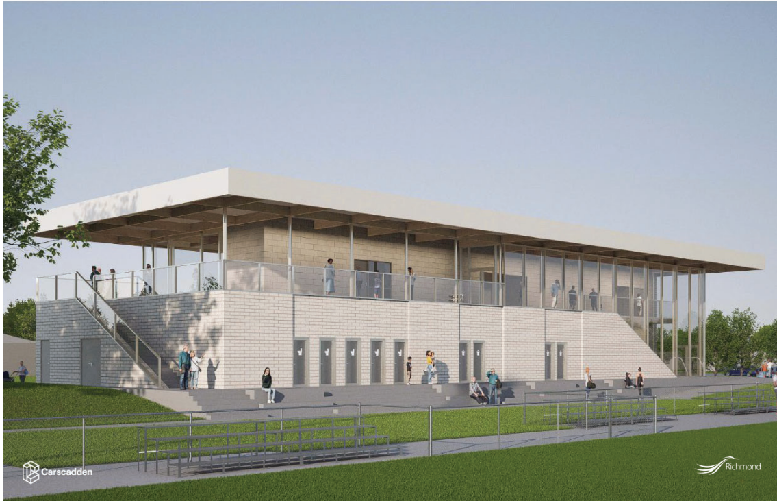
View from Hugh Boyd turf field looking northwest