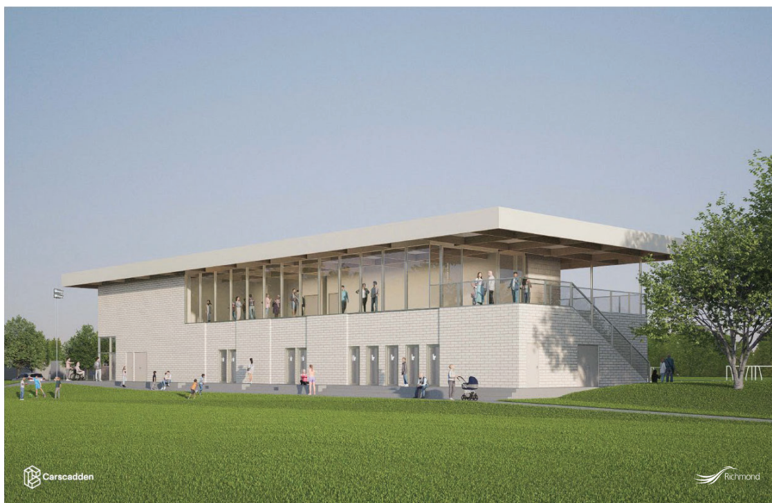
View from Hugh Boyd Oval field looking northeast