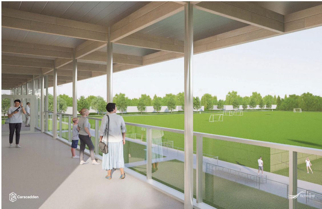
View from covered deck looking northeast towards turf fields