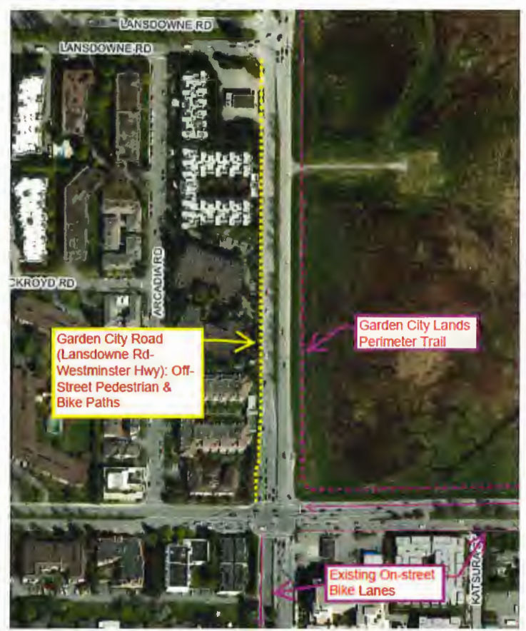
Garden City Road (Lansdowne Road-Westminster Hwy): Separate Off-Street Pedestrian & Bike Paths