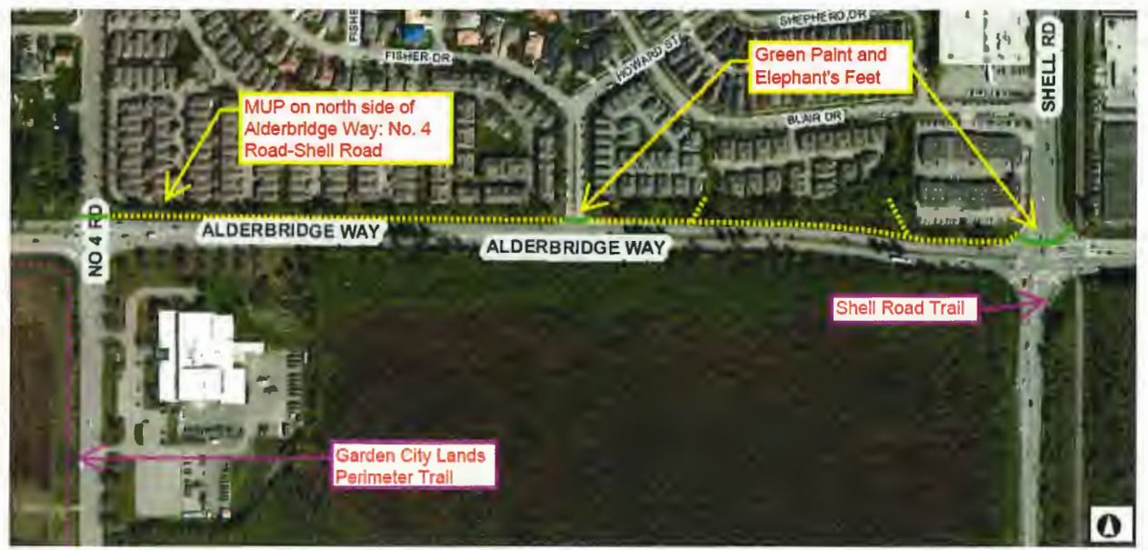
Alderbridge Way (No. 4 Road-Shell Road): Multi-Use Pathway