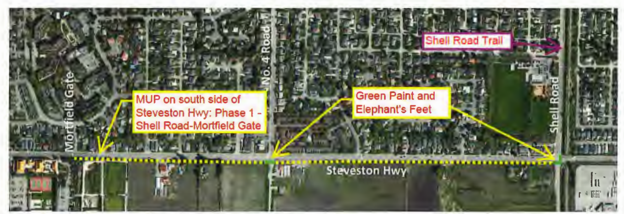
Steveston Highway (Mortfield Gate-Shell Road): Phase 1 - Multi-Use Pathway