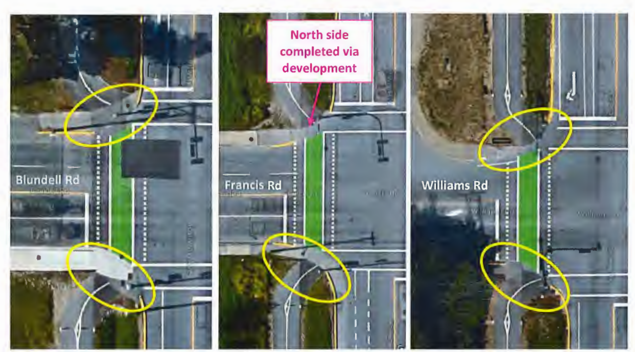
Blundell Road-Railway Ave Francis Road-Railway Ave Williams Road-Railway Ave Upgrade of Railway Greenway Intersections: Curb, Gutter, Sidewalk, Relocate Signal Pole, Signage, and Pavement Markings