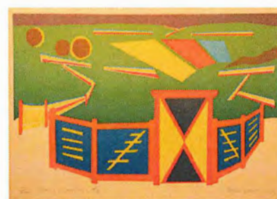
Alan Wood, Ranch Series One #3