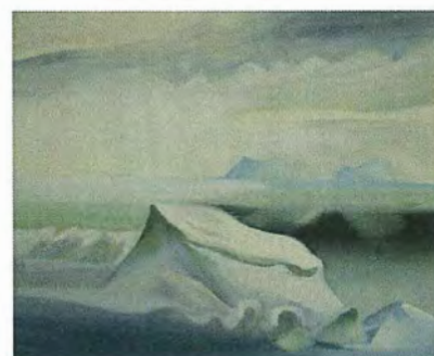
Toni Onley, The Farm