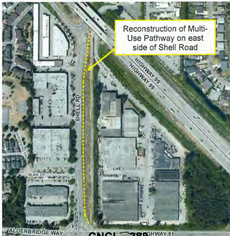
Shell Road Multi-Use Pathway: Alderbridge Way-Highway 99 Overpass CNCL - 388