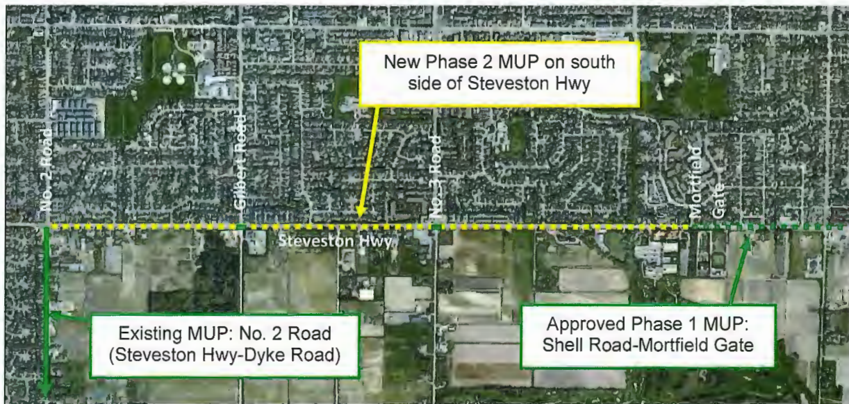
Steveston Highway (No. 2 Road-Mortfield Gate): Phase 2 - Multi-Use Pathway (MUP)