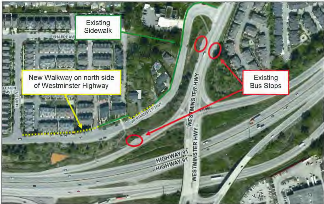
Westminster Highway (Muir Drive-90 m east): Walkway