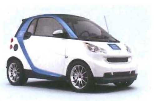
Figure 1: A Sample Car2Go Vehicle