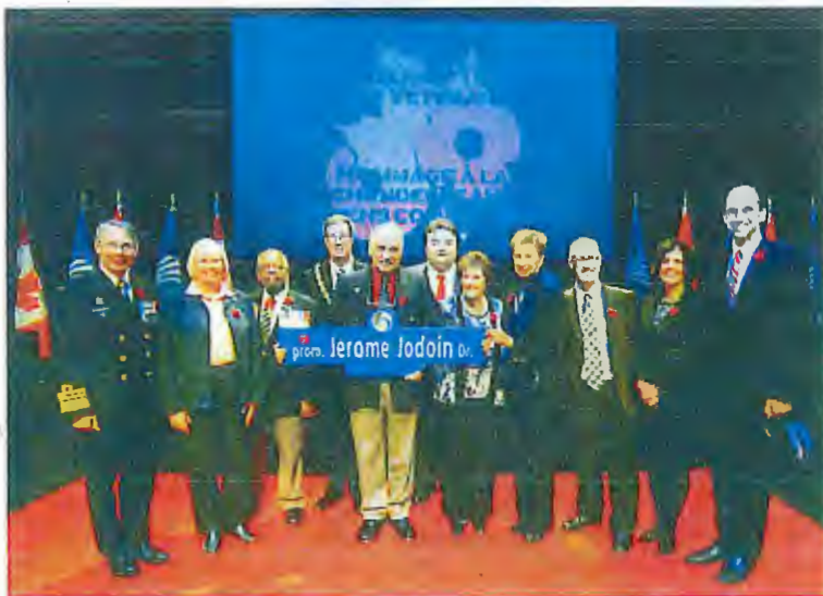
(City of Ottawa; source: http://ow.ly/VLVbB )