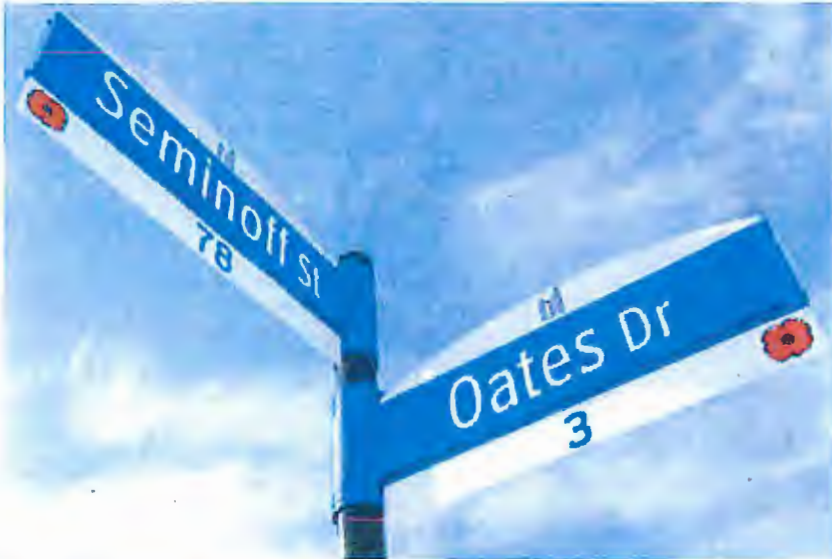
(City of Toronto; source: http://ow.ly/VLVmG )

c/o City of Richmond Archives, 7700 Minoru Gate, Richmond BC V6Y 1R9