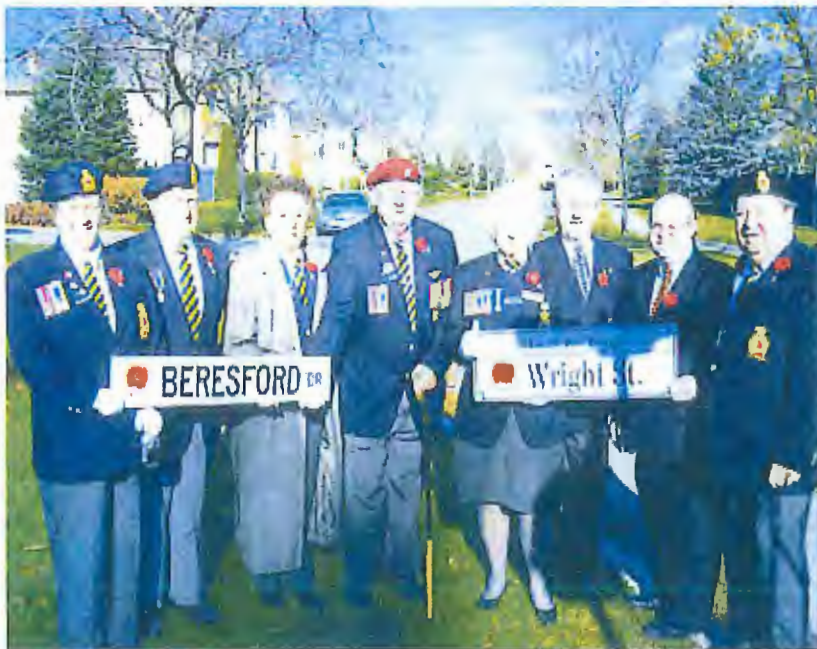
(Town of Richmond Hill; source: http://ow.ly/VLVYW )