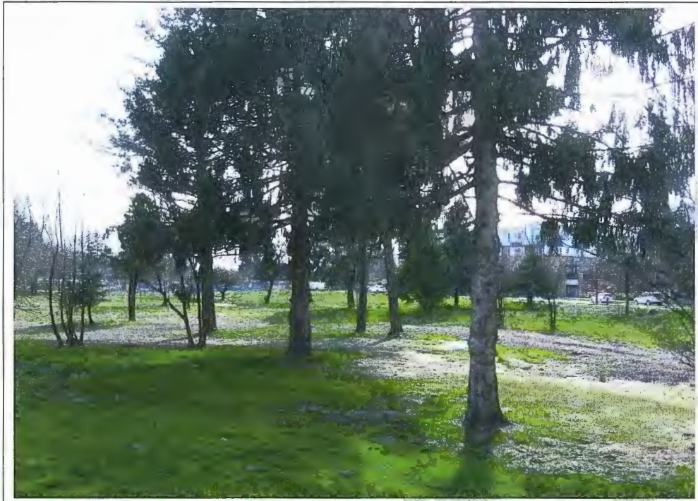
Figure 1 – West Cambie Neighbourhood Park in the Alexandra Neighbourhood