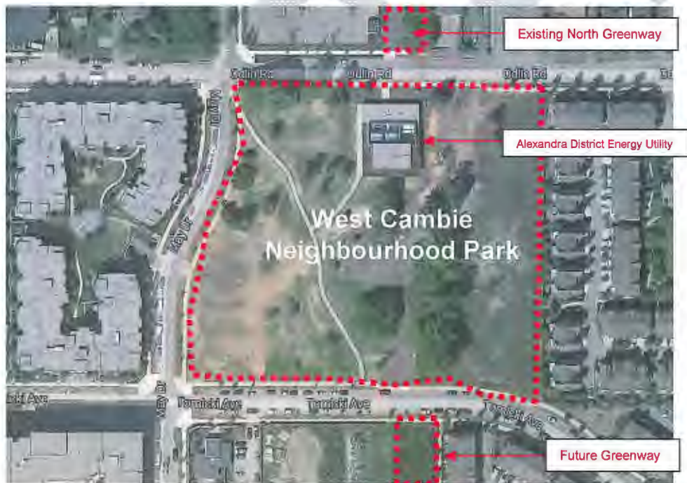
Figure 3 – West Cambie Neighbourhood Park