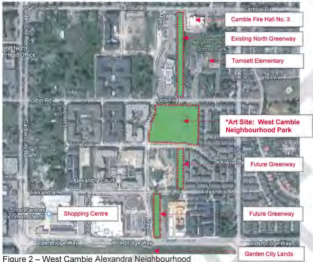
Figure 2 – West Cambie Alexandra Neighbourhood