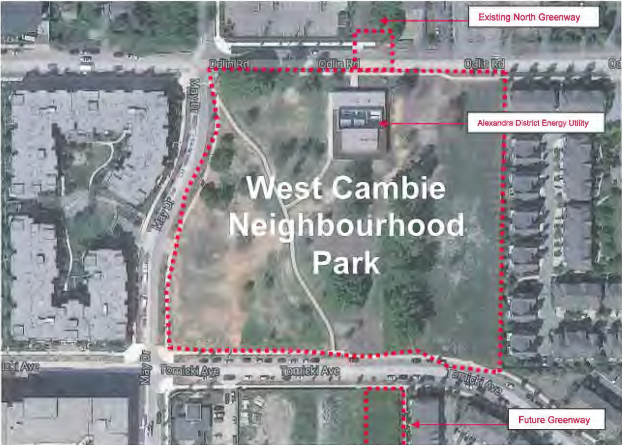
West Cambie Neighbourhood Park, 9540 to 9700 Odlin Road