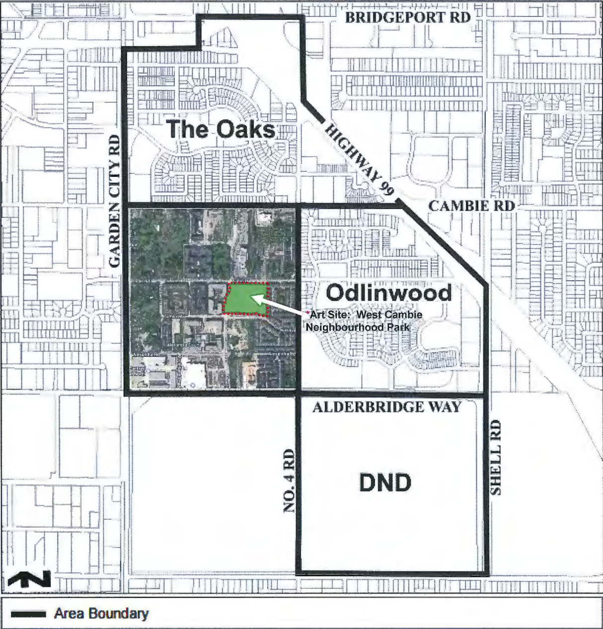
Excerpted from the West Cambie Area Plan, Adopted by Council July 24, 200