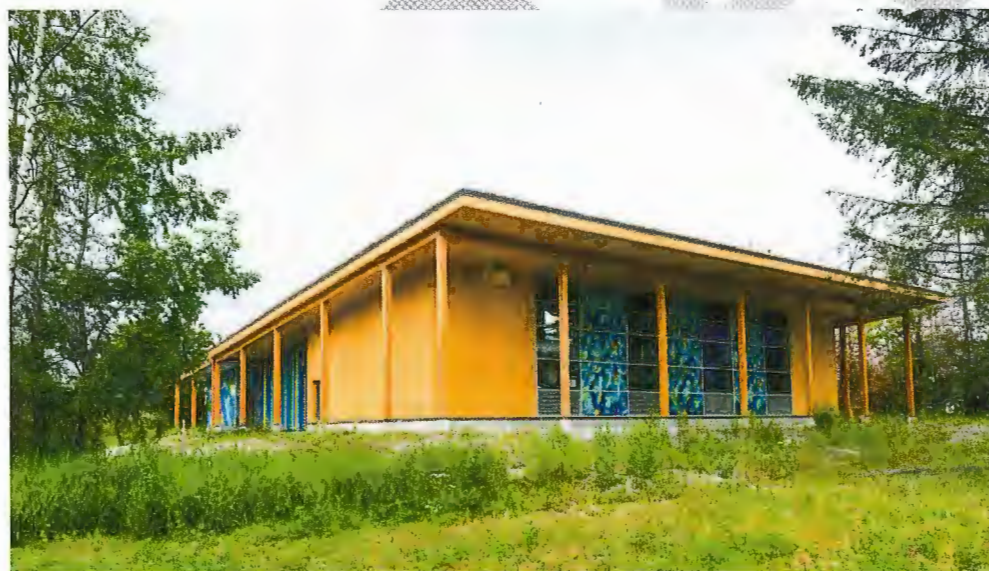
Figure 5 – Alexandra District Energy Utility Building in the north portion of the West Cambie Neighbourhood Park