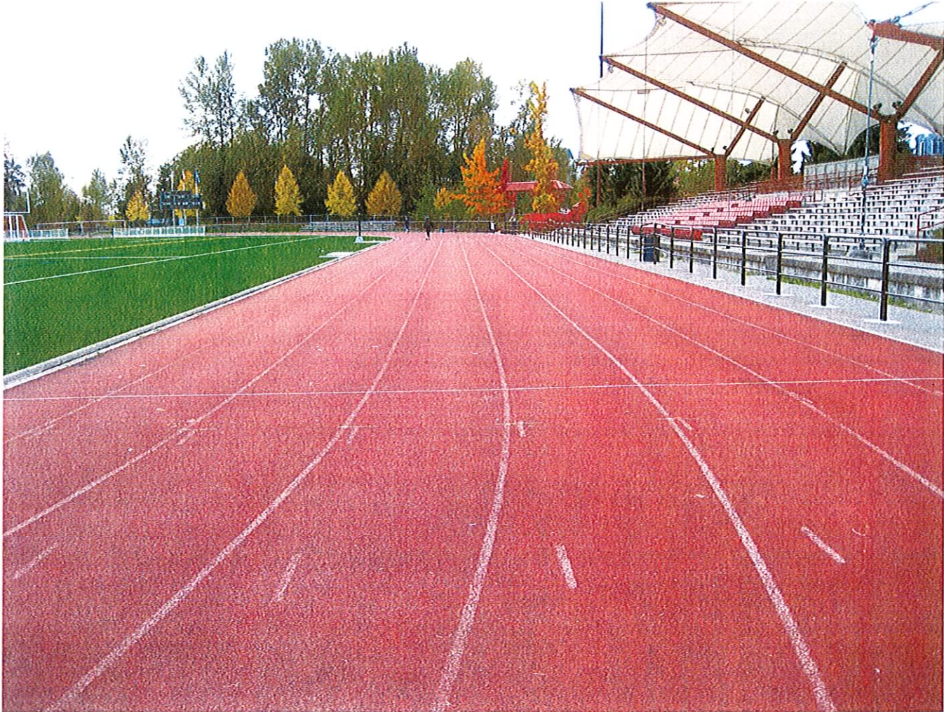
Coquitlam Artificial Turf Field & Running Track (example shown with perimeter removable fence panels)