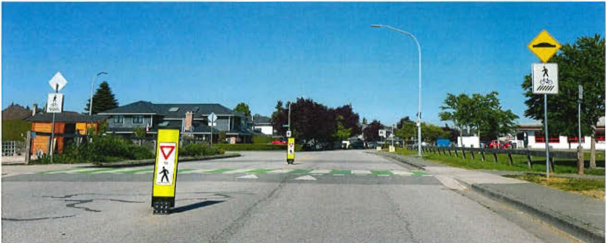
Figure 1: In-Street Pedestrian Zone Markers on Railway Avenue