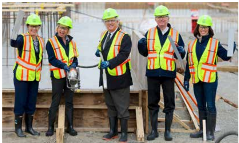
Concrete pour for Minoru Centre for Active Living

The Public Wi-Fi project implemented free Wi-Fi at City facilities, providing fast and stable wireless network connections for staff and the public at City Hall, firehalls, community centres, select heritage sites and a number of parks.