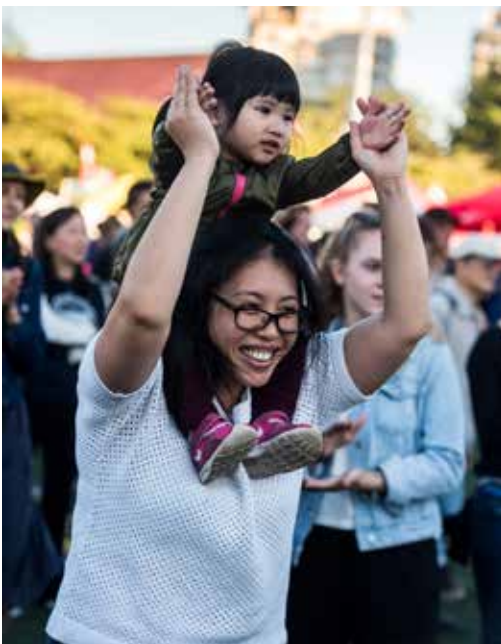
Richmond World Festival