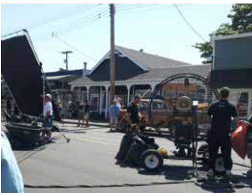
Another record breaking year for filming in Richmond