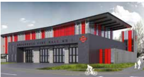
Fire Hall No. 1 rendering