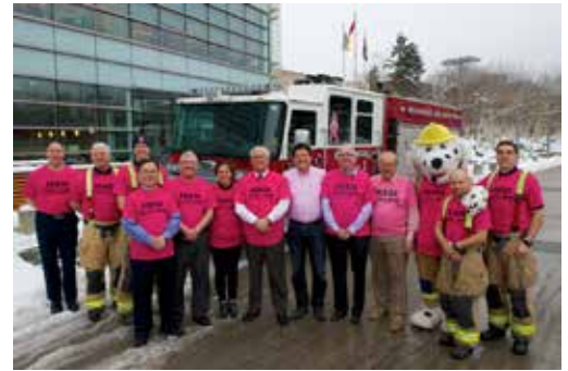
Erase Bullying Day

The Summer Concert Series at Britannia Shipyards National Historic Site was new for 2016. Partnering with the Steveston Folk Guild, waterside concerts were offered in the summer on the Seine Net Loft deck and Chinese Bunkhouse dock.