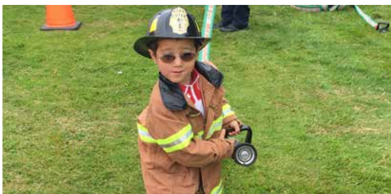
Young fire fighter at the Steveston Salmon Festival