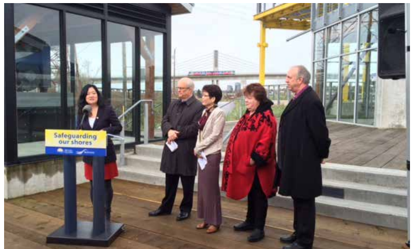
The Province of British Columbia announces $16.6 million in funding for flood mitigation programs

A partnership with Richmond School District and Richmond Virtual School (RVS) to enable High Performance (HP) athletes in grades 10, 11 and 12 to earn high school Physical Education credits for the training they complete at the Oval has continued. New in 2016, Oval HP Student Athletes are now able to complete Social Studies, English and Planning Courses through the RVS.