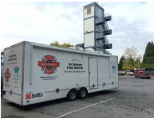
Fire and Life Safety trailer