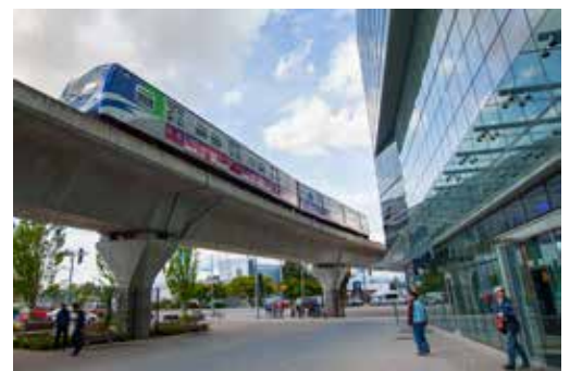
Canada Line on No. 3 Road