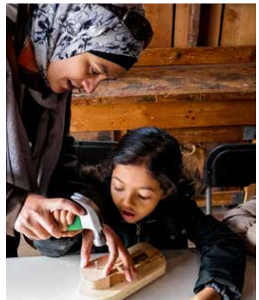
Family Day boat building