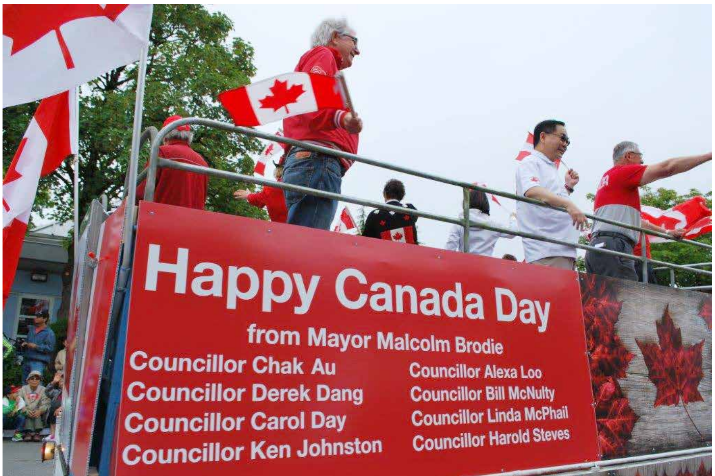
Steveston Salmon Festival