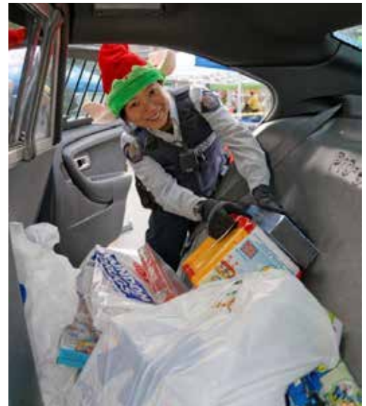
Annual Toy Drive