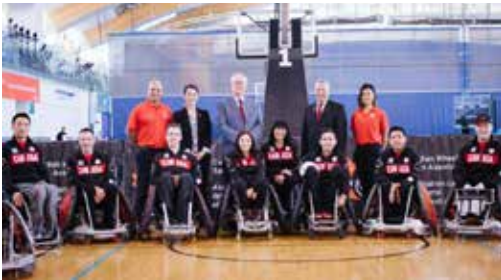
Canadian Wheelchair Rugby Team

The Library conducted targeted visits to seniors' residences, low-income housing complexes and other at-risk groups to ensure that individuals identified as having barriers to access are afforded the opportunity to utilize the programs, services and materials offered by the Library.