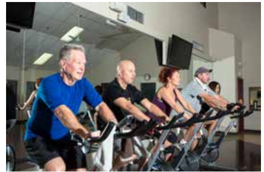
Funding received for South Arm Community Centre upgrades

In 2016, the City remained adamantly opposed to the Port of Vancouver's (the Port) intention to expand on Agricultural Land Reserve (ALR) farmland. While past City resolutions, requesting the Federal Government to prohibit the Port from purchasing more agricultural land in Richmond and to sell its existing ALR lands, were unanimously endorsed by the Lower Mainland Local Government Association (LMLGA) and the Union of BC Municipalities (UBCM), the Port has not agreed. Council will strongly continue to ask the Port to expand outside of the ALR.