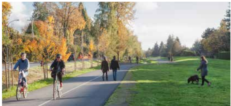
Funding received for a Railway Greenway Trail upgrade