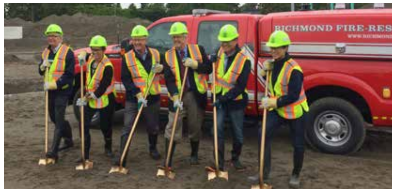
Fire Hall No. 1 Ground Breaking