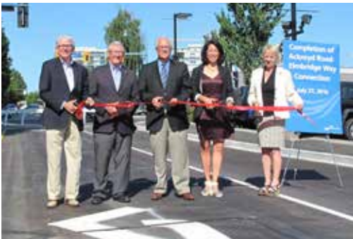
Ribbon cutting at the Ackroyd Road Elmbridge Way Connection

In October, Council gave third reading to a mixed use development in the Capstan Village area that includes a new 33,439 sq. ft. community centre in the north City Centre. The proposed community centre is envisioned as a two-storey, “stand-alone” facility located just off No. 3 Road, with easy pedestrian access to the future Canada Line station and proximity to the proposed riverfront park.