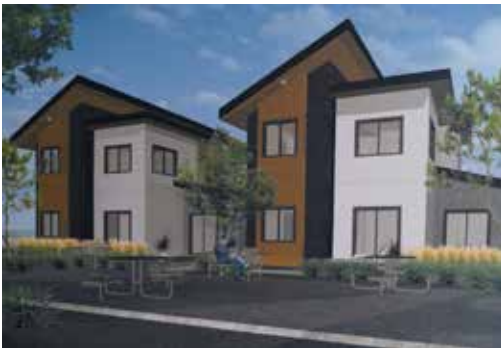
Habitat for Humanity affordable housing project rendering