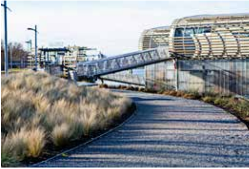
Dike Middle Arm Trail

Significant amenity contribution commitments from developers were secured in 2016 to advance the ongoing development of a continuous park/trail system along the Middle Arm. These contributions include an expanded waterfront gathering space in the Oval Village (targeted for completion in 2022), a 1.06 acre waterfront park at the foot of Capstan Way (targeted for completion in 2023), and $2.6 million for pier construction.