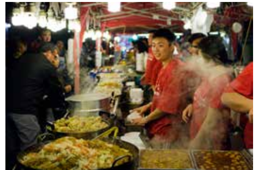
Richmond Night Market