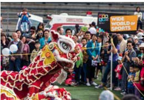
Richmond World Festival

With input from the Friends of Richmond Archives, the City implemented a Memorial Street Sign Program. A poppy is depicted on the signs of over 60 streets in the City, where the roadway is named for a Richmond soldier who died in service to Canada in World Wars I and II. The City's website provides more background on these honoured soldiers.