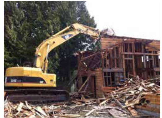
Demolition Waste and Recyclable Materials Bylaw

In keeping with the City’s sustainability goals, the COOL 2016 RICHMOND event was held at the Richmond Olympic Oval. This “event solutions expo” featured experts and vendors that shared tips on running successful, sustainable events.