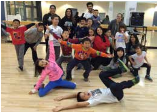
Children's dance class