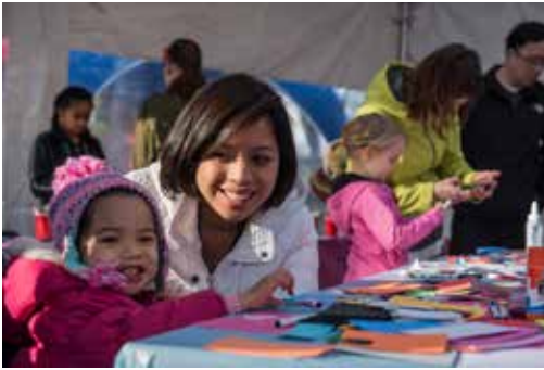
Richmond Children's Festival