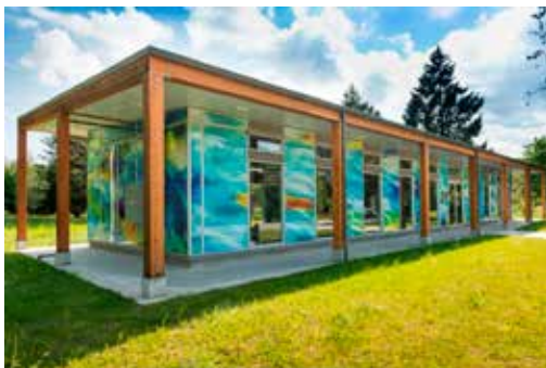
Alexandra District Energy Utility