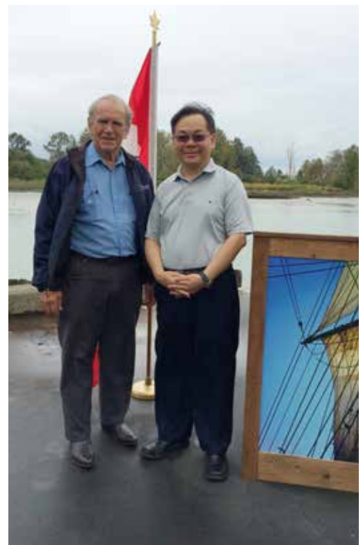
Government of Canada invests in Steveston Harbour