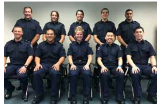
2016 new recruits