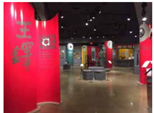
Wang Duo Leave Your Mark Exhibit