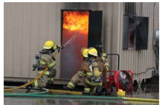
New recruit training