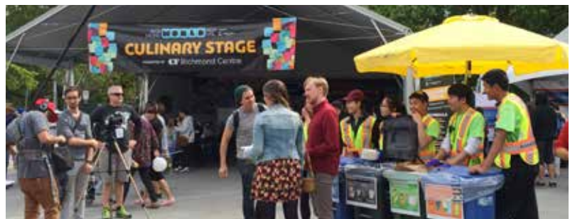
Recycling station and volunteers at Richmond World Festival

In the fall of 2016, staff planned and held the first Tree Protection Bylaw Public Information Sessions. The sessions were well attended and provided the community with a brief overview of the City's Tree Protection Bylaw and the criteria used by staff to assess trees. A total of six information sessions are planned into 2017.