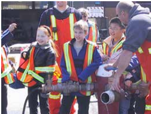
Public Works Open House