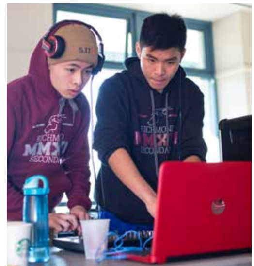
Family Day DJs