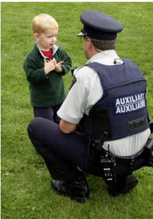
Ensuring all Richmond residents feel safe

questions, and participate in group activities with fellow students that shared similar community safety career aspirations. The speakers, who were members of Richmond Fire-Rescue, BC Ambulance, CBSA, Canadian Military and RCMP, volunteered their time to be a part of the program. In 2016, Youth Squad participation increased 19% over 2015.