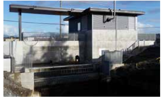
Bath Slough drainage pump station

A comprehensive Major Facilities 10-year plan was endorsed by Council that identifies the priorities for new and replacement facilities. The priorities identified include a new City Centre Community Centre North, and replacement of the animal shelter, the Steveston Community Centre, the Lawn Bowling Club and Britannia.