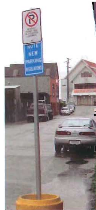
Figure 1: Laneway Signage

The Steveston Harbour Authority (SHA) offered monthly pay parking for employees at its lot on Chatham Street but SHA staff advise that only one merchant utilized the lot during the trial period. Conversely, Steveston Merchants Association (SMA) representatives advise that the underground parking lot on Bayview Street east of No. 1 Road was well-utilized by employees, which may reflect its lower monthly rate of $25 vis-à-vis $50 per month for the SHA lot.