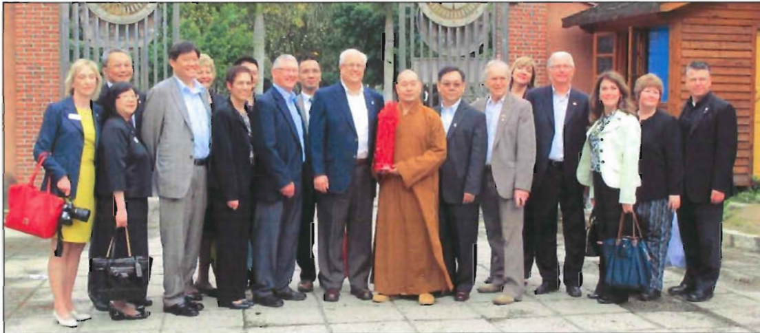
XIAMEN, APRIL 2012, TAN KAH KEE MEMORIAL MUSEUM AND SHRINE TOUR