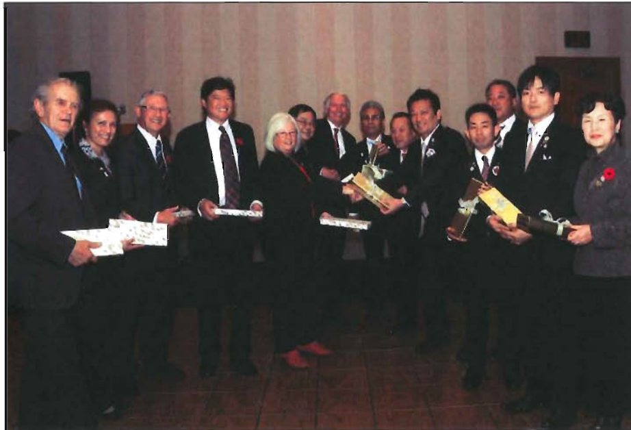
WAKAYAMA OFFICIAL DELEGATION, NOVEMBER 2012 RICHMOND AND WAKAYAMA CITY COUNCILLORS EXCHANGE