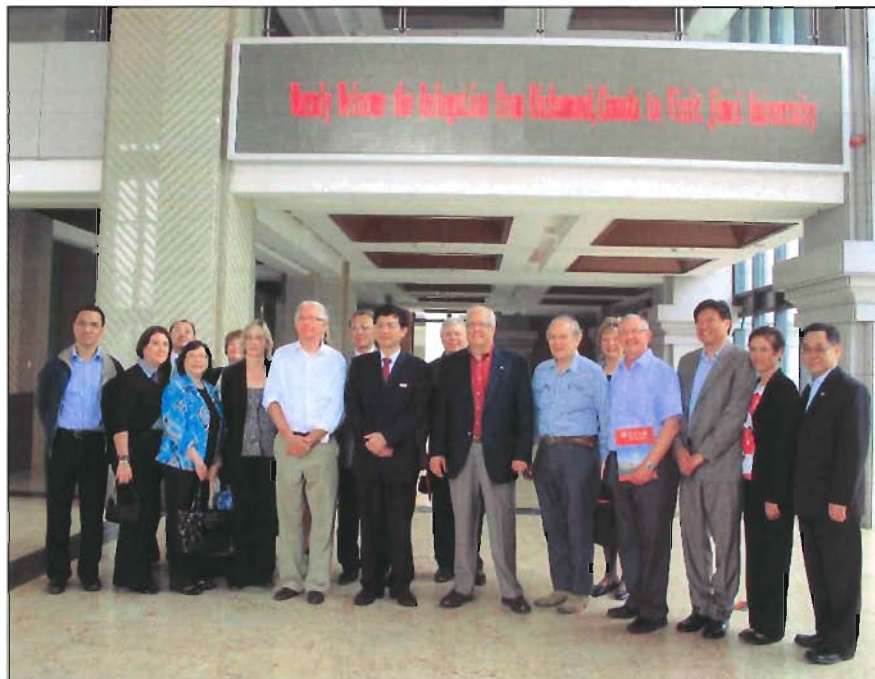
XIAMEN, APRIL 2012, JIMEI UNIVERSITY TOUR