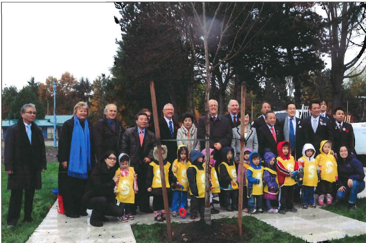
WAKAYAMA OFFICIAL DELEGATION, NOVEMBER 2012, TREE PLANTING CEREMONY MAYOR BRODIE AND MAYOR OHASHI