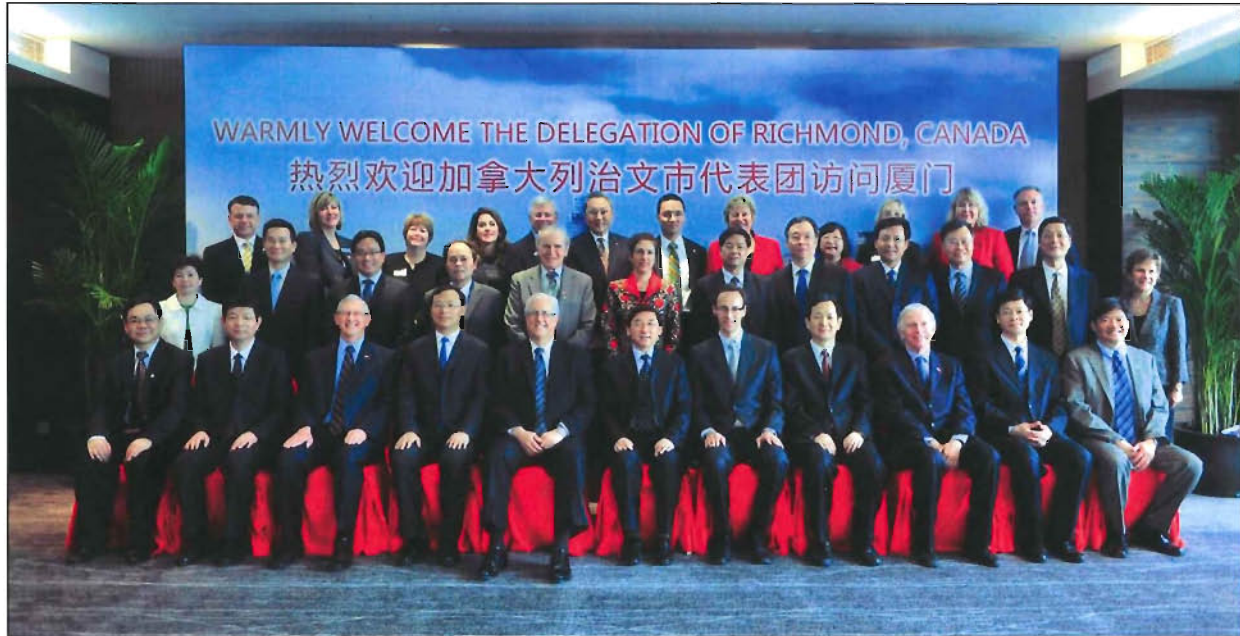
XIAMEN, APRIL 2012, MAYOR AND COUNCIL SISTER CITY DELEGATION