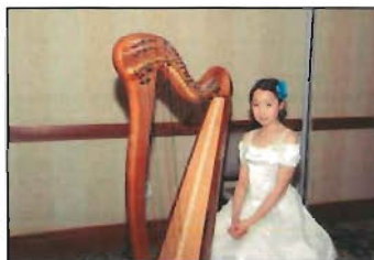
WAKAYAMA OFFICIAL DELEGATION, NOVEMBER 2012 LOCAL TALENT