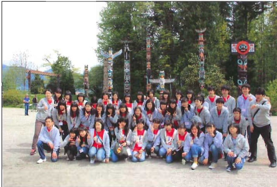
Wakayama Children's Choir Visit ~ Tour of Stanley Park