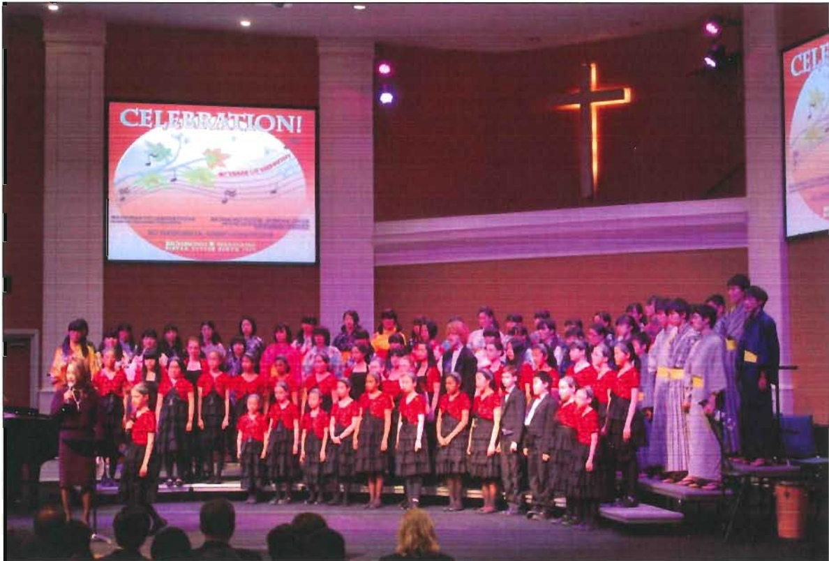
Wakayama Children's Choir Performance at Richmond Pentecostal Church