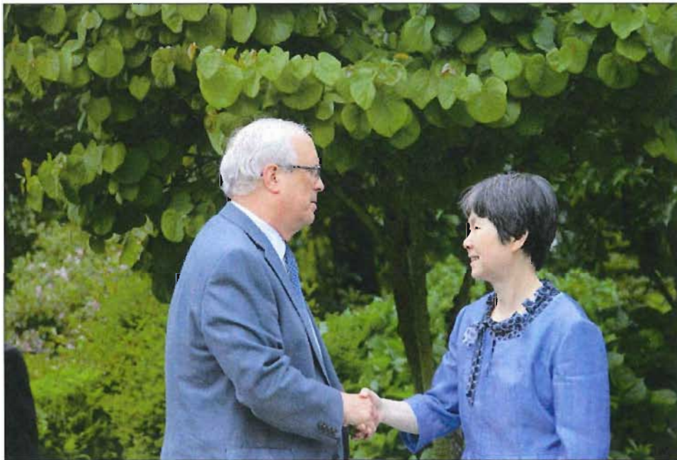
Mayor Malcolm Brodie with China Consul General, LIU Fei