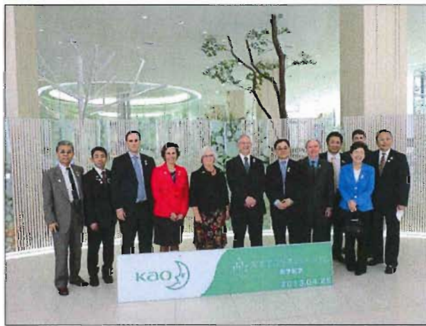
City of Richmond Official Delegation visit to Wakayama, Japan to commemorate the 40th Anniversary of our Sister City relationship