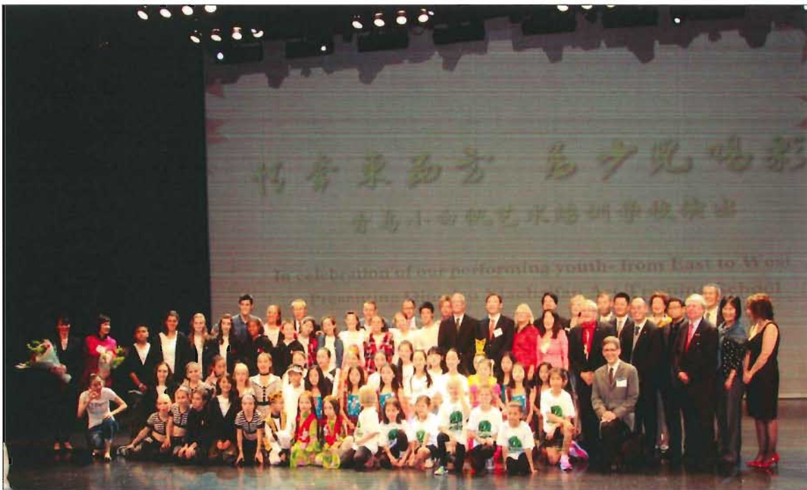
Qingdao Xiabaifan Art School Reception and Performance