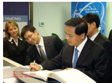
Mayor of Xiamen signs the Richmond Olympic Oval guestbook during his first Official visit