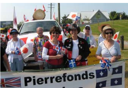
Sister City Committee members with Pierrefonds’ Banner – Salmon Festival parade