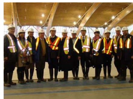
Visit to Richmond Olympic Oval by Qingdao Volunteer Association delegation, November 20, 2008