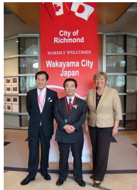
Visit of Wakayama delegation, 35th Anniversary Celebration April 29, 2008