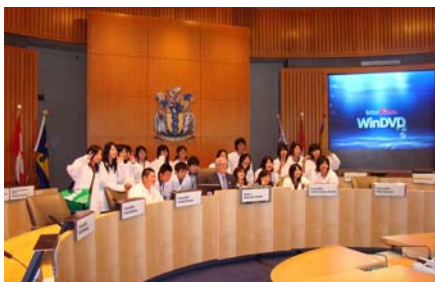
Student visit May 14th from Wakayama