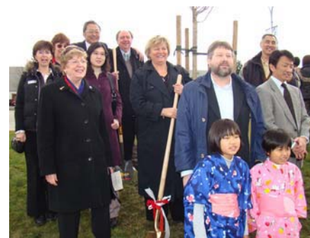
Cherry Tree Planting Ceremony, Japan Canada Relations 80th Anniversary March 31, 2008