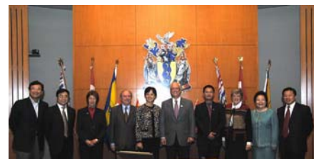
Visit of Yangzhou Goodwill & Economic Delegation, October 22, 2008