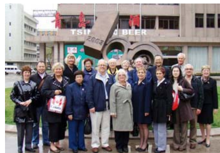
Delegation to Qingdao