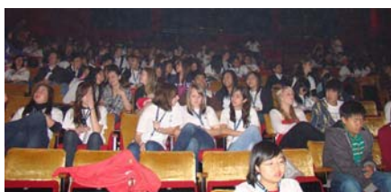
First student leadership conference – Zenith