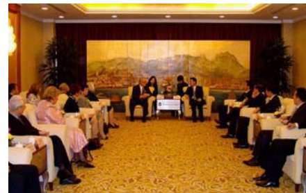
Signing of Qingdao Friendship Agreement, April 21

March 31 – Official tree planting ceremony sponsored by the Japan Consulate and the City of Richmond of Cherry trees and Maple trees on the airport side approach to the #2 Road Bridge to celebrate Japan and Canada's 80 years of relationship.