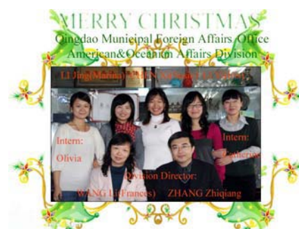
Christmas Card from Qingdao - Qingdao Foreign Affairs, with Christmas greeting, December 2008

The SCC has had a very busy year in 2008 and continues to address some of the most challenging items which include finding the time to manage the program and report out on the wide variety of outcomes that each event or delegation provides. One main outcome that has become evident during the year is that the key role of the Committee must be one of building bridges and links between respective groups and organizations in order that they take over the management of their relationship. The key communication between us and our Asian Cities is with the International Affairs Office or Foreign Affairs Office (FAO). Both sides have recognized over the year that official communications are most effective when maintained through the FAO and the SCC. To support the broad base of activities of the SCC, the Committee has developed a number of sub-committees advising and assisting in the planning and hosting of delegations and activities, as well as encouraging the formation of Friendship Societies (Richmond residents who previously came from the City or are interested and related to each City).