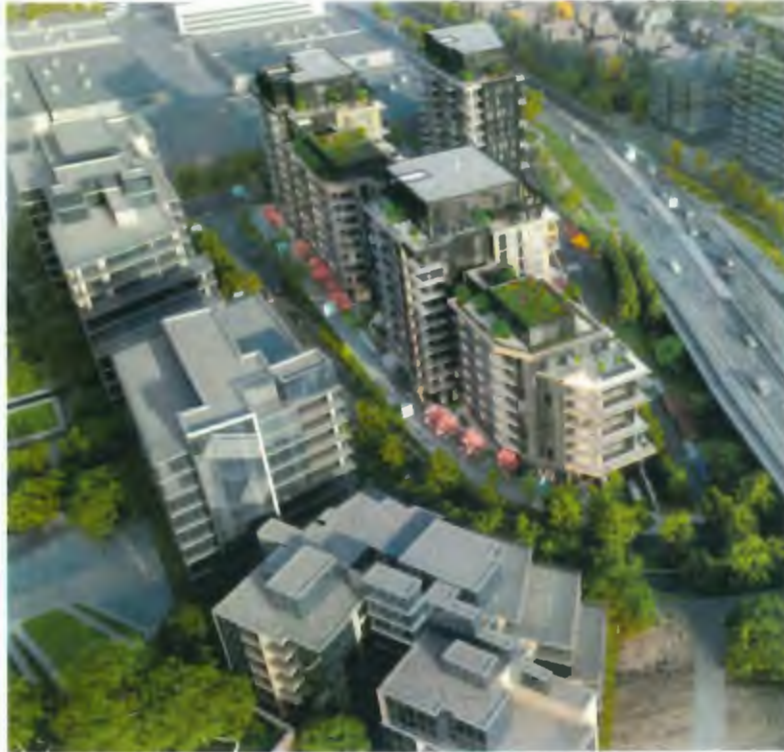
VIEW FROM THE SKY - NORTH WEST CORNER