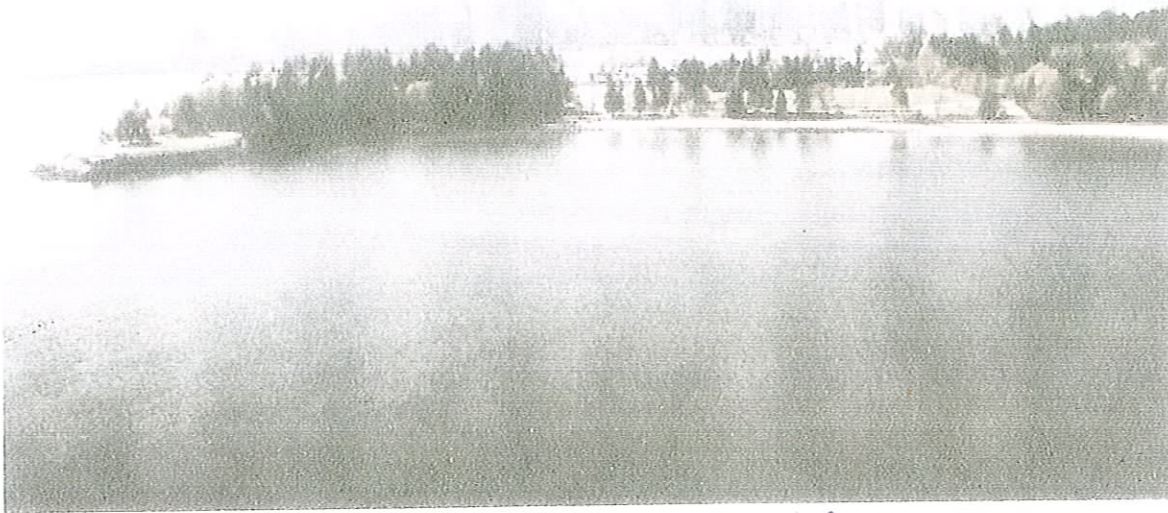
with Stanley Park