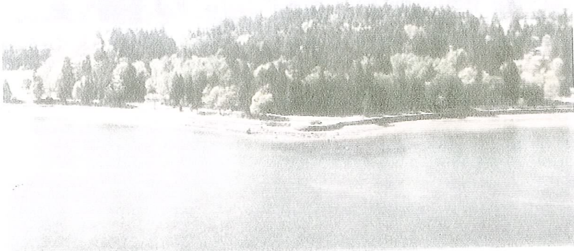
with Stanley Park