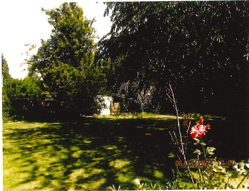
Photo of the north side of the back yard