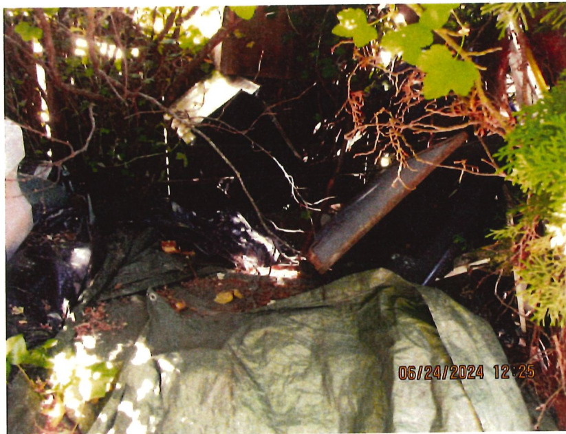
Photo of the north / west corner of the back yard 10100 Severn Drive – Photos taken June 24, 2024