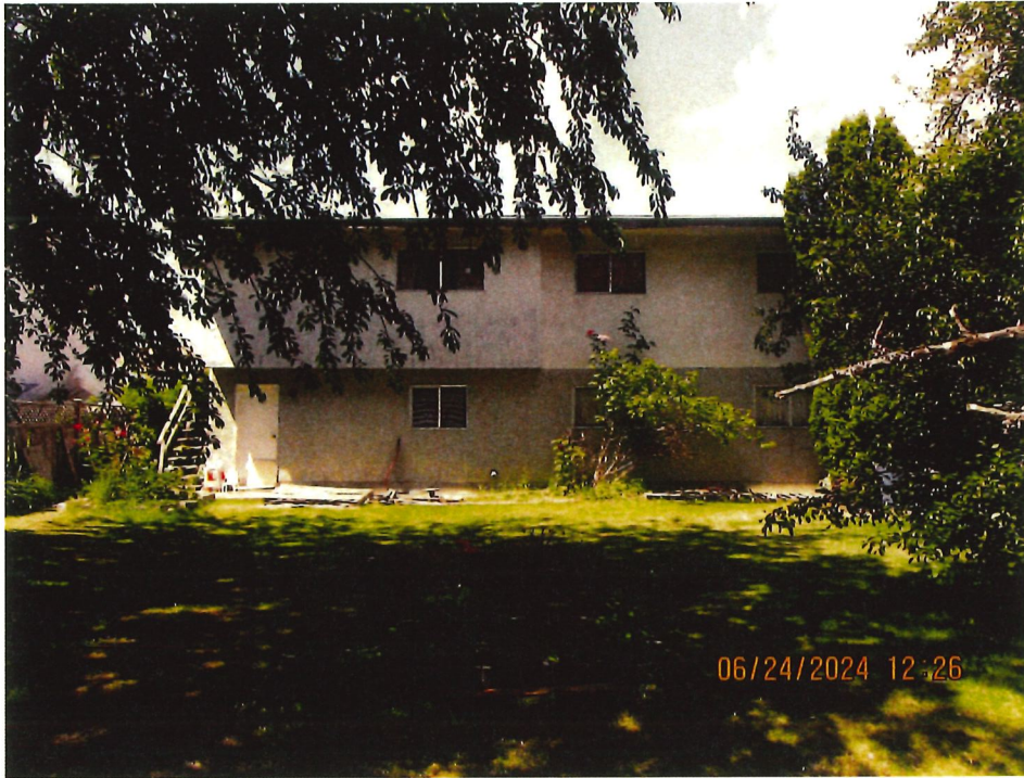
Photo of the back yard 10100 Severn Drive – Photos taken June 24, 2024