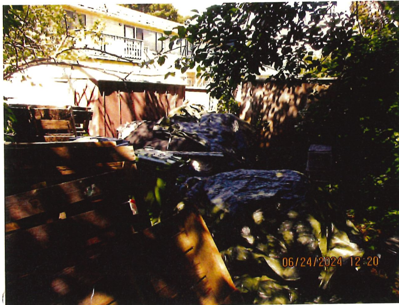
Photo of the north / east corner of the back yard 10100 Severn Drive – Photos taken June 24, 2024