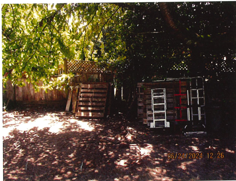
Photo of the south / east side of the back yard 10100 Severn Drive – Photos taken June 24, 2024