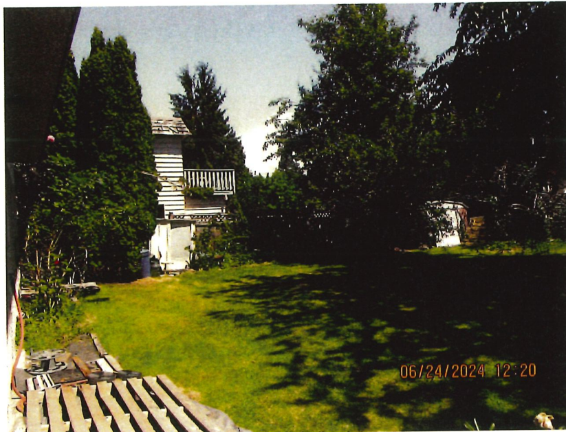
Photo of the north side of the back yard