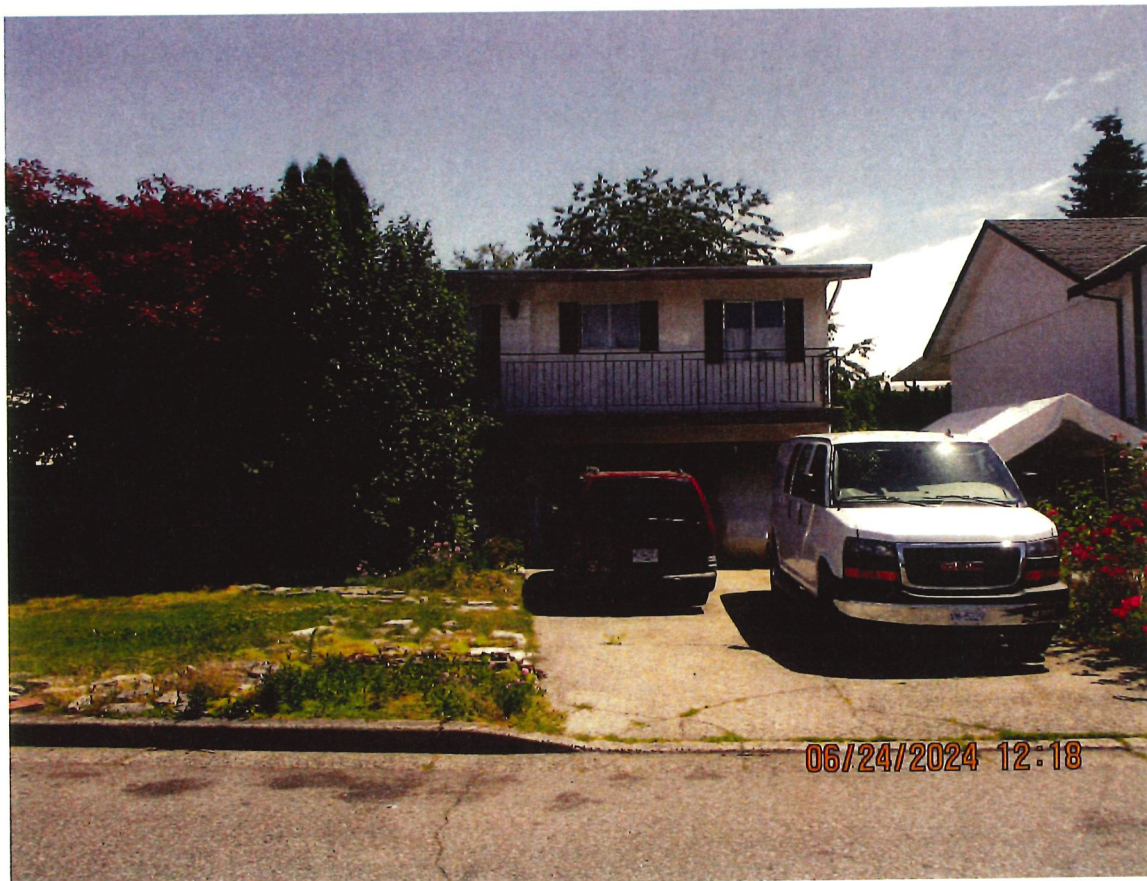
Photo of the front yard 10100 Severn Drive – Photos taken June 24, 2024