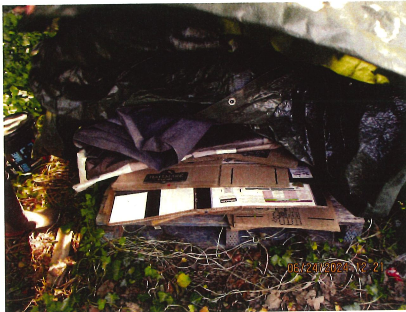
Photo of the north / east corner of the backyard 10100 Severn Drive – Photos taken June 24, 2024