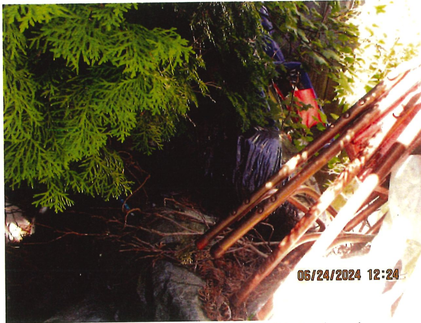
Photo of the north / west corner of the back yard 10100 Severn Drive – Photos taken June 24, 2024