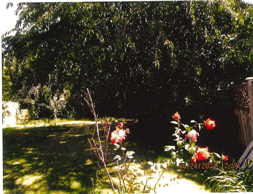
Photo of the south side of the back yard