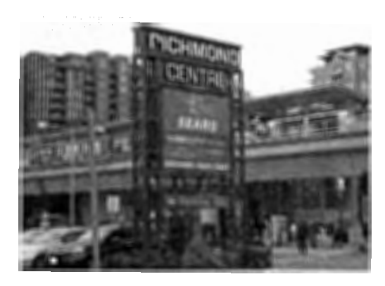
Richmond Centre is the 12th most profitable mall in Canada

Richmond News NOVEMBER 17, 2018 07:01 AM