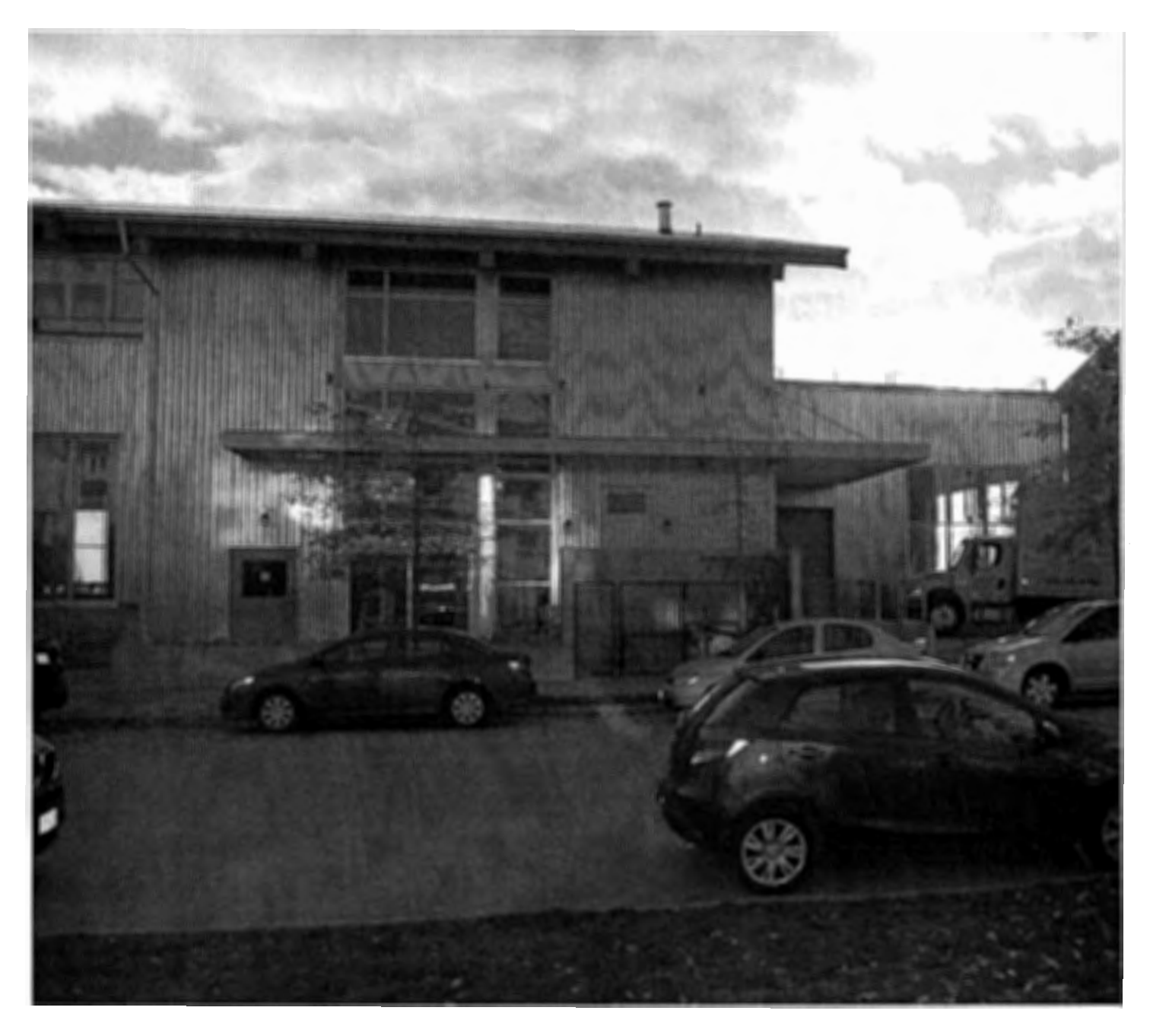
Picture 0155 has a better view of the loading dock and shows the 5 ton truck blocking half the entrance to the parking lot.