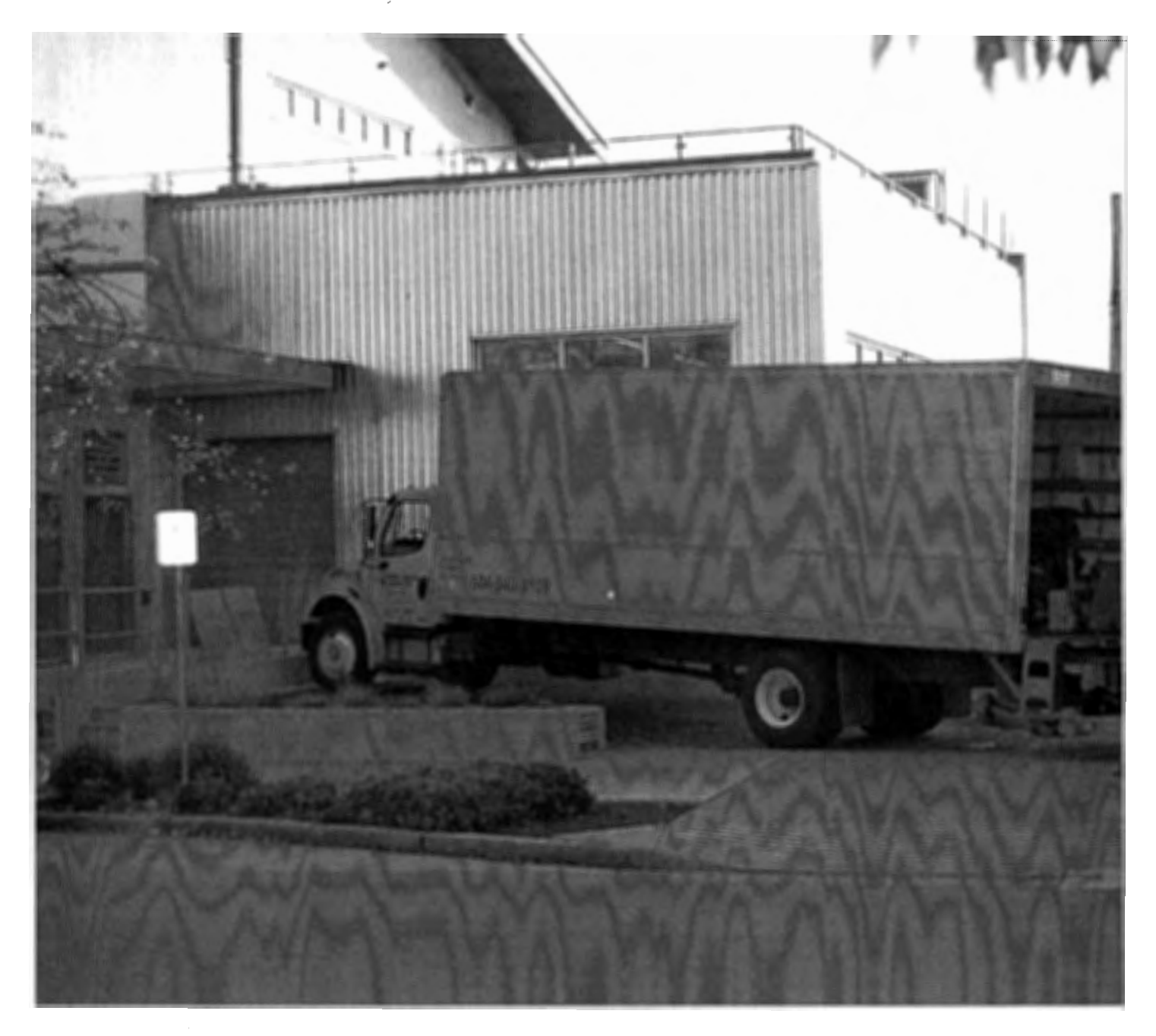
Please reconsider any changes to the zoning for this whole complex. Come and see for yourself the many problems with Onni's proposals. More pictures are available if you wish.

Vern Renneberg 4211 Bayview St. 604 274 5761